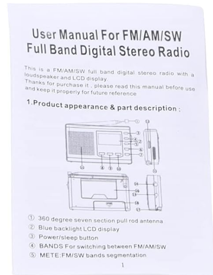
English User Manual