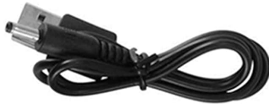
DC5V USB cable