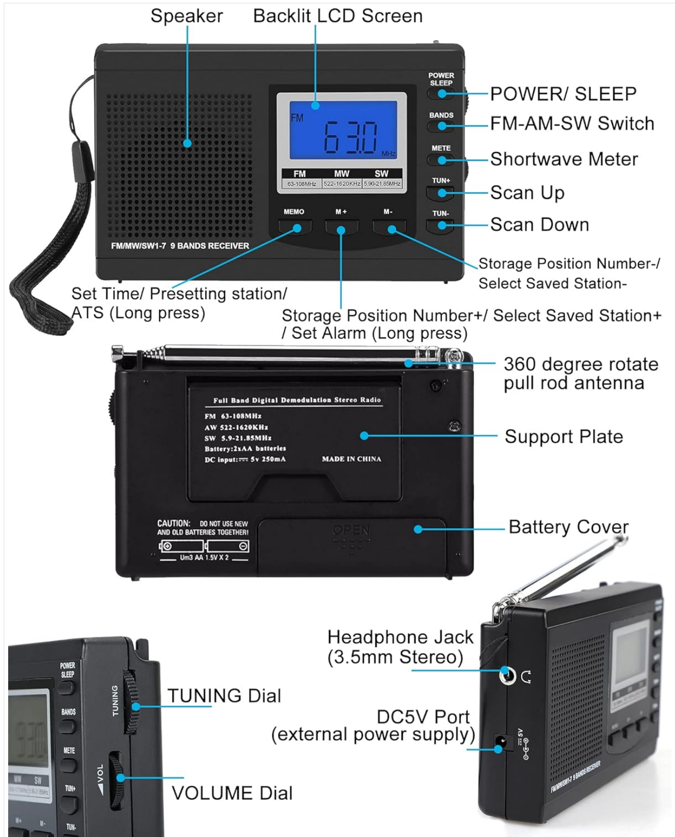
Figure 6.3: The radio features an alarm clock function to wake you up to your favorite station and a user-friendly sleep timer for automatic shutdown.

When the radio is on, long press the POWER/SLEEP button repeatedly to cycle through the sleep timer options (e.g., 90, 60, 30, 10 minutes, OFF). The radio will automatically turn off after the selected duration.