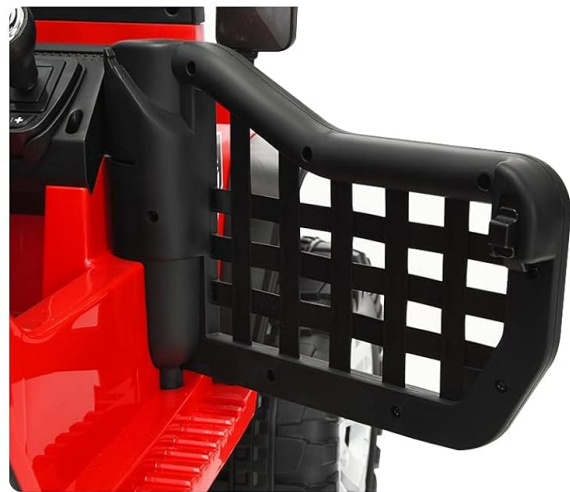
Openable door with lock

Image: Close-up of the comfortable seat with safety belt and easy-grip handle.