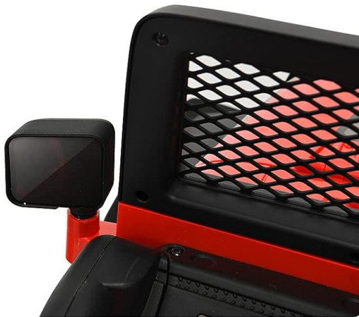
Rearview mirror & head grid window