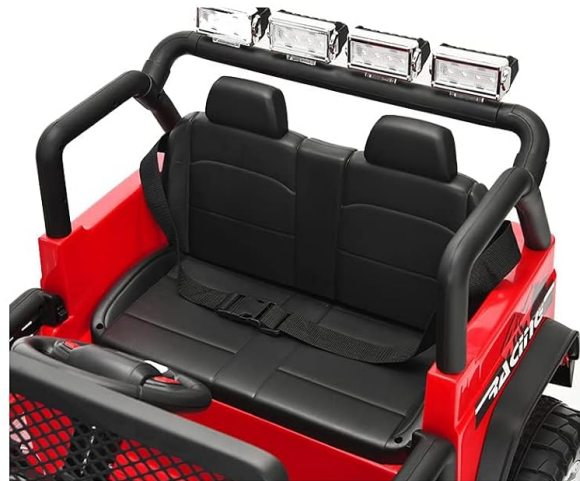
Comfortable seat & safety belt