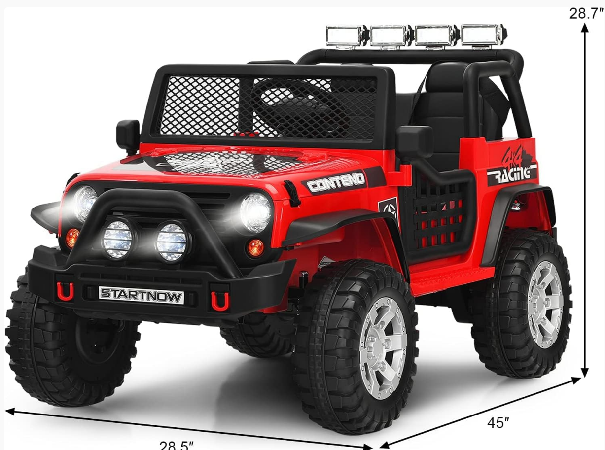
Image: Product dimensions diagram.