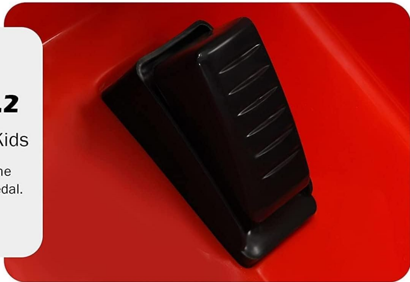
Image: Illustration of the remote control and the foot pedal, highlighting the two operational modes.