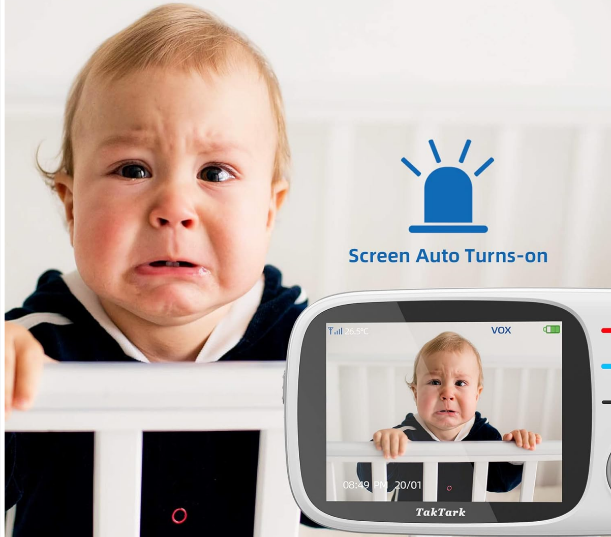
Image: A baby crying, illustrating the VOX sound activation feature where the monitor screen automatically turns on when sound is detected.