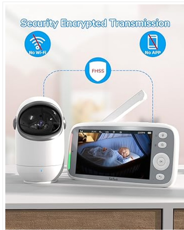
Image: The baby monitor and camera illustrating secure encrypted transmission with 'No Wi-Fi' and 'No App' indicators, emphasizing privacy.

The system operates without Wi-Fi or a mobile app, ensuring a private and secure connection that cannot be accessed by unauthorized users. The FHSS technology encrypts the transmission for enhanced privacy.