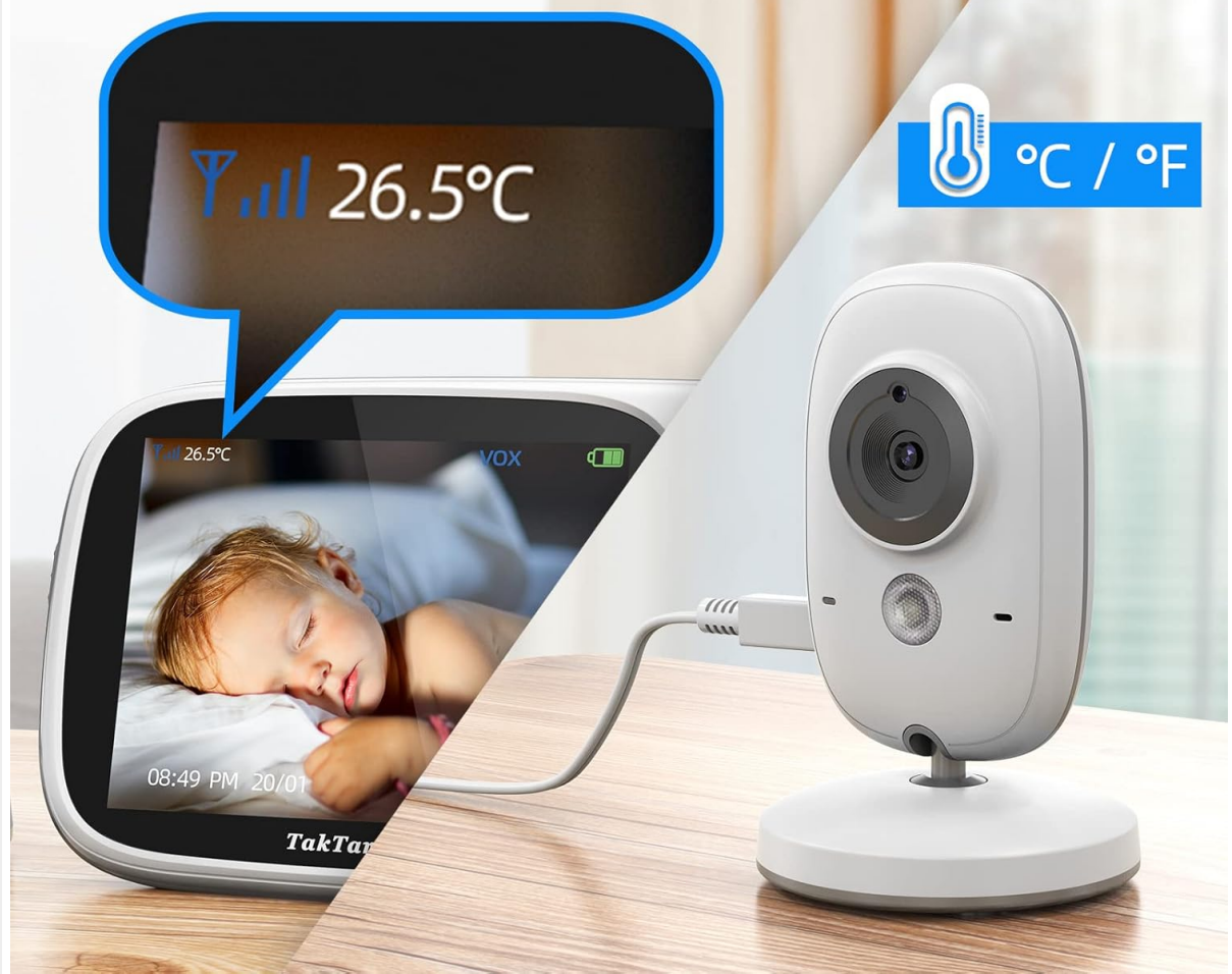
Image: The monitor displaying the room temperature (26.5°C) alongside the baby's image, illustrating the temperature monitoring feature.