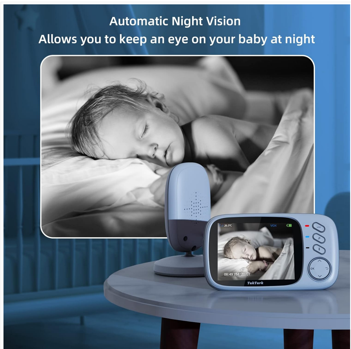
Image: A baby sleeping peacefully in a crib, with the monitor displaying a clear night vision view, demonstrating the automatic night vision feature.

The Baby Unit is equipped with infrared LEDs that automatically activate in low-light conditions, providing a clear black-and-white image of your baby even in complete darkness. The infrared light emitted is very low and will not disturb your baby.