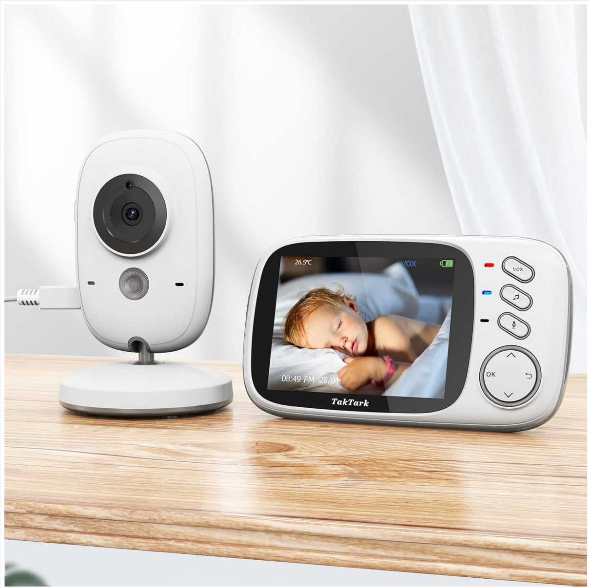
Image: The TakTark BM603-EU-B Parent Unit (monitor) and Baby Unit (camera) side-by-side.