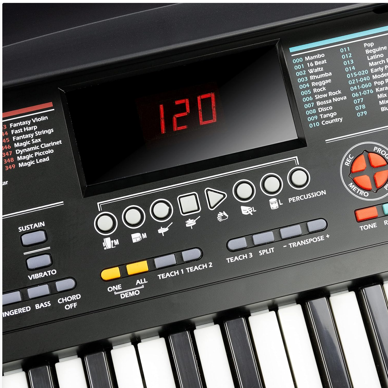
A close-up of the RockJam keyboard's central control panel, highlighting the LED display, percussion pads, and buttons for selecting tones, rhythms, and activating learning modes.

The keyboard features 200 Tones, 200 Rhythms, and 40 Demo Songs. Refer to the printed list on the keyboard's control panel for specific numbers.