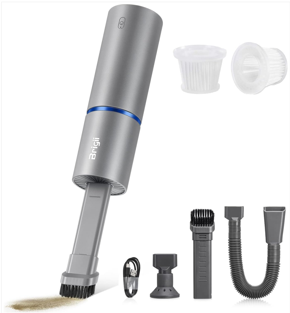
Image: Brigii Mini Vacuum Cleaner Y120PRO with its various attachments and extra filters.