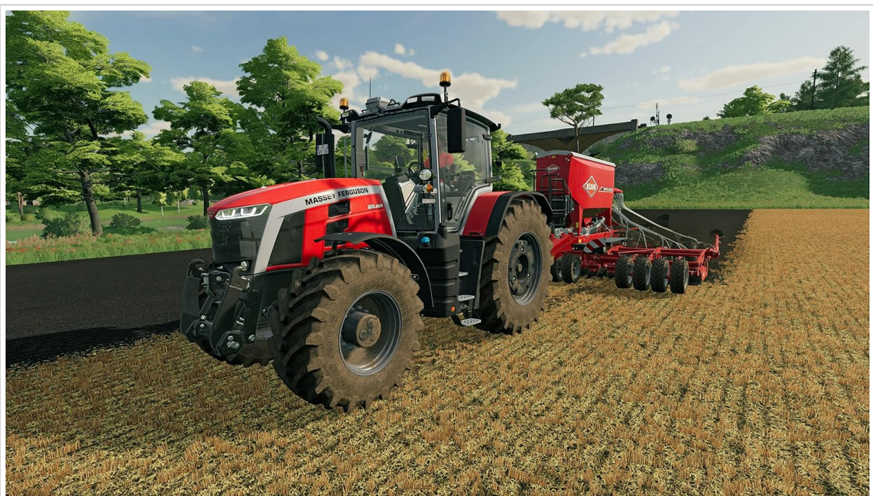
Figure 3: Red tractor with a seeding attachment.