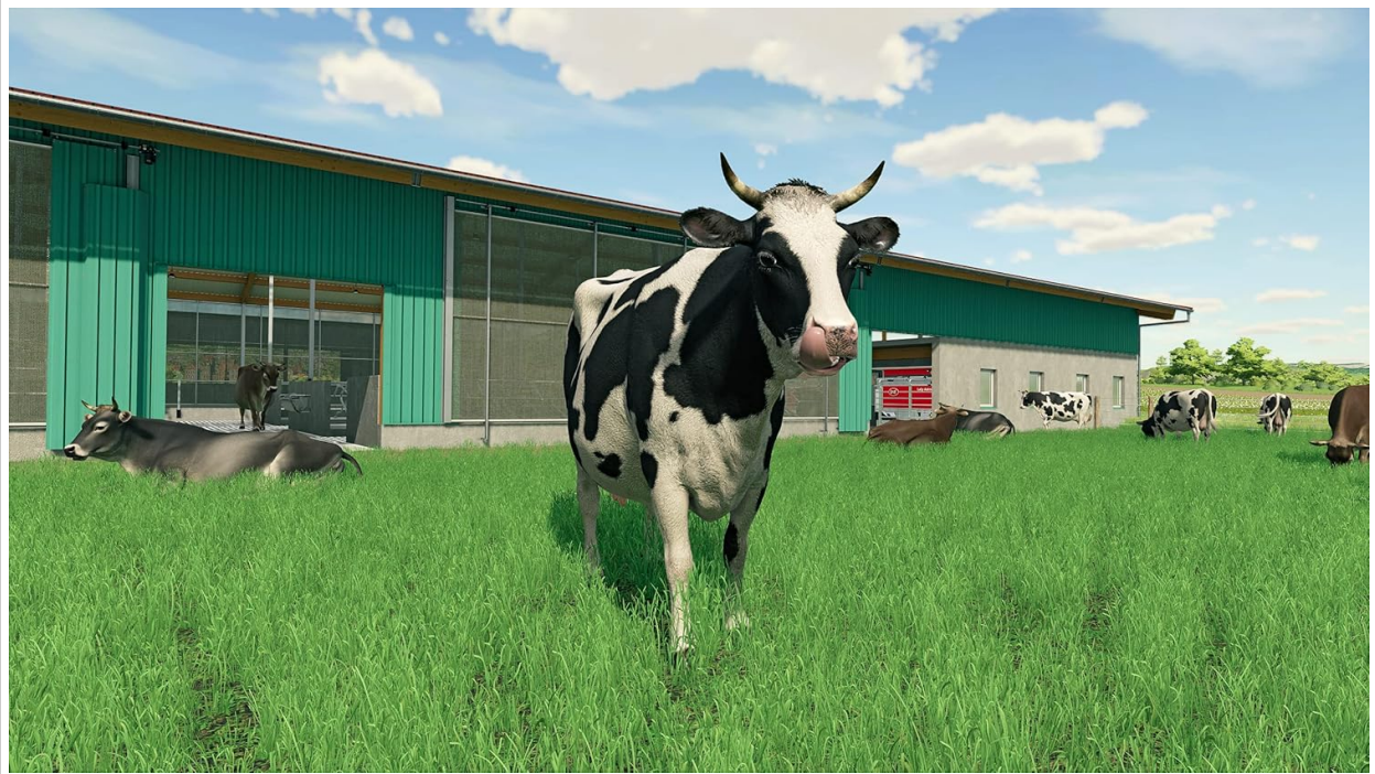
Figure 4: Dairy cow in a pasture.

Diversify your farm by raising various animals. Manage livestock such as sheep, pigs, cows, and chickens. This involves providing feed, maintaining their enclosures, and utilizing their products for profit or further processing within your production chains.