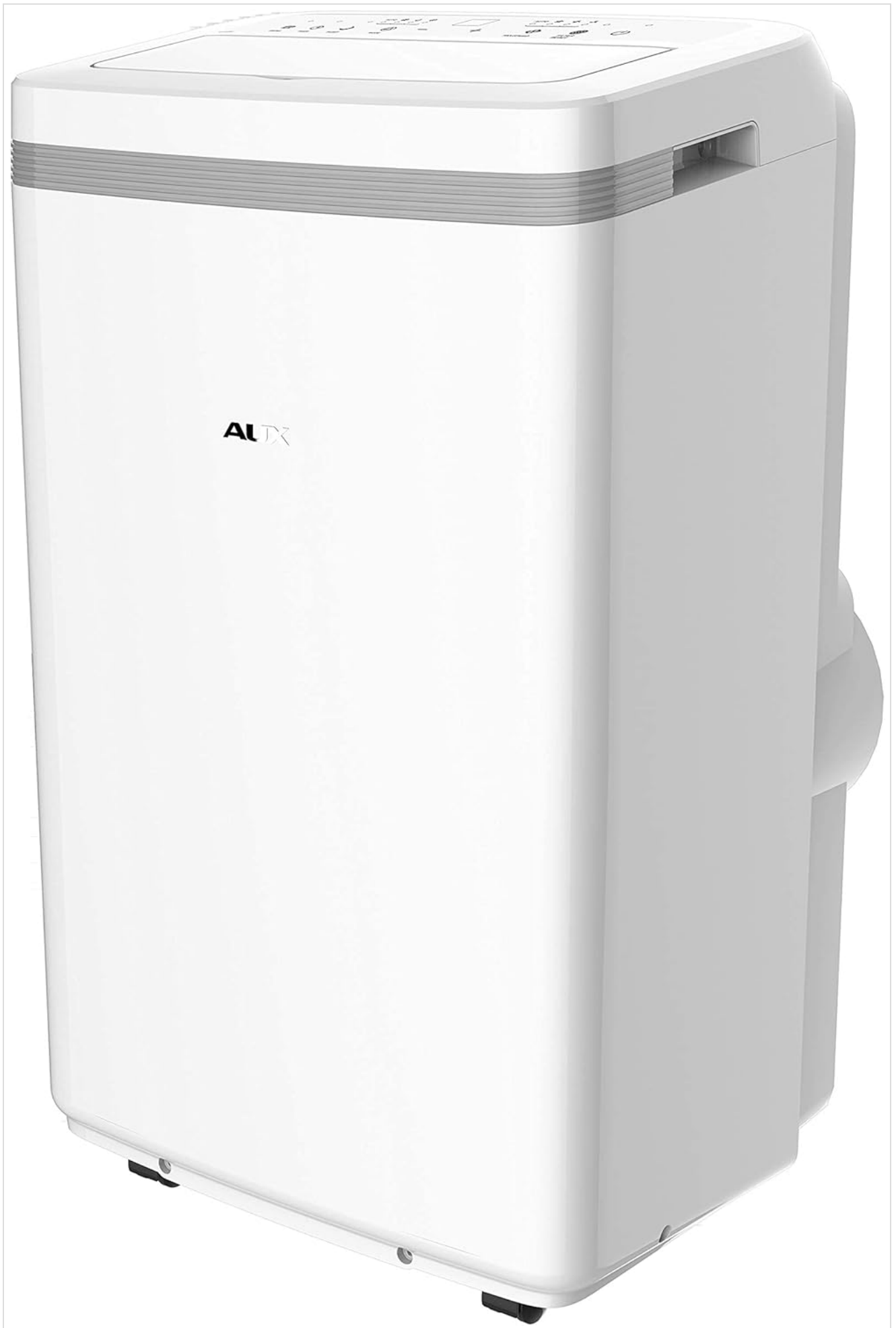
Figure 1: Front view of the AuxAC MF-13KC Portable Air Conditioner. The unit is white with a control panel on top and the AuxAC logo on the front.