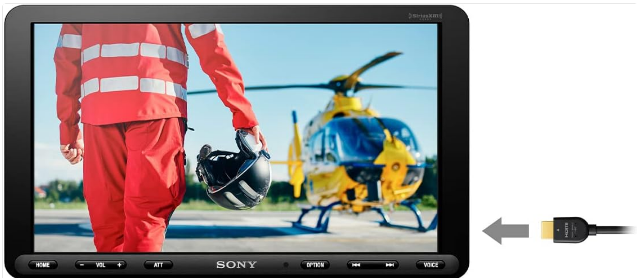
Figure 3.3: The XAV-AX8100 displaying video content via its HDMI input.

The XAV-AX8100 includes an HDMI input for connecting external video sources. This allows you to display content from compatible devices directly on the 9-inch screen.