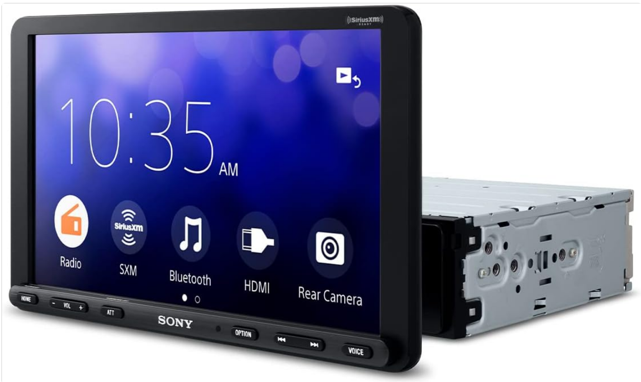
Figure 2.1: Side view illustrating the single-DIN chassis and the adjustable floating display of the XAV-AX8100.

installation is recommended to ensure proper wiring and secure mounting.