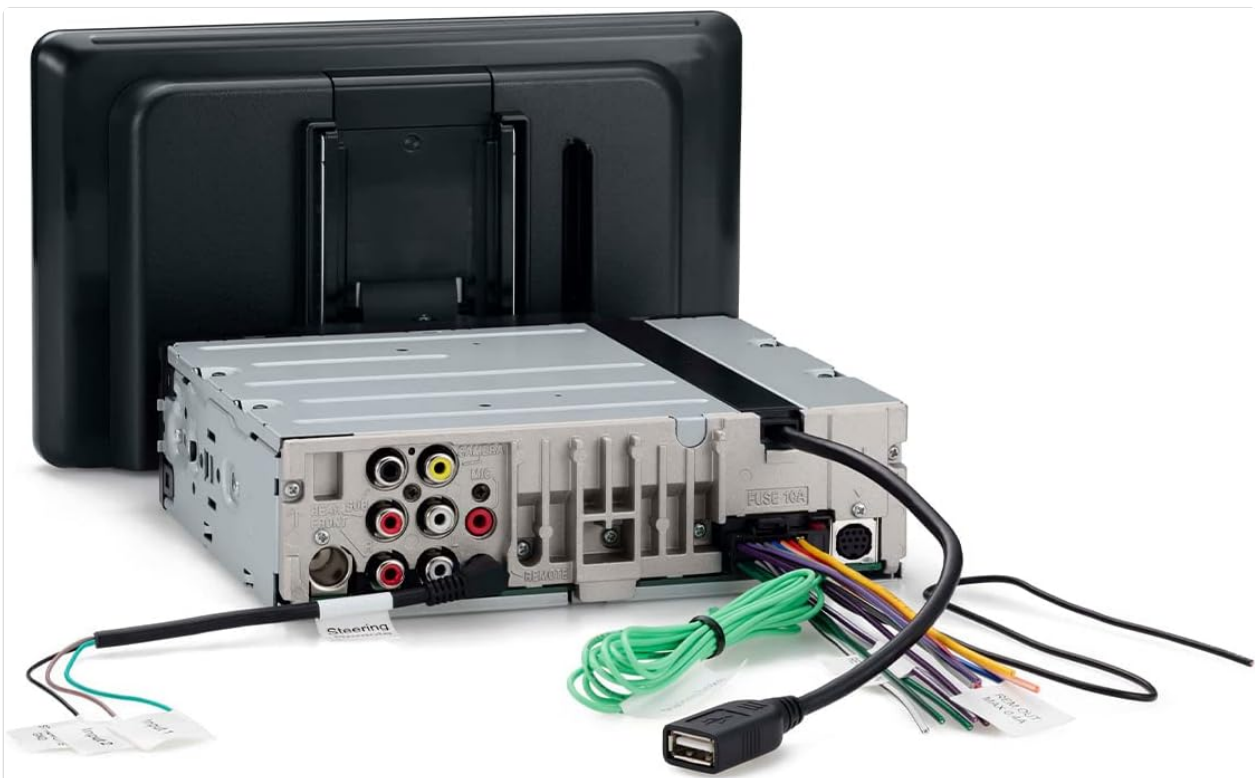
Figure 2.2: Rear connections of the XAV-AX8100, including the wiring harness for power and speakers.