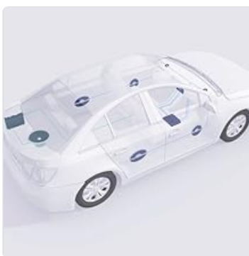
Figure 3.5: Visual representation of Dynamic Stage Organizer creating virtual speakers.