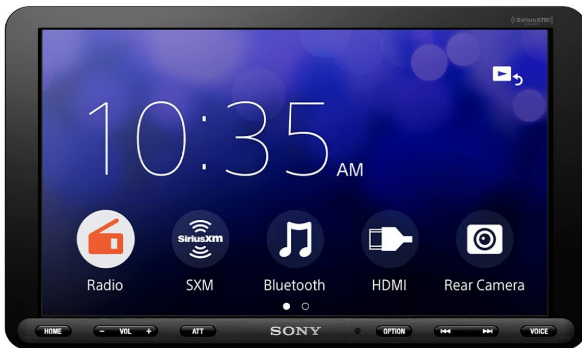
Figure 1.1: Front view of the Sony XAV-AX8100 Multimedia Receiver, showcasing its large 9-inch display.