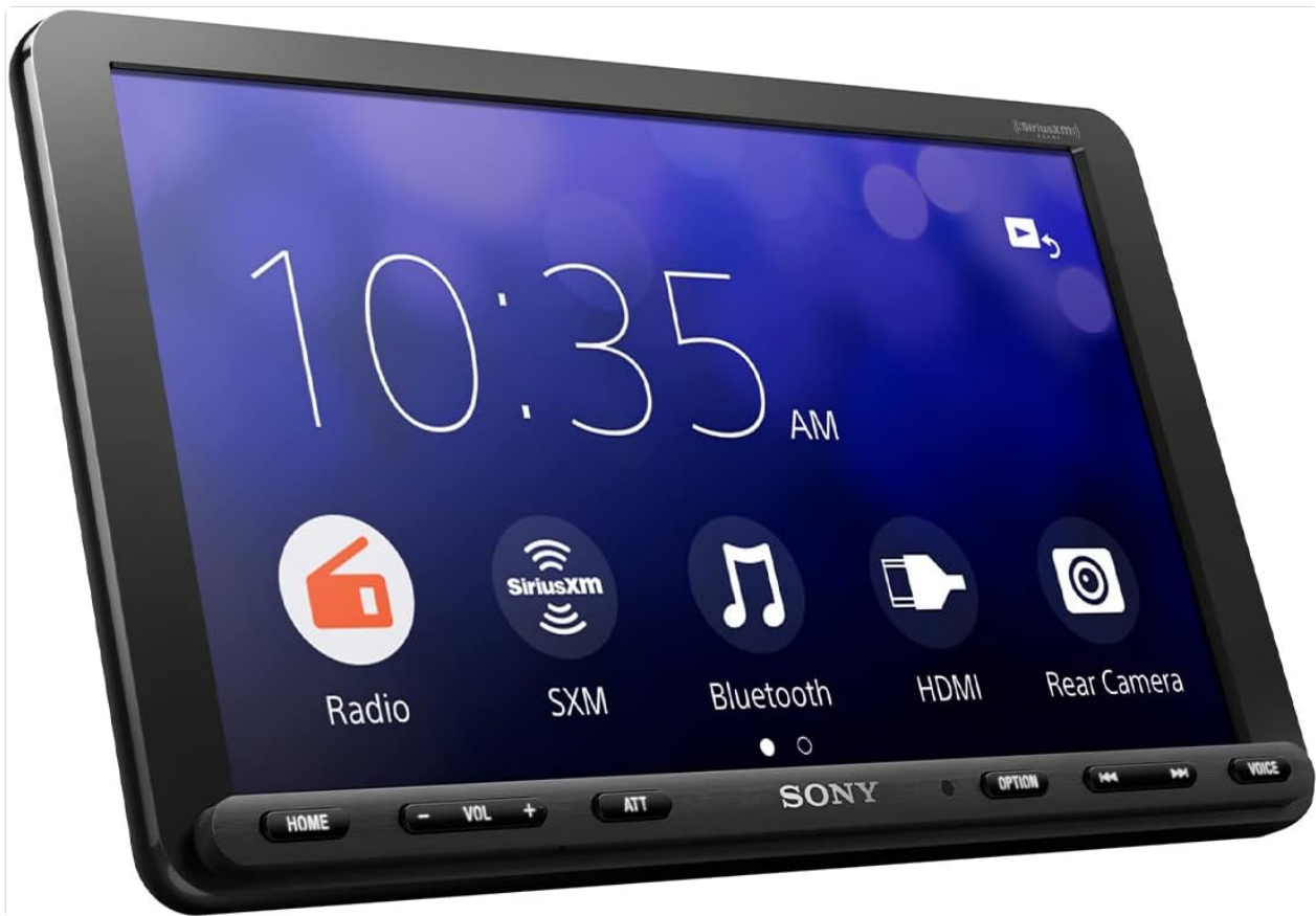
Figure 3.1: The main screen of the XAV-AX8100, providing quick access to primary functions.

The XAV-AX8100 features a responsive touchscreen for navigating menus, selecting functions, and controlling media playback. The main screen displays time, radio, SiriusXM, Bluetooth, HDMI, and Rear Camera options.