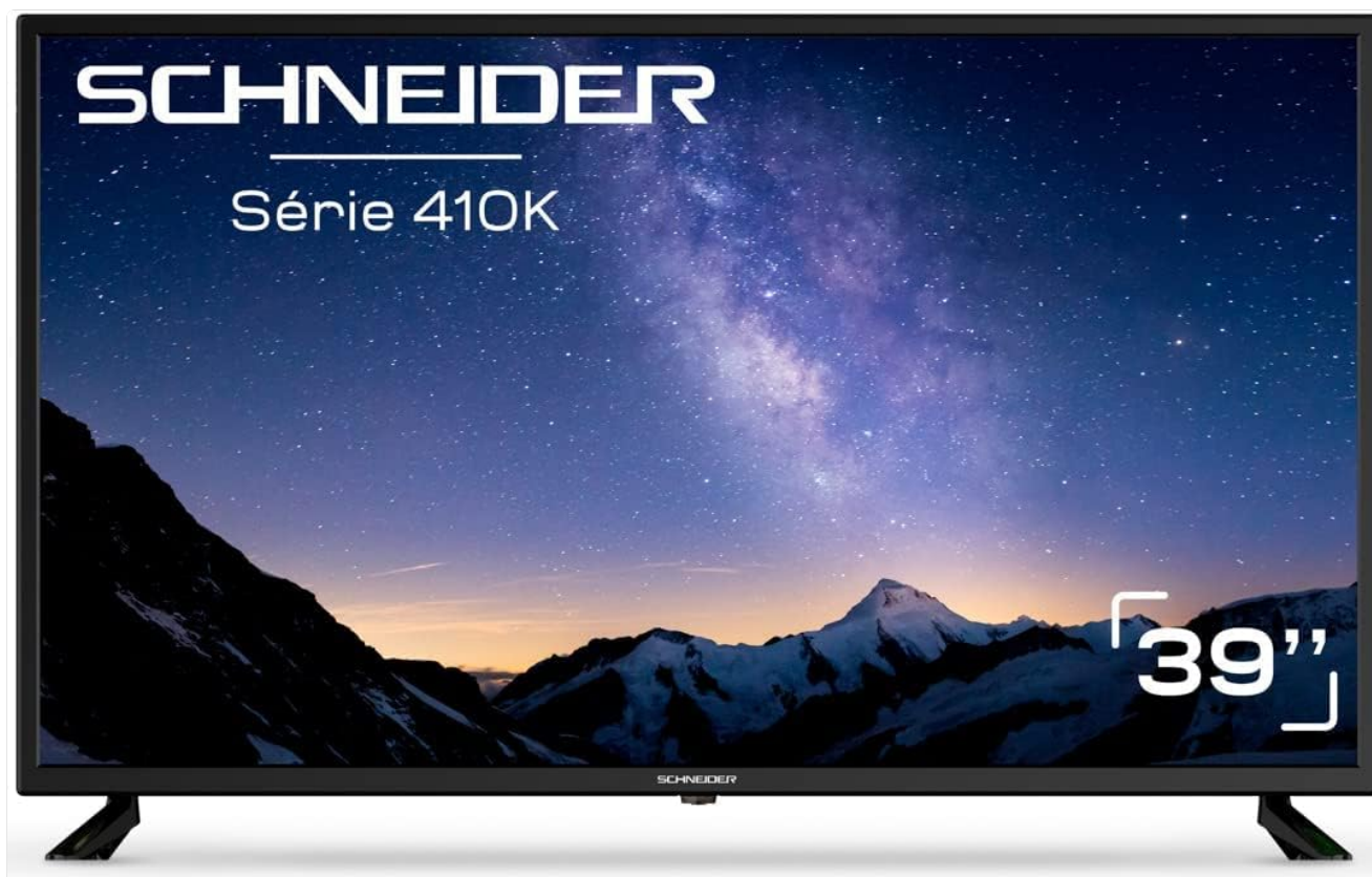
Figure 2.1: Front view of the SCHNEIDER LED39SC410K television. This image shows the sleek design of the 39-inch LED TV with its display and minimal bezels.