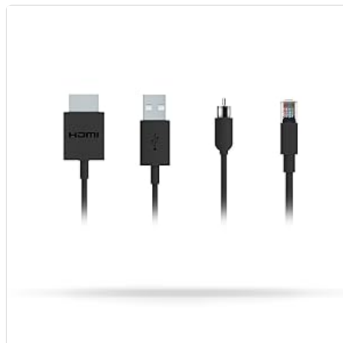
Figure 3.2: Common connection cables. Use the appropriate cables for your devices, such as HDMI for high-definition video and audio, or USB for media playback.