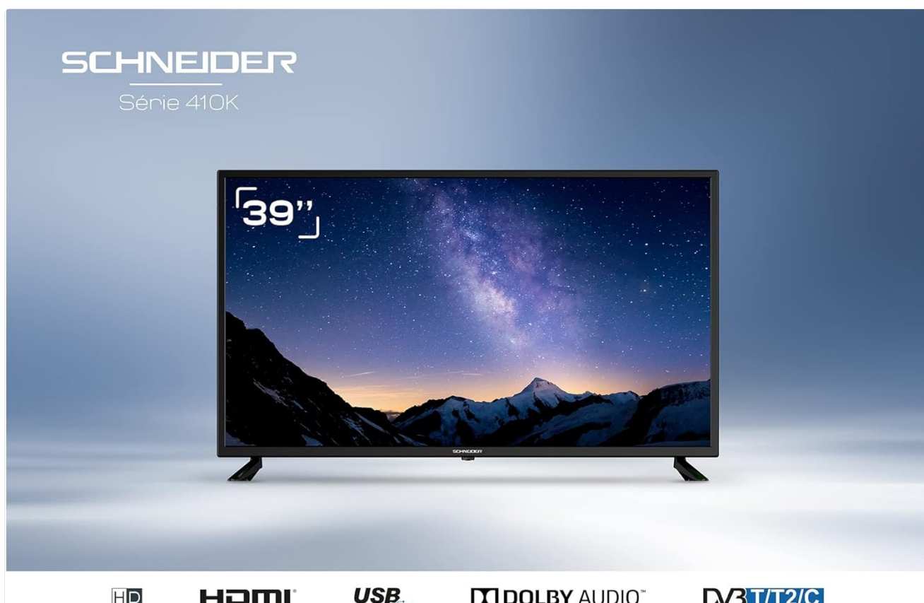
Figure 2.2: The SCHNEIDER LED39SC410K TV highlighting key features such as HD resolution, HDMI connectivity, USB support, Dolby Audio, and DVB-T/T2/C tuner compatibility.