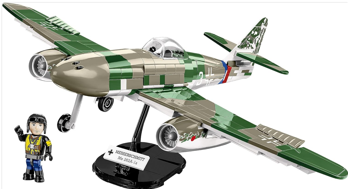
Image: The fully assembled COBI Messerschmitt Me 262A-1A model, including the pilot figure and its dedicated display stand.

The COBI blocks are designed for a precise fit and are fully compatible with other leading brands of construction blocks, allowing for creative expansion if desired.