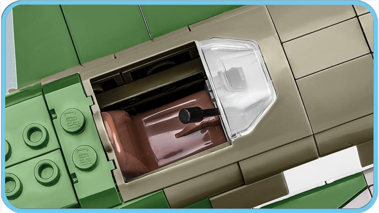
Image: A detailed view of the Messerschmitt Me 262A-1A cockpit, showing the open canopy and interior.