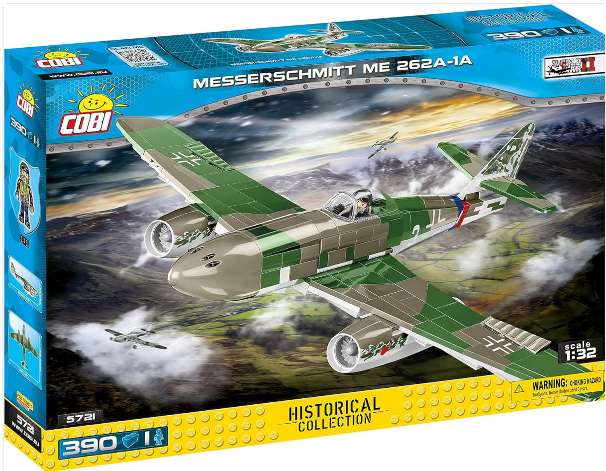
Image: Front view of the COBI Messerschmitt Me 262A-1A model kit box, showing the assembled aircraft and included pilot figure.