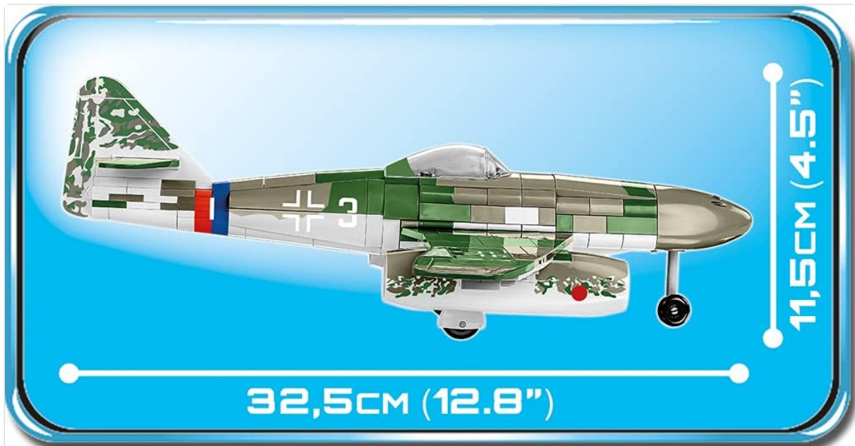
Image: Side profile of the assembled model showing its length (32.5cm / 12.8") and height (11.5cm / 4.5").