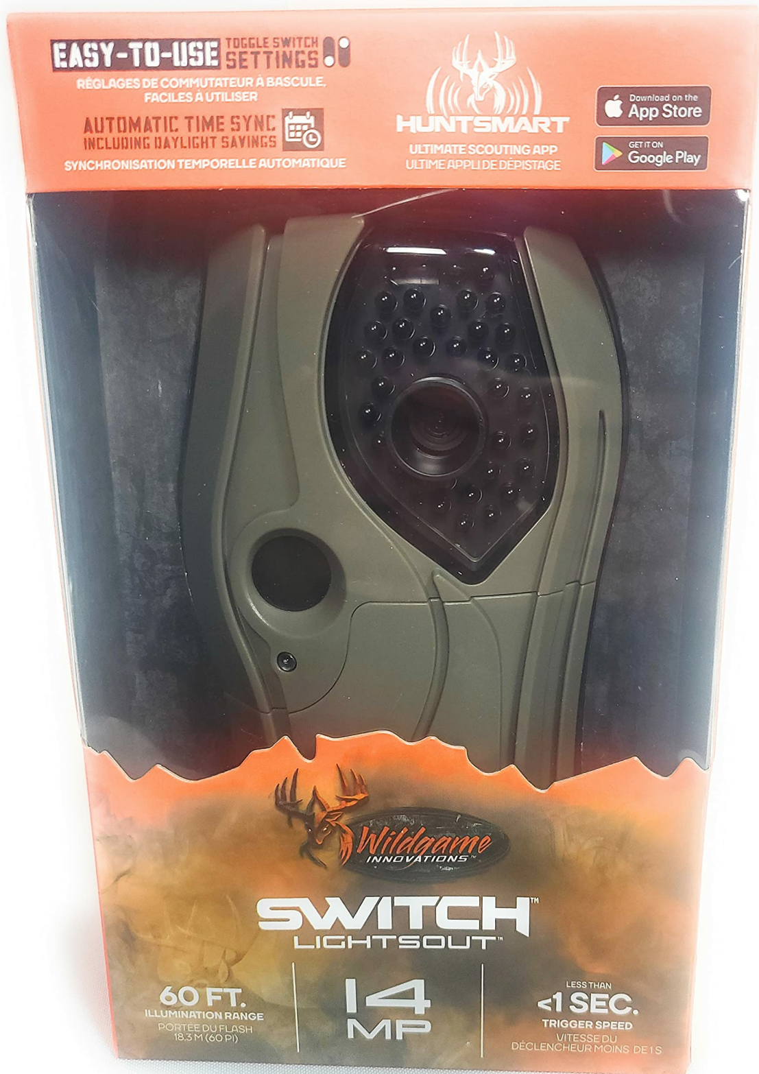
Image 1.1: Front view of the Wildgame Innovations Switch Trail Camera packaging.