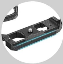
Quick Release Plate for Arca