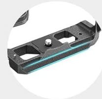
Quick Release Plate for Arca

Image: Quick disassembly and assembly with Arca-Swiss plate.