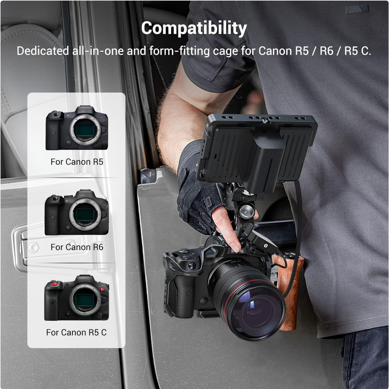
Image: Compatible camera models.