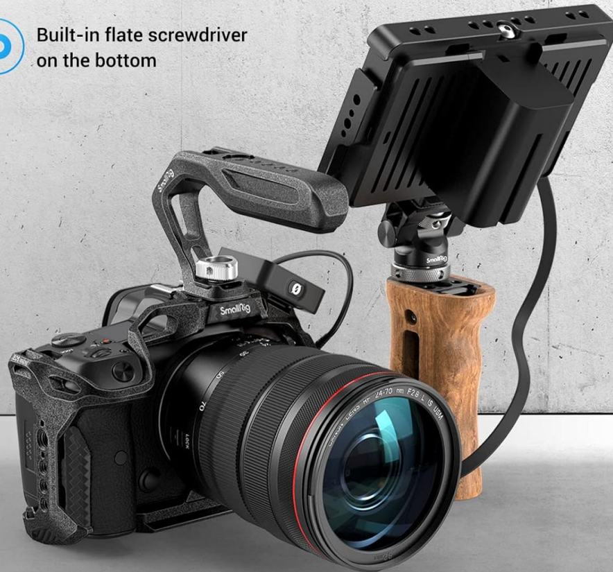
Image: Rich mounting points.