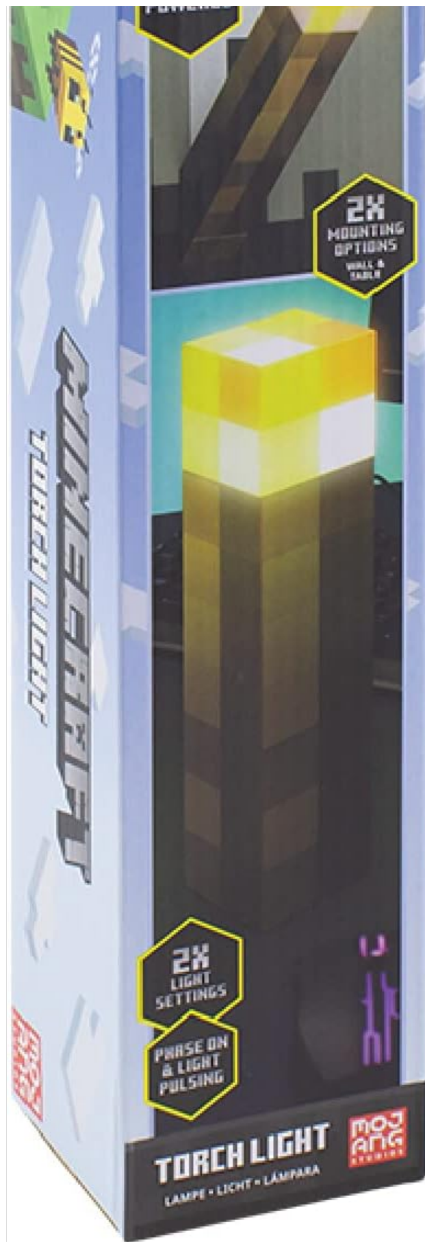
Figure 5: Dimensions of the Paladone Minecraft Torch Light.