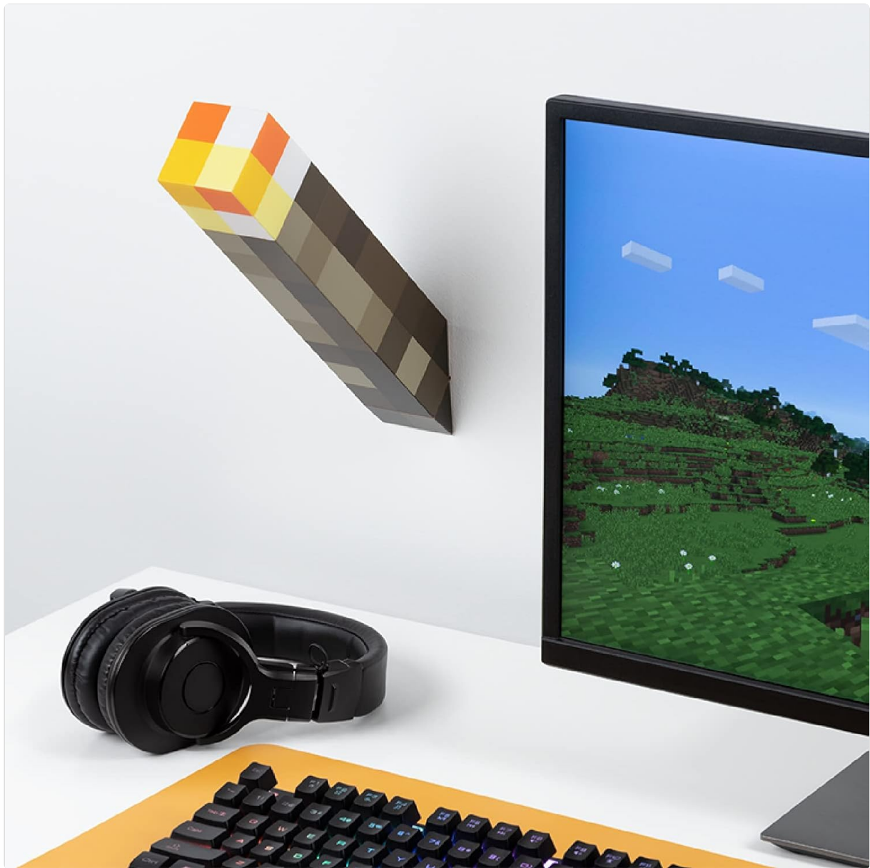
Figure 3: Minecraft Torch Light displayed on a wall, illuminating the area.