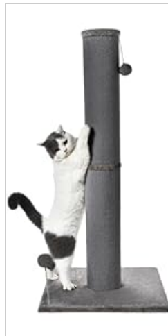
Image: The scratching post highlighting its interactive toy ball, sturdy post, spring ball, and soft wide pads, all designed for cat engagement.