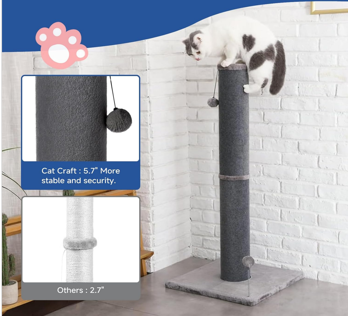
Image: A fully assembled Cat Craft Bobcat Cat Scratching Post, showcasing its tall, carpeted design and sturdy base.