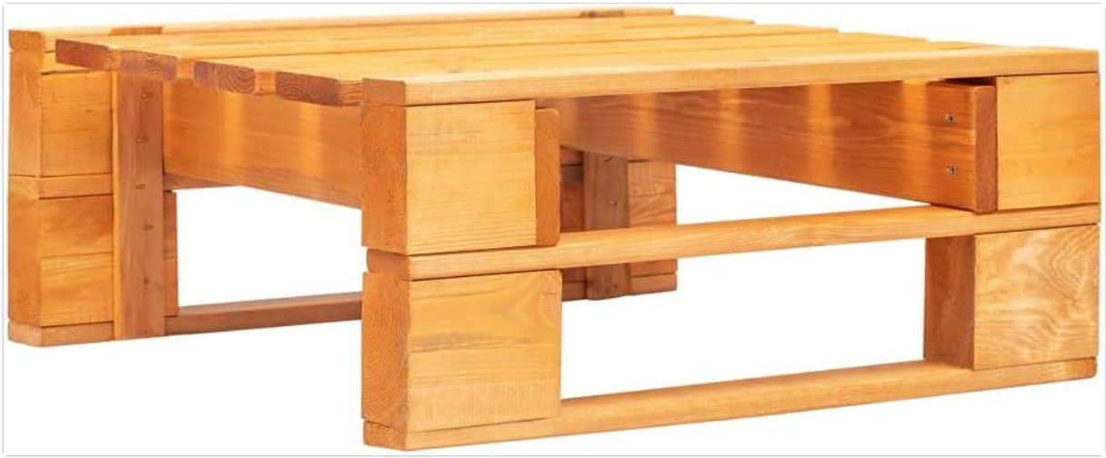
Image: Side view of the assembled wooden pallet base. This view highlights the construction of the wooden pallet, demonstrating how the pieces fit together.