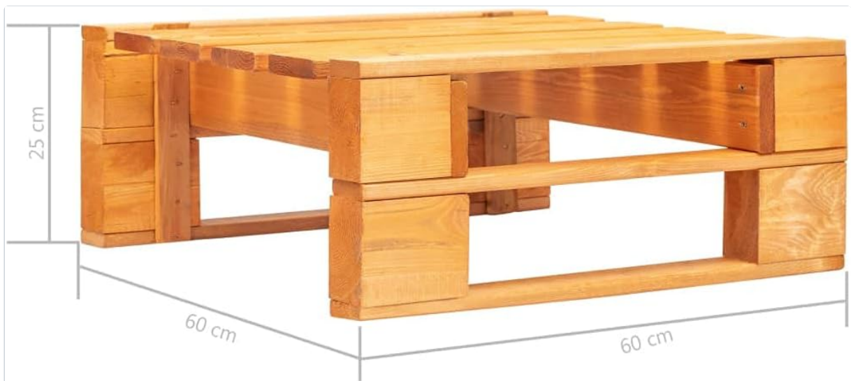
Image: Wooden pallet structure with dimensions. This image shows the overall dimensions of the wooden pallet base: 60 cm (length) x 60 cm (width) x 25 cm (height).

Assembly is required for this product. Please ensure all components are present before beginning the assembly process. Refer to the included diagrammatic instructions for proper assembly. Use appropriate tools and avoid overtightening screws to prevent damage to the wood.