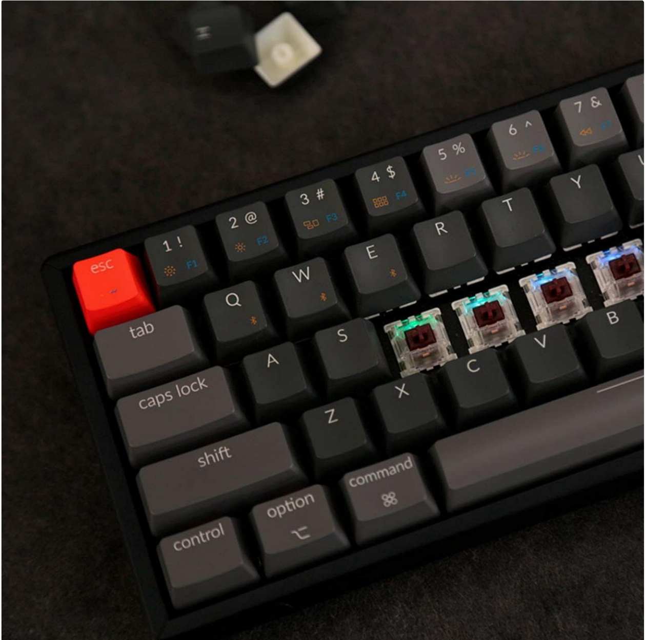
Figure 4: Multi-device Bluetooth connectivity.