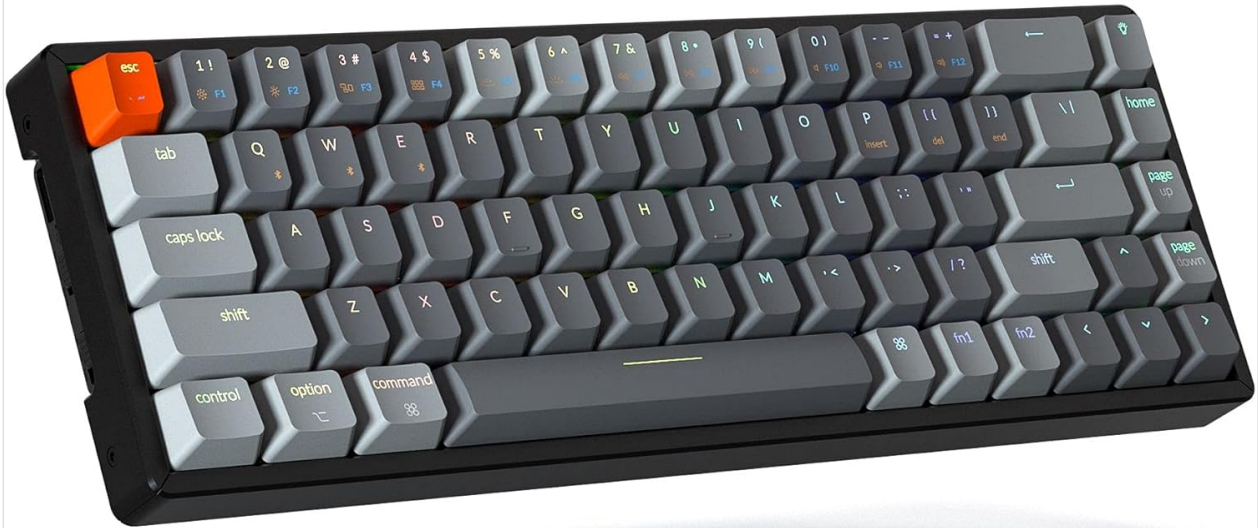
Figure 1: Top-down view of the Keychron K6 keyboard.