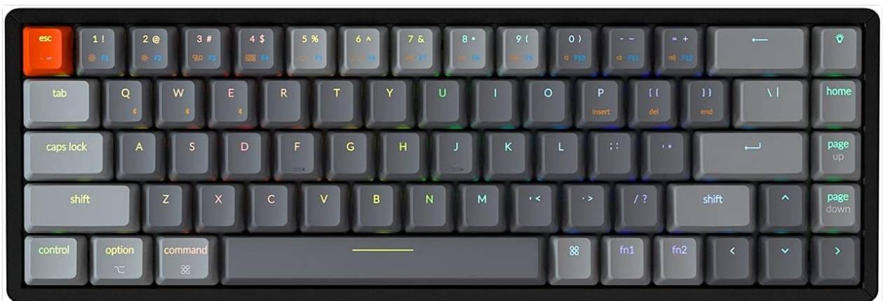
Figure 3: Keyboard connected via USB-C cable.