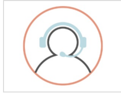
Image: Icon representing customer care, indicating support availability for the wooden baby crib.

For warranty claims, replacement parts, or any questions regarding your product, please contact dadada customer support. Refer to the contact information provided with your purchase or visit the official dadada website.