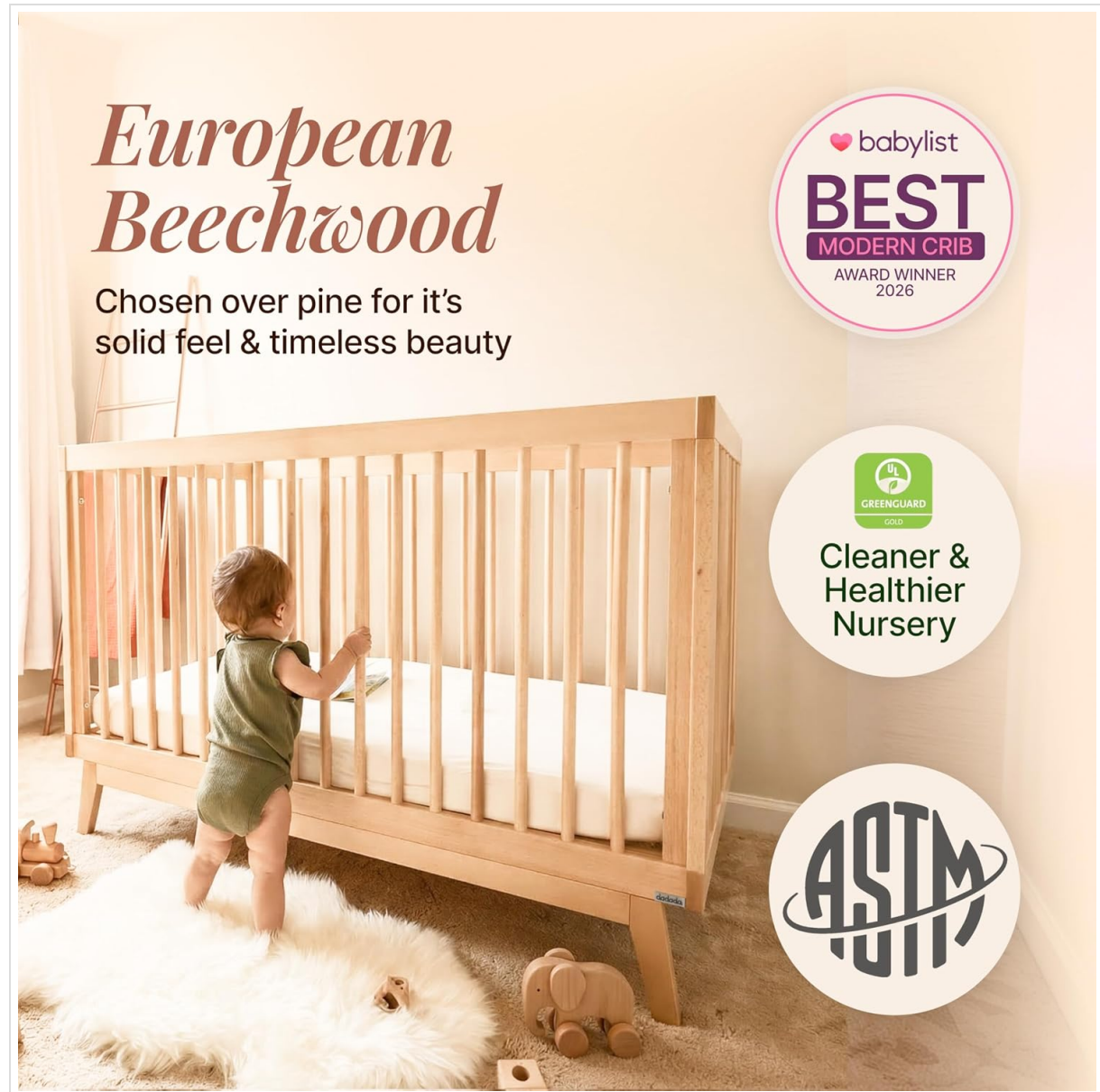
Image: A baby standing in the dadada Soho crib, showcasing the European Beechwood construction and the GREENGUARD Gold and ASTM certifications.

The dadada Baby Soho 3-in-1 Convertible Crib is crafted in Italy from solid European beechwood, ensuring durability and a timeless design. It features a baby-safe, non-toxic finish and is GREENGUARD Gold Certified for a healthier nursery environment. This versatile crib offers three adjustable mattress heights and can be converted into a toddler bed and a daybed with the purchase of a separate conversion kit.