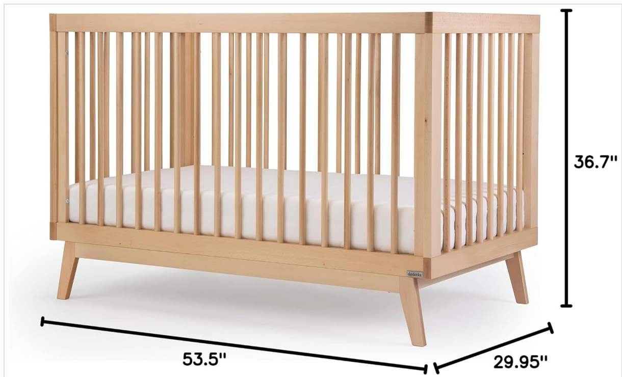
Image: A diagram illustrating the length, width, and height dimensions of the dadada Soho crib.