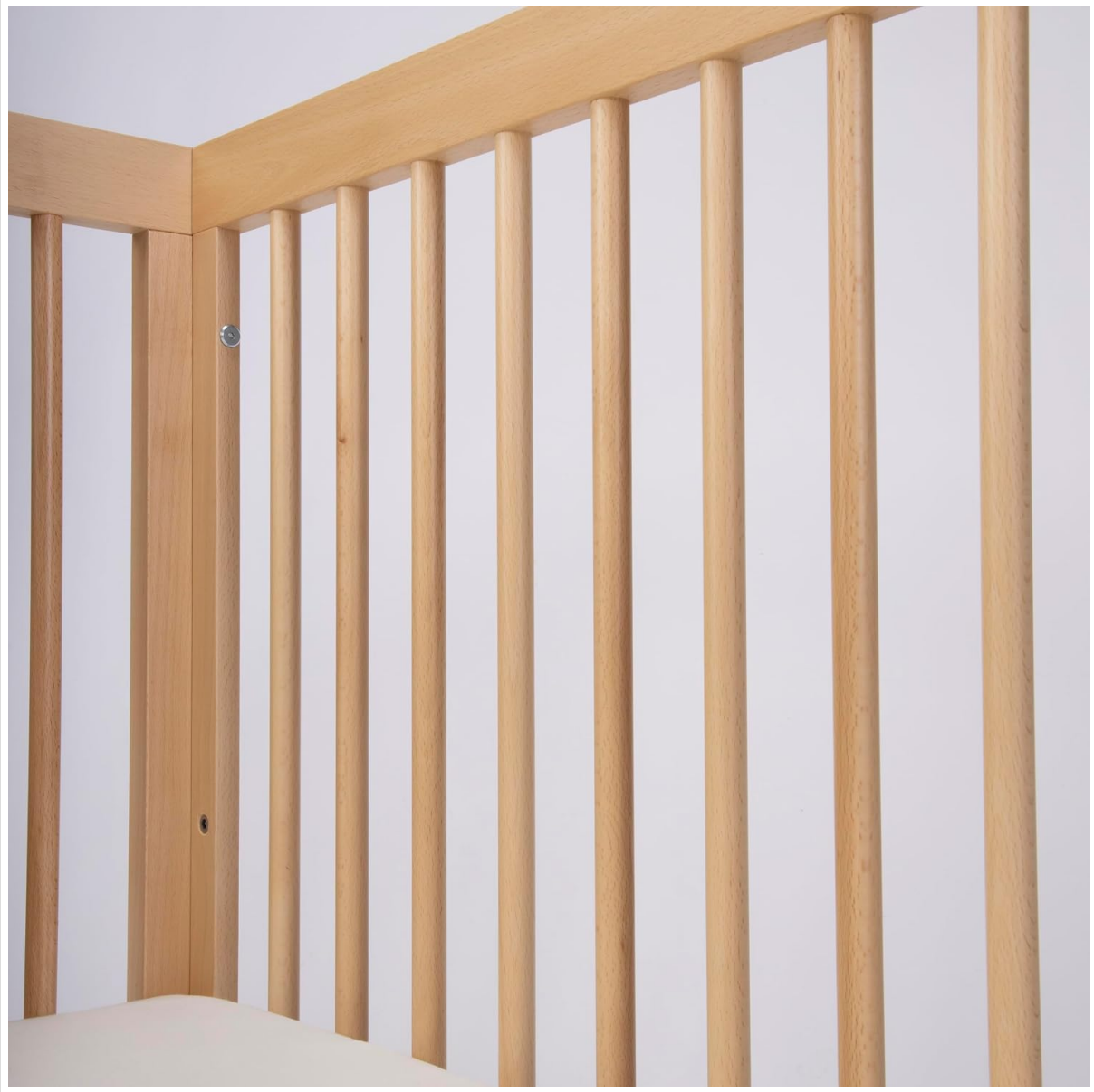
Image: A detailed view of the crib's wooden slats and frame, showing the quality of construction.