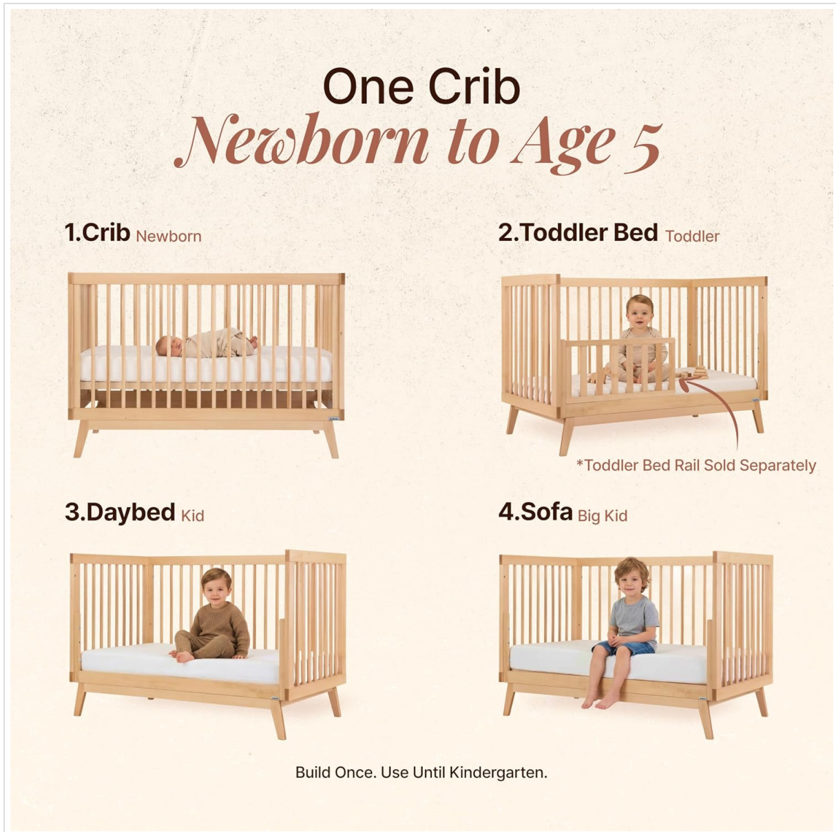
Image: Visual representation of the dadada Soho crib's 3-in-1 functionality, illustrating its transformation from a crib to a toddler bed and a daybed.