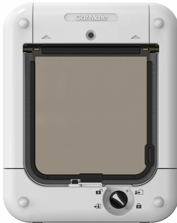
Figure 2: Front view of the cat flap, highlighting the microchip reader and the 4-way rotary lock at the bottom.