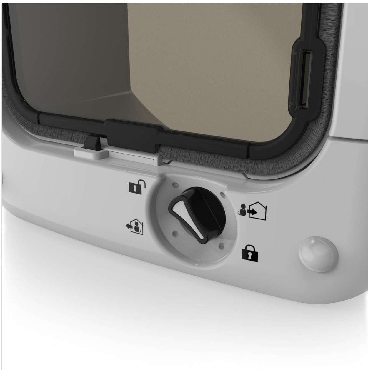
Figure 6: Close-up view of the 4-way rotary lock dial, showing the clear icons for each setting.