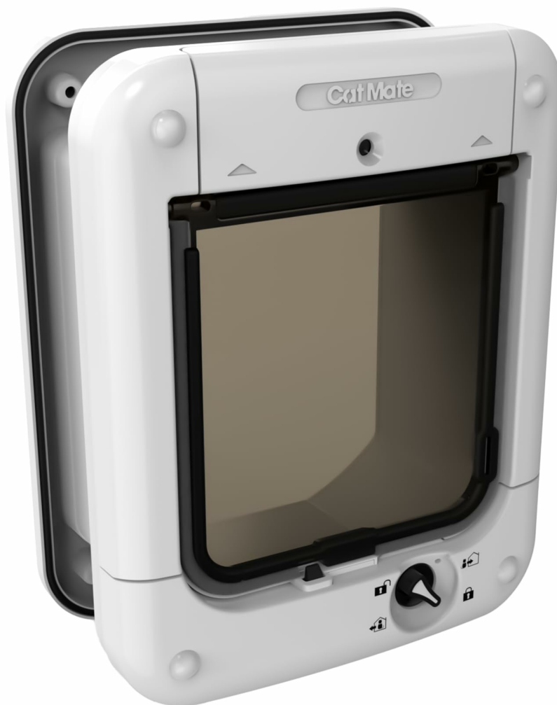
Figure 1: Angled view of the Cat Mate Microchip Activated Cat Flap, showing the main unit and transparent flap.

The Cat Mate Microchip Activated Cat Flap consists of the main unit with a transparent flap, a microchip reader, and a 4-way rotary lock. The design ensures a weatherproof seal and easy access for your pet.