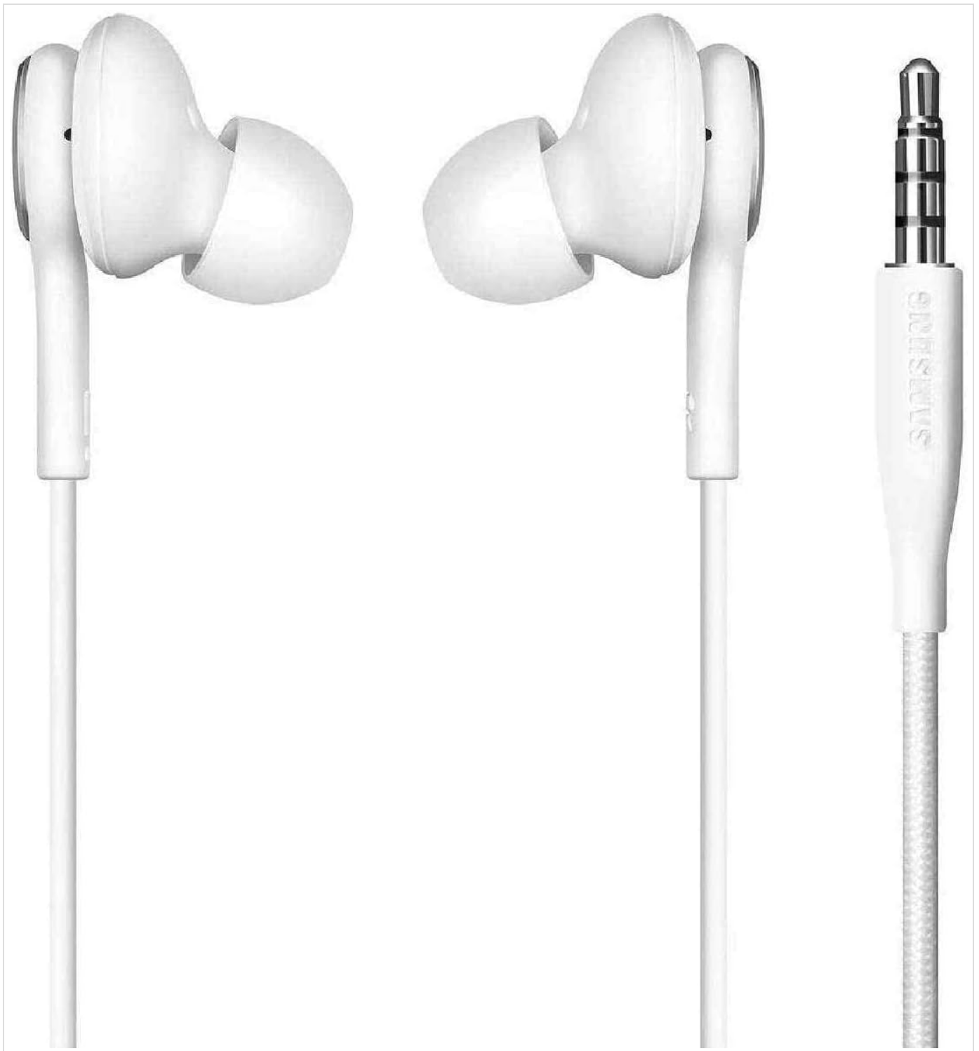
Image: Detailed view of the UrbanX earbuds and the 3.5mm audio jack connector, highlighting the design.

The inline control unit allows for easy management of audio playback and calls without needing to access your connected device directly.