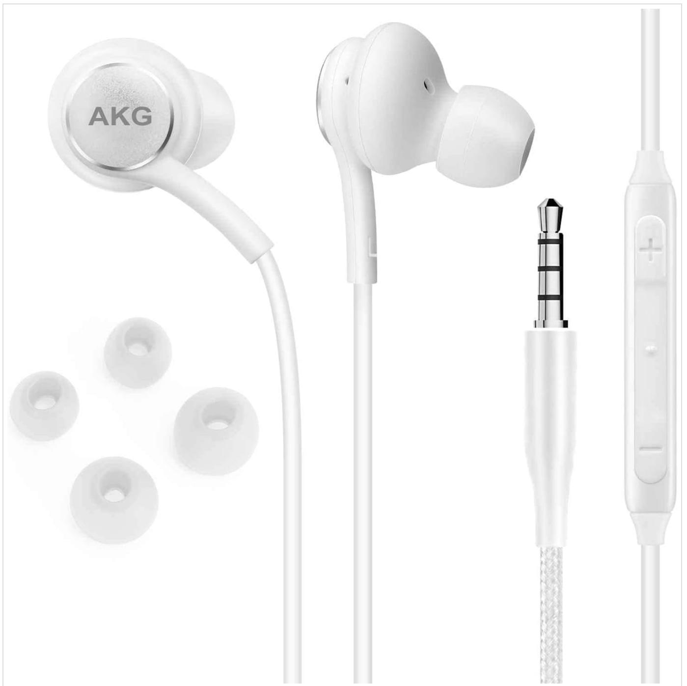
Image: Overview of the UrbanX Corded Stereo Earbuds Headphones, showing the earbuds, braided cable, 3.5mm jack, inline controls, and included silicone ear tips.