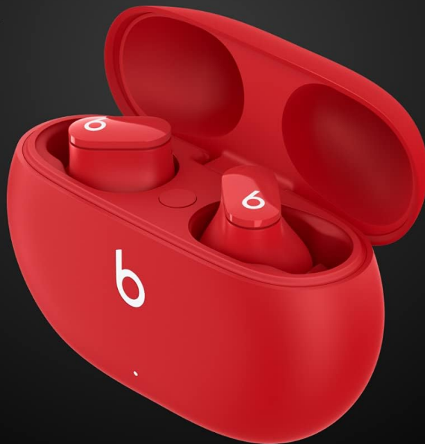
Image: A visual representation of all items included in the Beats Studio Buds retail packaging.