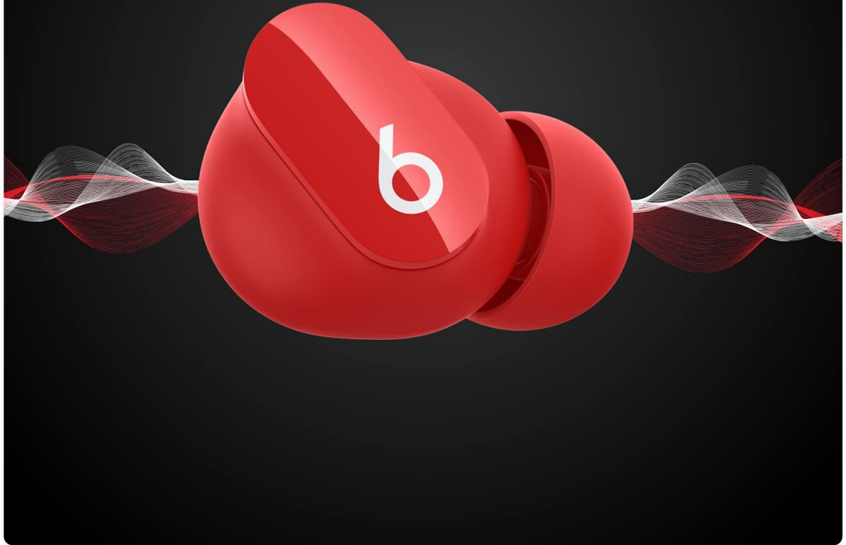
Image: Visual explanation of Transparency Mode, enabling users to stay aware of their surroundings while listening to audio.