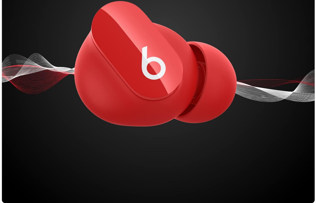
Image: Visual explanation of how Active Noise Cancelling works to block external noise for an immersive sound experience.

BLOCKS EXTERNAL NOISE FOR IMMERSIVE SOUND