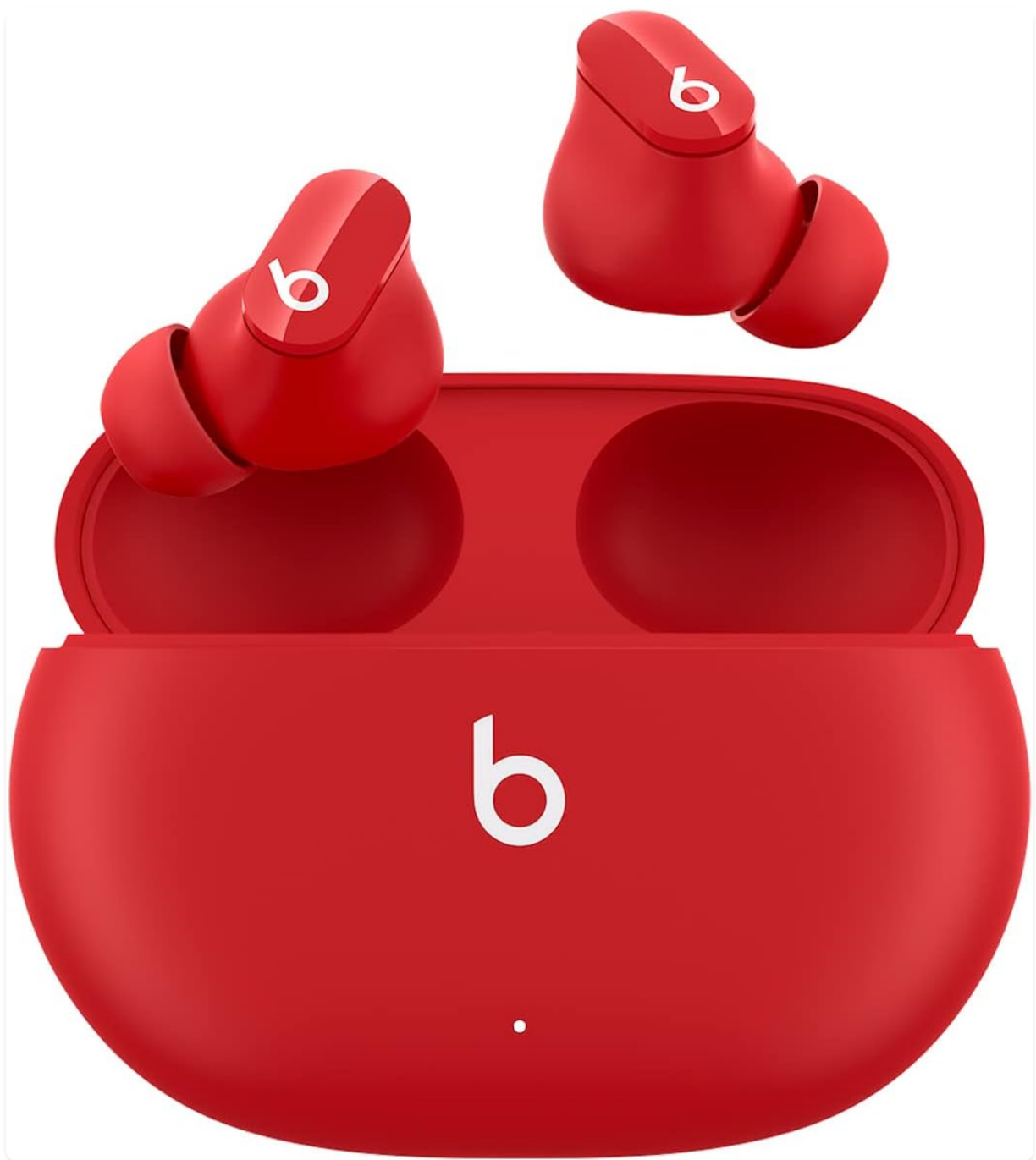
Image: Beats Studio Buds in their charging case, showcasing the compact design and vibrant red color.