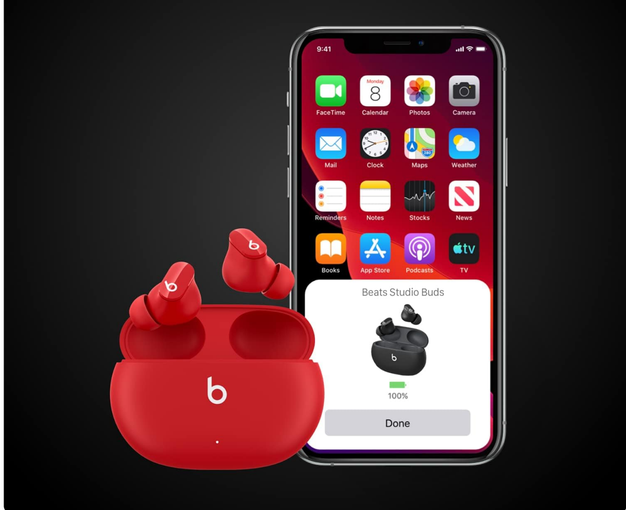
Image: Demonstrates the simple one-touch pairing process for Beats Studio Buds with a mobile device.