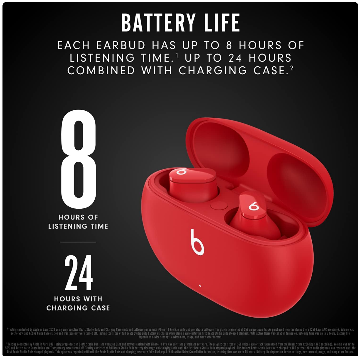
Image: An infographic detailing the battery life of Beats Studio Buds, highlighting 8 hours for earbuds and 24 hours with the charging case.