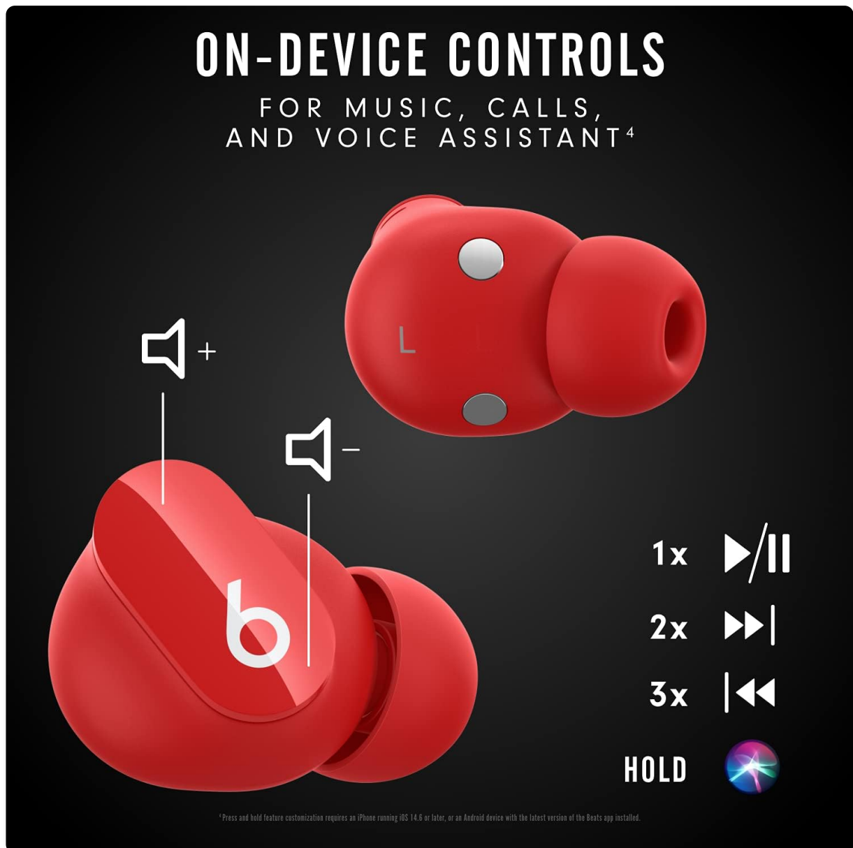
Image: An illustration detailing the various button press commands on the Beats Studio Buds for media, calls, and voice assistant.