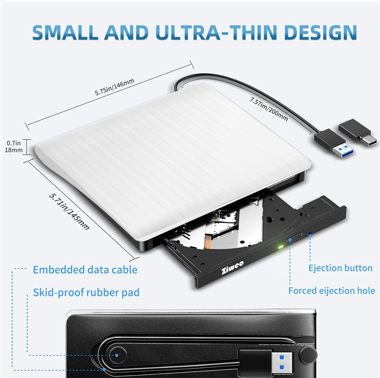
Figure 6: Product Dimensions and Design Features