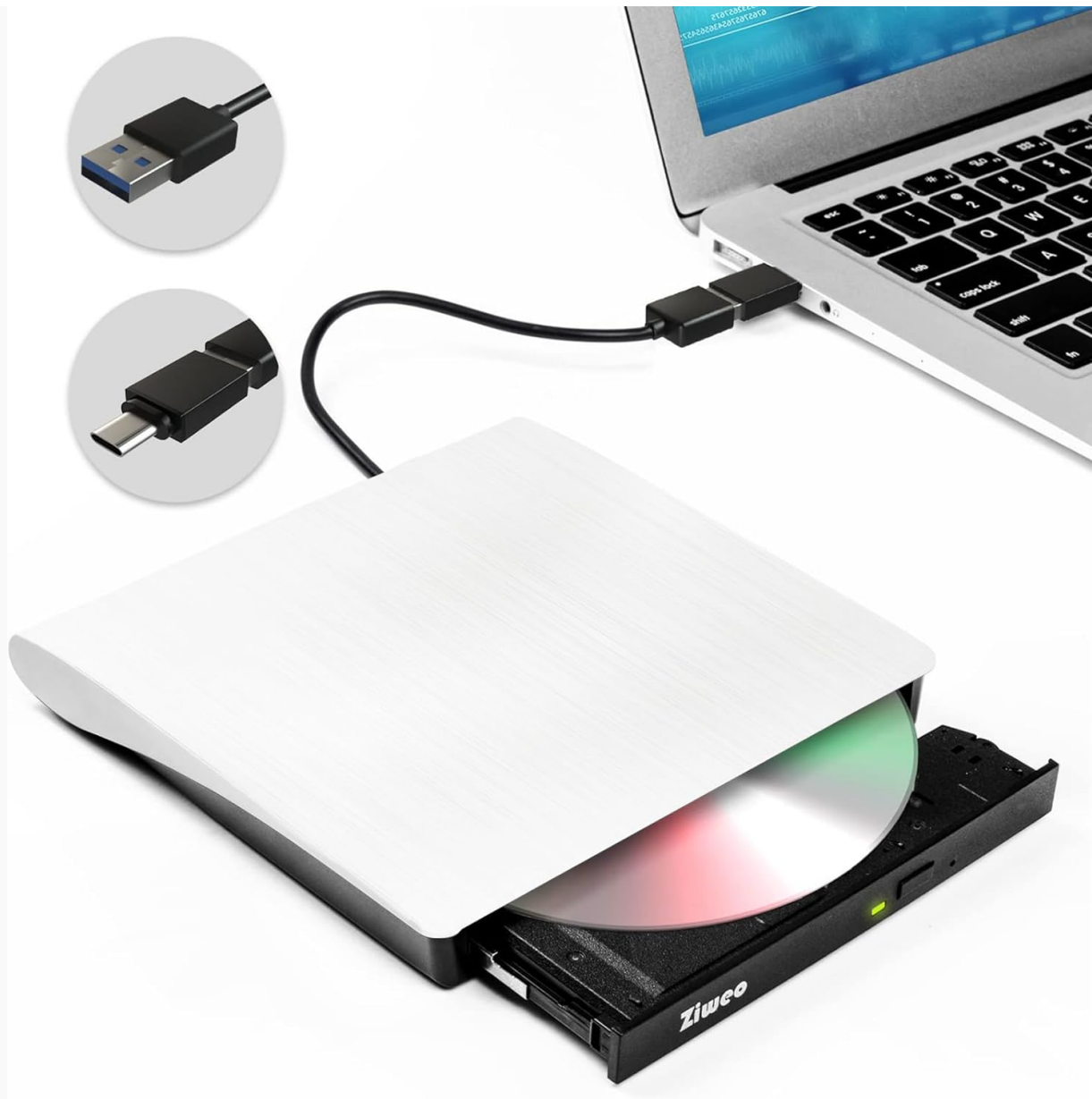
Figure 1: Ziweo External DVD/CD Drive Overview