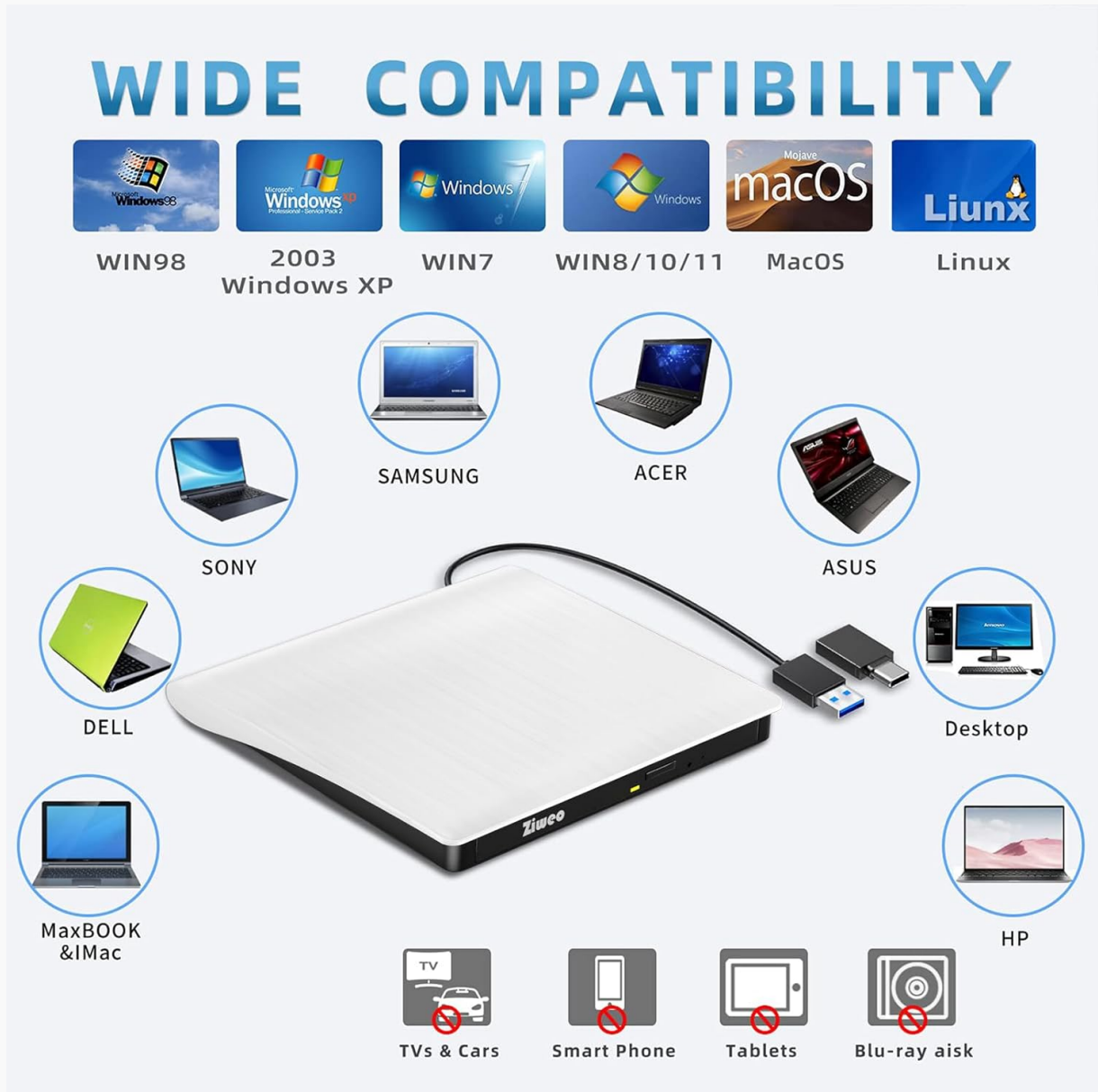
Figure 5: Compatibility Overview