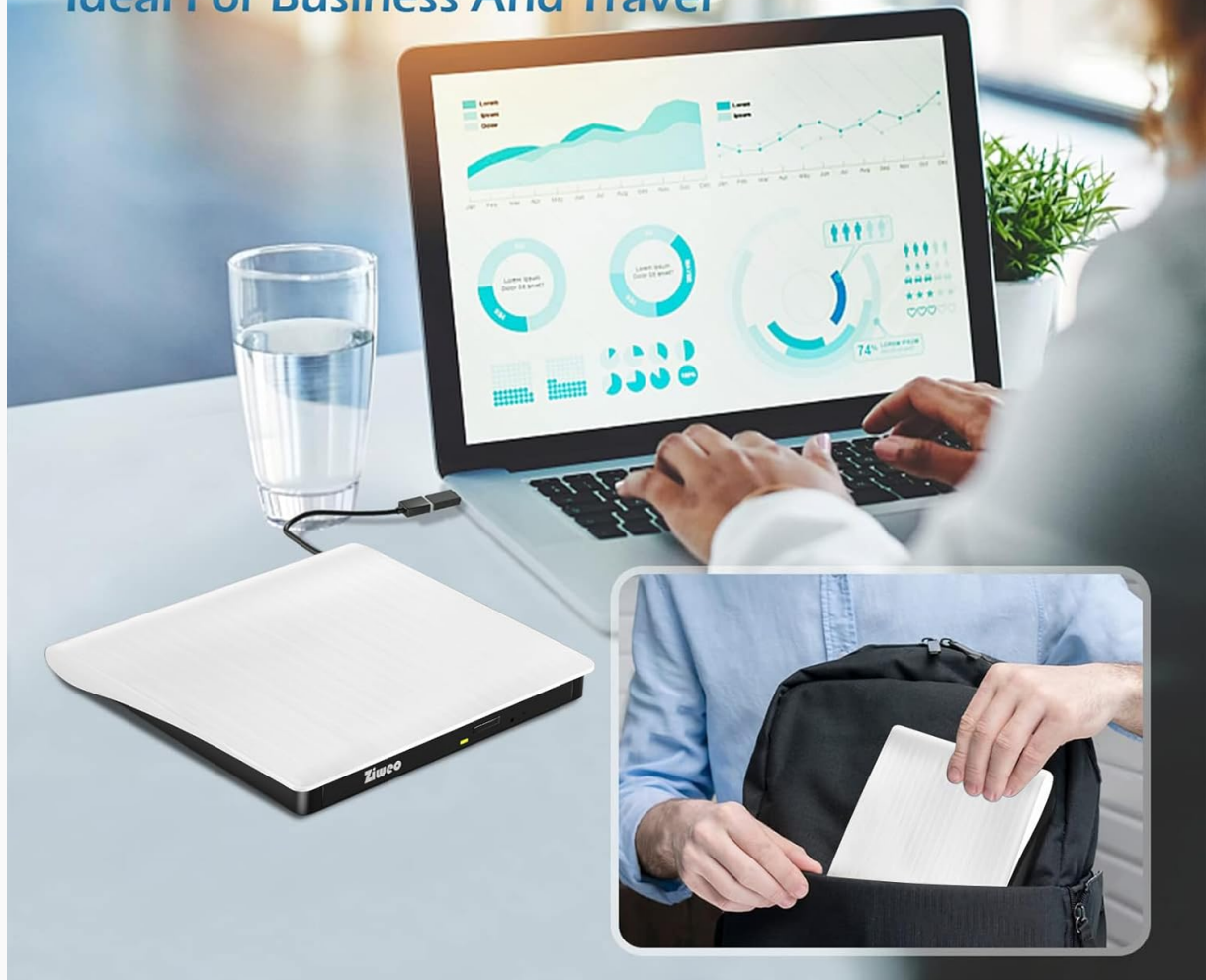
Figure 7: Portable Design for Easy Transport