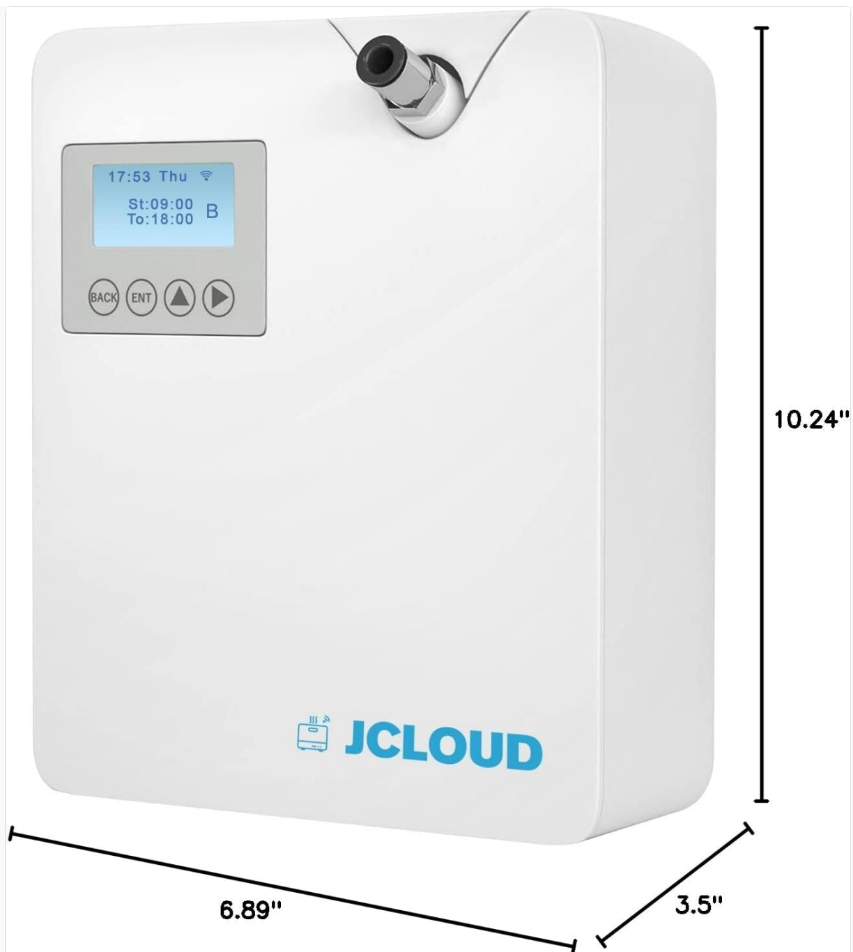
Figure 3: Product dimensions for installation planning.