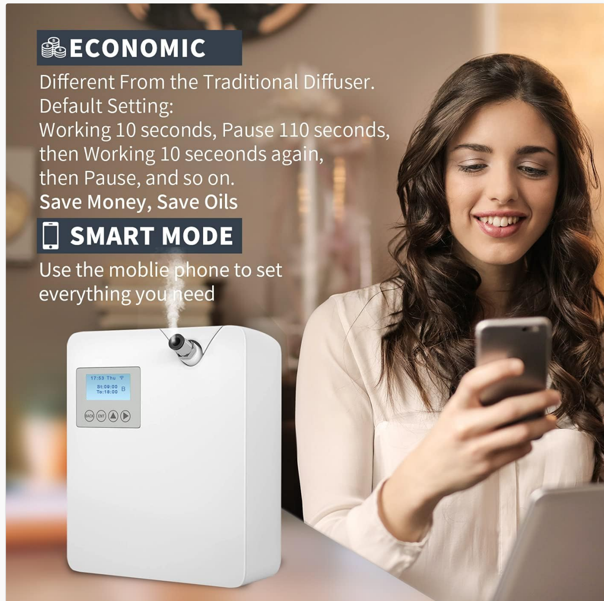
Figure 4: Controlling the scent machine using the Aroma-Link mobile application.

The most convenient way to control your JCLOUD Smart Scent Air Machine is through the "Aroma-Link" mobile application. This allows for precise scheduling and scent intensity adjustments.