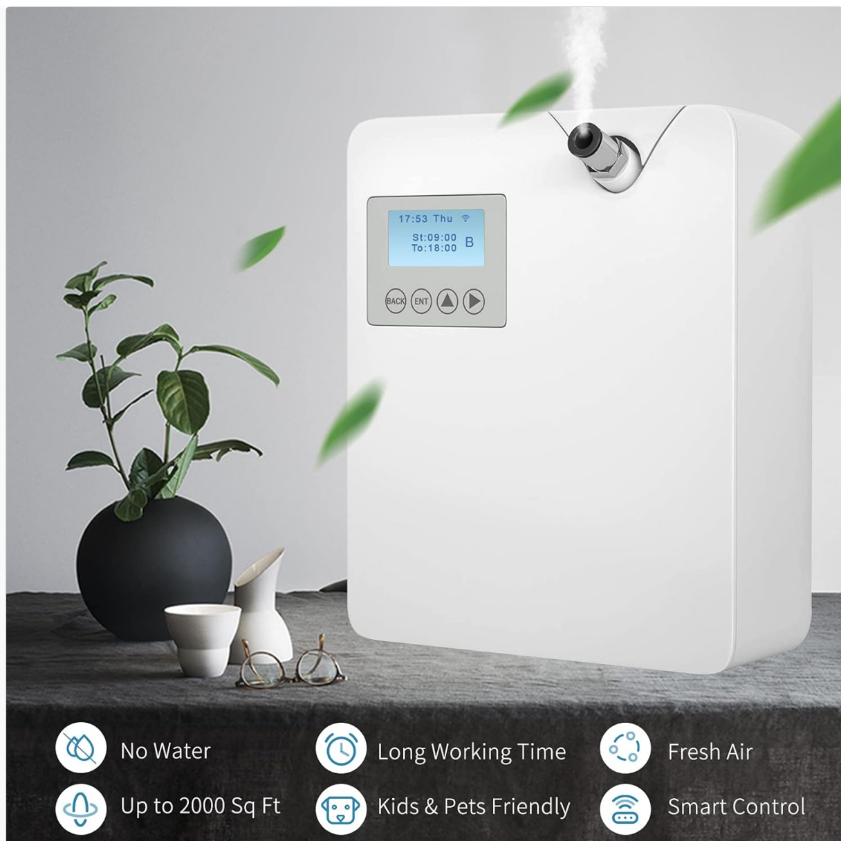
Figure 2: The JCLOUD Smart Scent Air Machine in a home environment, highlighting its key features.