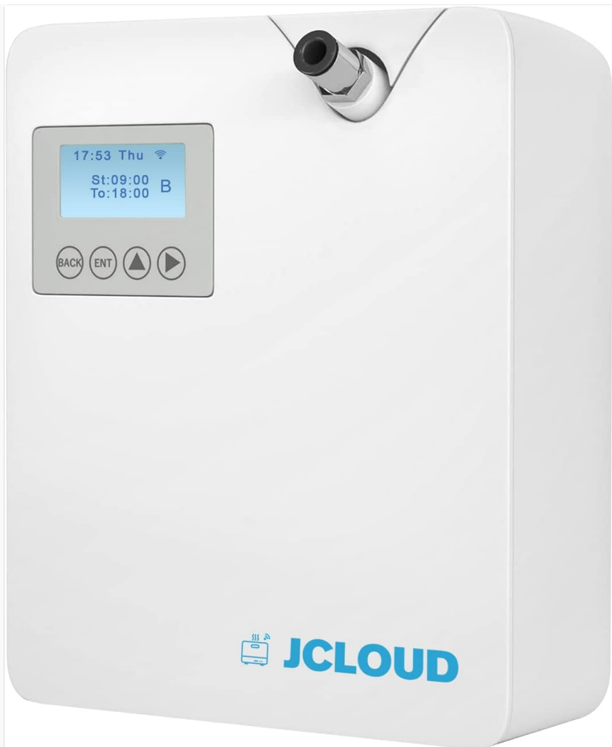
Figure 1: Front view of the JCLOUD Smart Scent Air Machine.