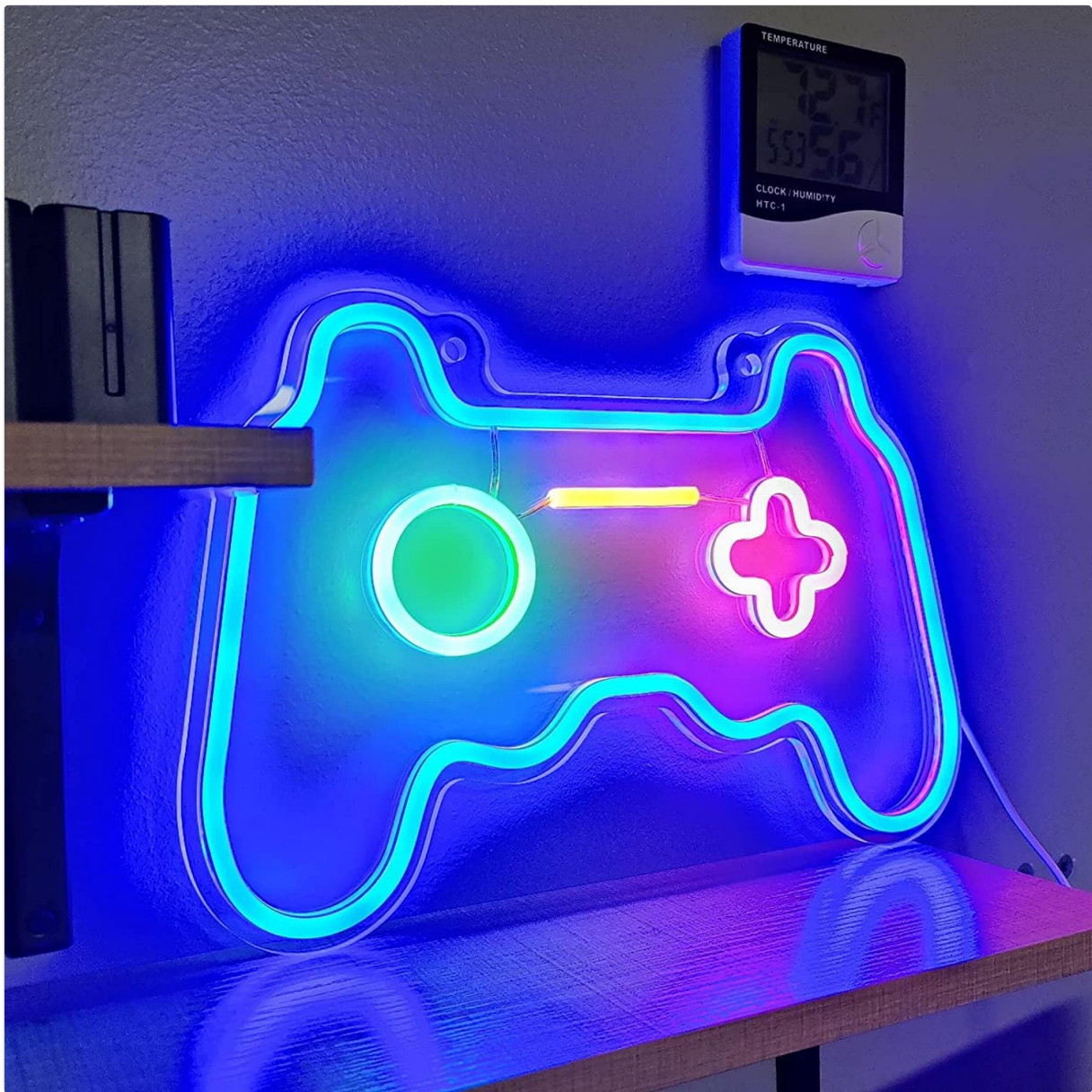
Image 2.1: The SOLIDEE NHD-01 LED Neon Sign illuminated, showcasing its gamepad design and vibrant colors.