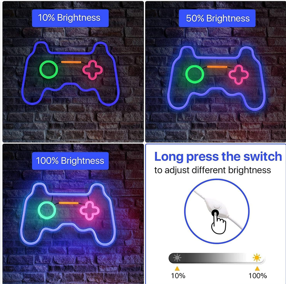
Image 6.1: Brightness adjustment levels and dimmer switch operation.