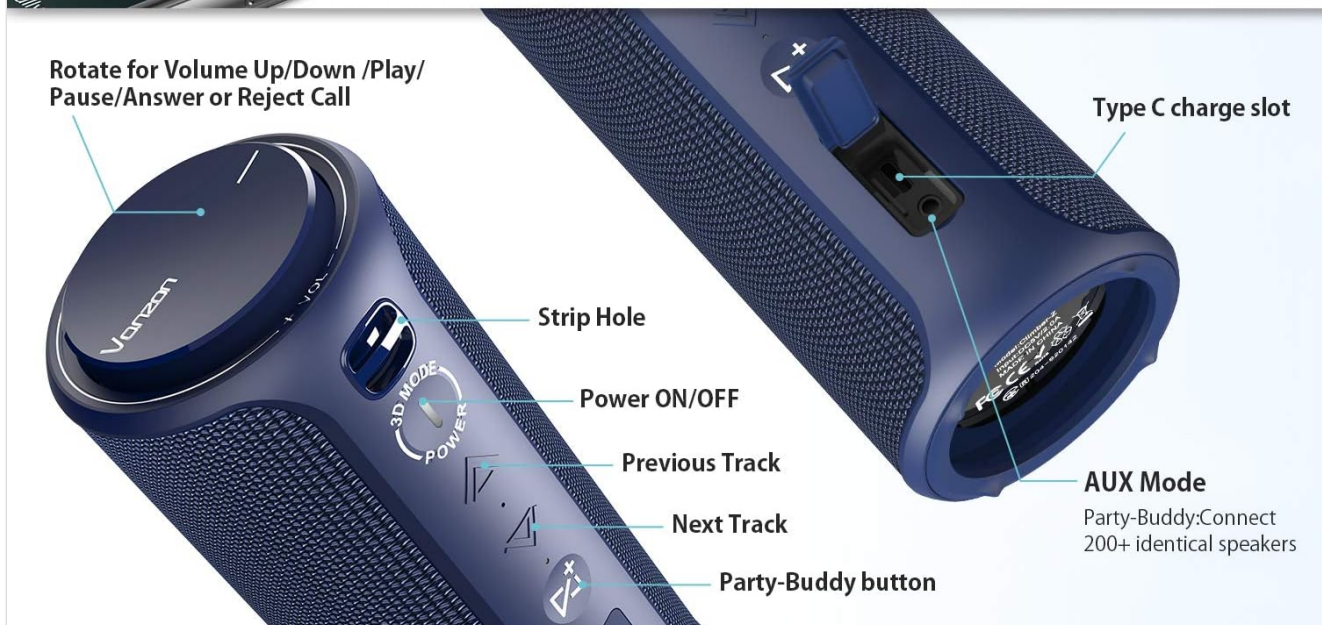
Figure 2: Detailed diagram of the Vanzon Climber-Z speaker's controls and ports. This includes the volume/play/pause/answer/reject call knob, strip hole, power ON/OFF, previous track, next track, Party-Buddy button, Type-C charge slot, and AUX input port.