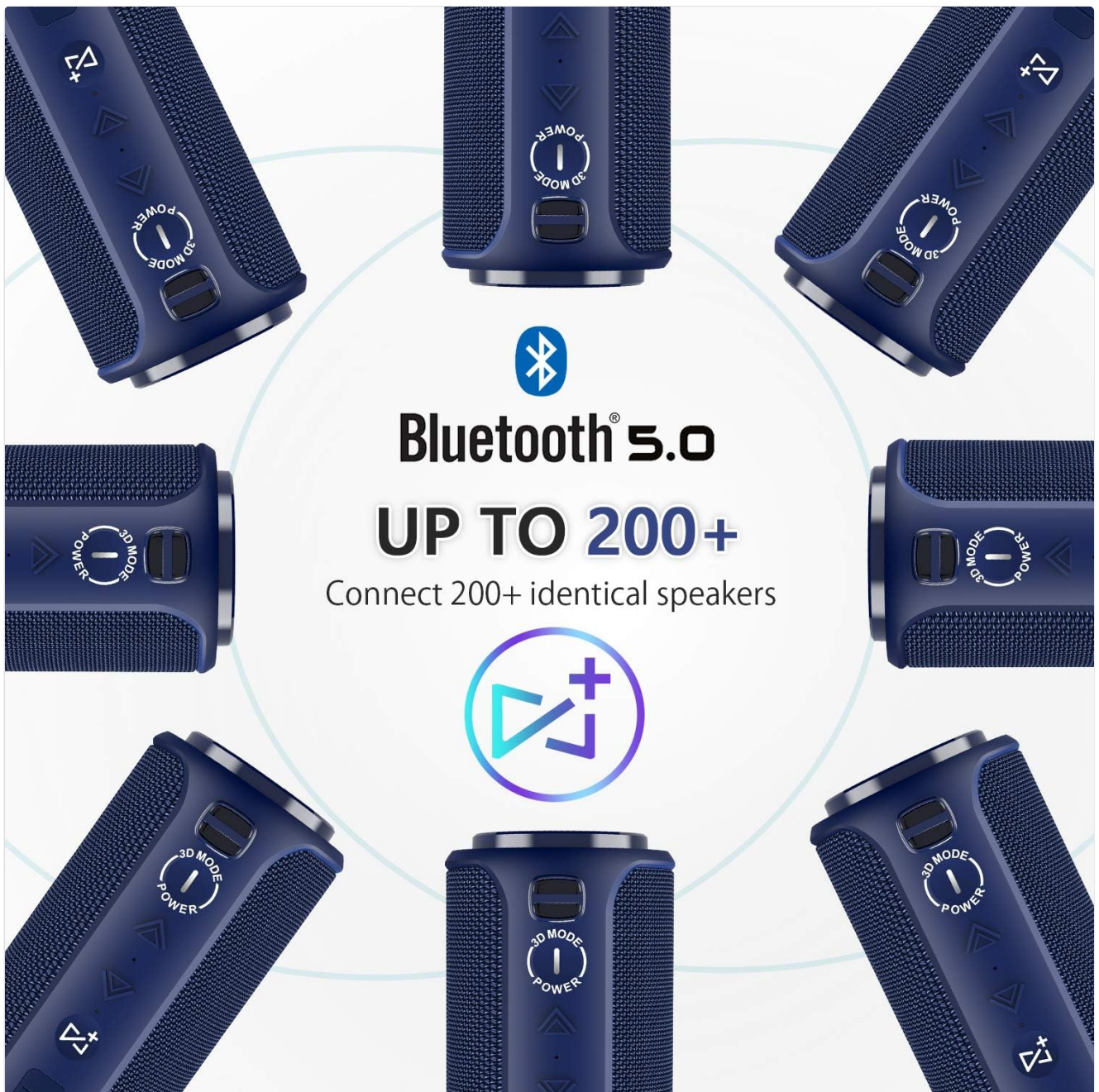
Figure 4: Visual representation of multiple Vanzon Climber-Z speakers connected using the Party-Buddy feature, enabling synchronized audio playback for a larger sound experience.