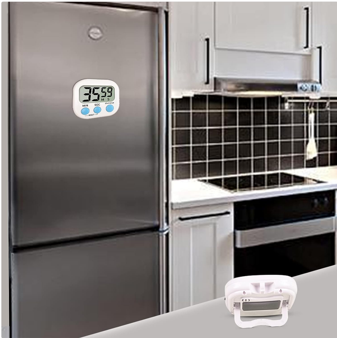
Image: The digital timer magnetically attached to a refrigerator door, demonstrating its versatile placement options in a kitchen environment.