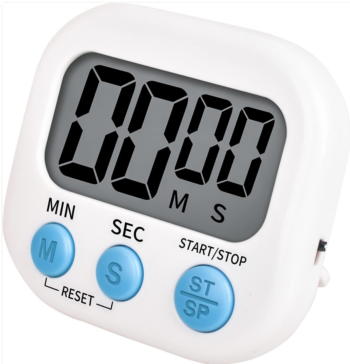
Image: Front view of the Mitlker Digital Kitchen Timer, displaying the large digital readout and the 'M', 'S', and 'ST/SP' buttons.