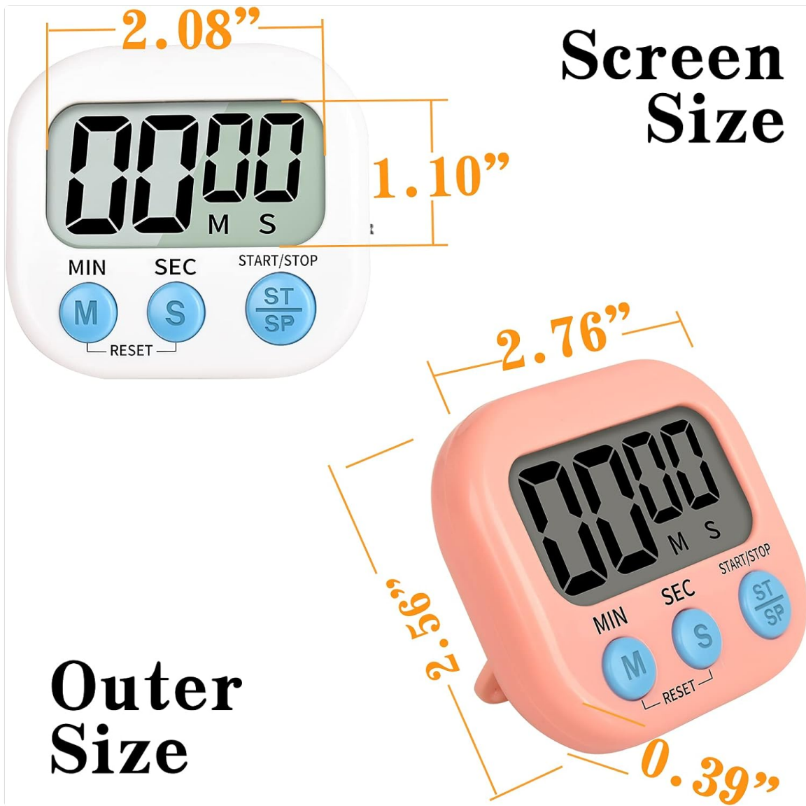
Image: Diagram illustrating the precise screen dimensions (2.08" x 1.10") and overall outer dimensions (2.76" x 2.56" x 0.39") of the timer.