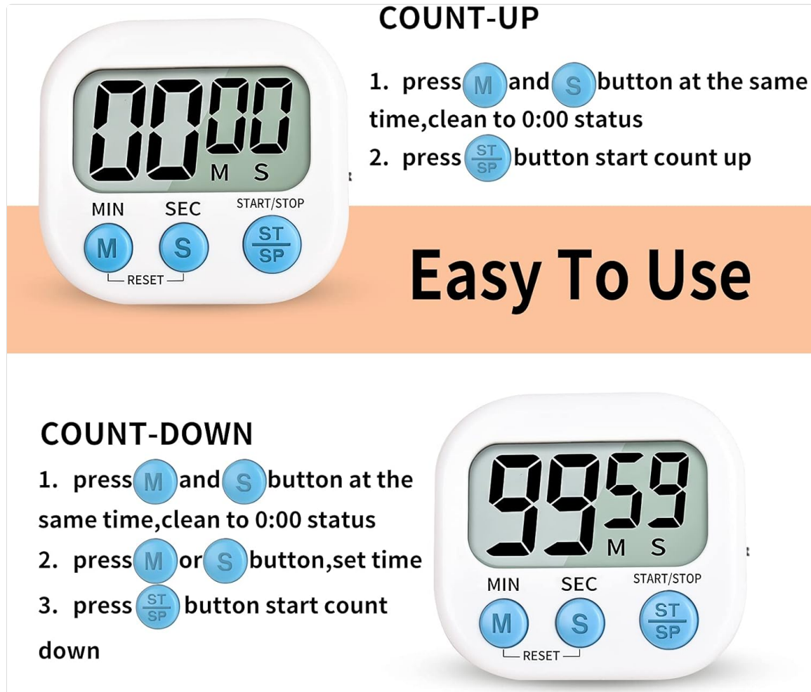
Image: Visual guide illustrating the steps for operating the timer in both count-up and count-down modes, indicating which buttons to press for each action.