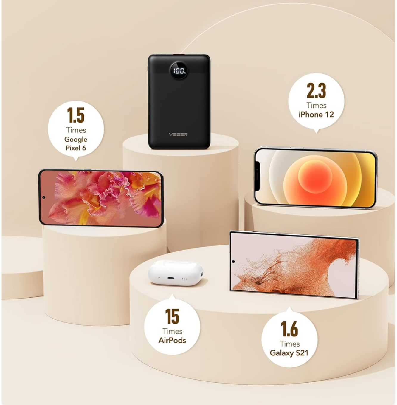
Image: Visual representation of the power bank's charging capacity for different devices, including iPhone 12, Google Pixel 6, AirPods, and Galaxy S21.