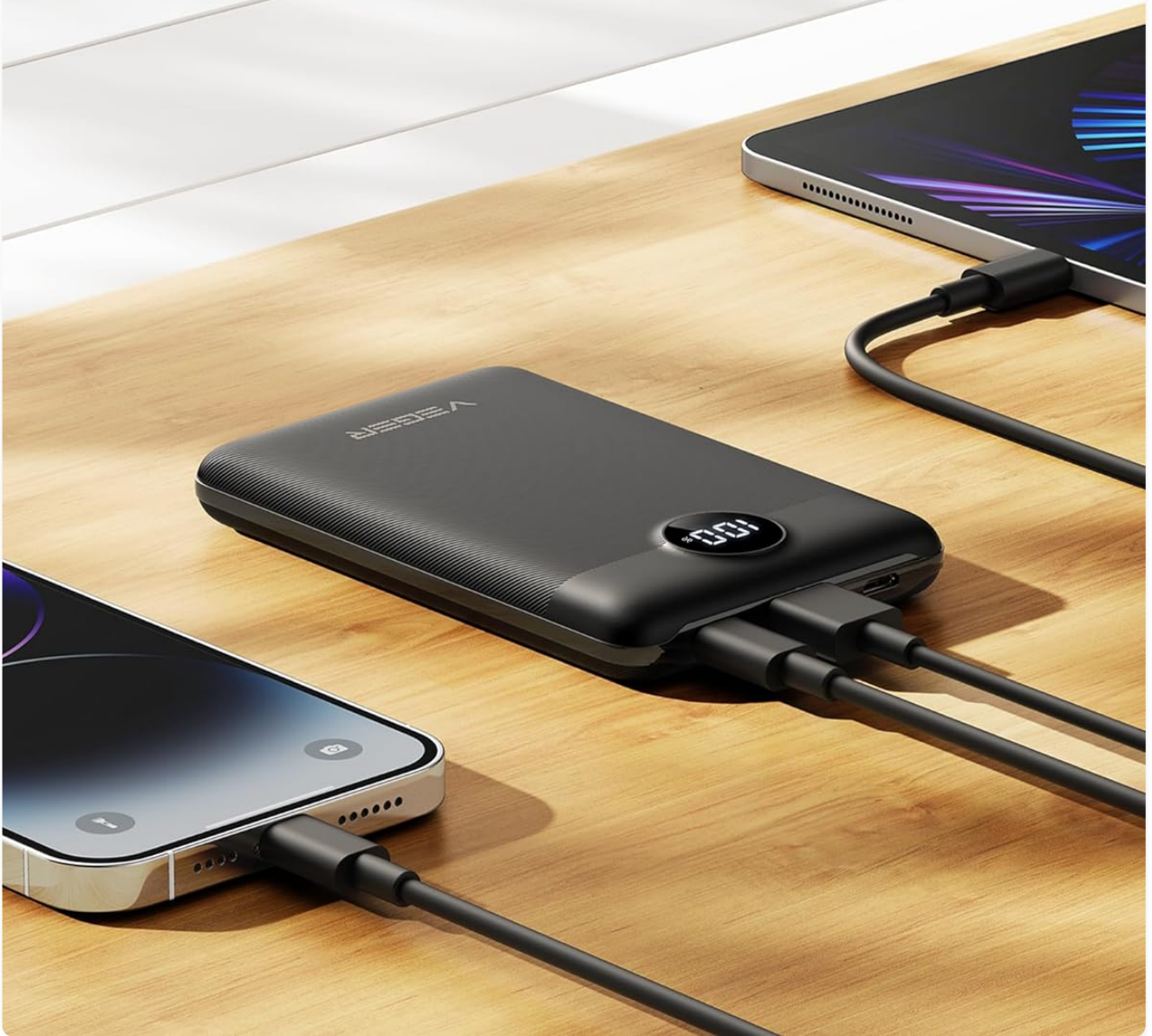
Image: The power bank connected to and charging two devices at once, demonstrating its dual output capability.