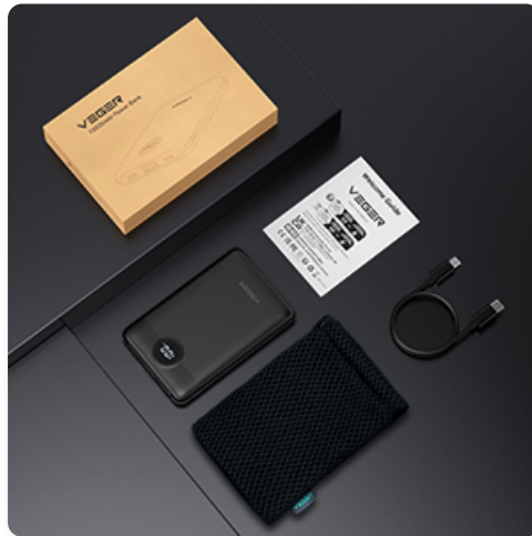
Image: An overhead view of the VEGER power bank's packaging and included accessories.