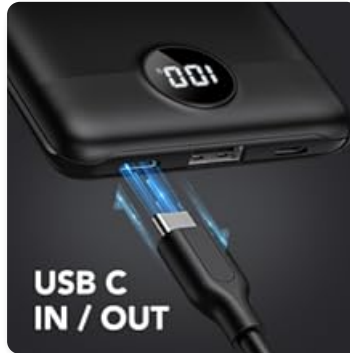
Image: A USB-C cable being inserted into the power bank's USB-C port, highlighting its dual input/output functionality.