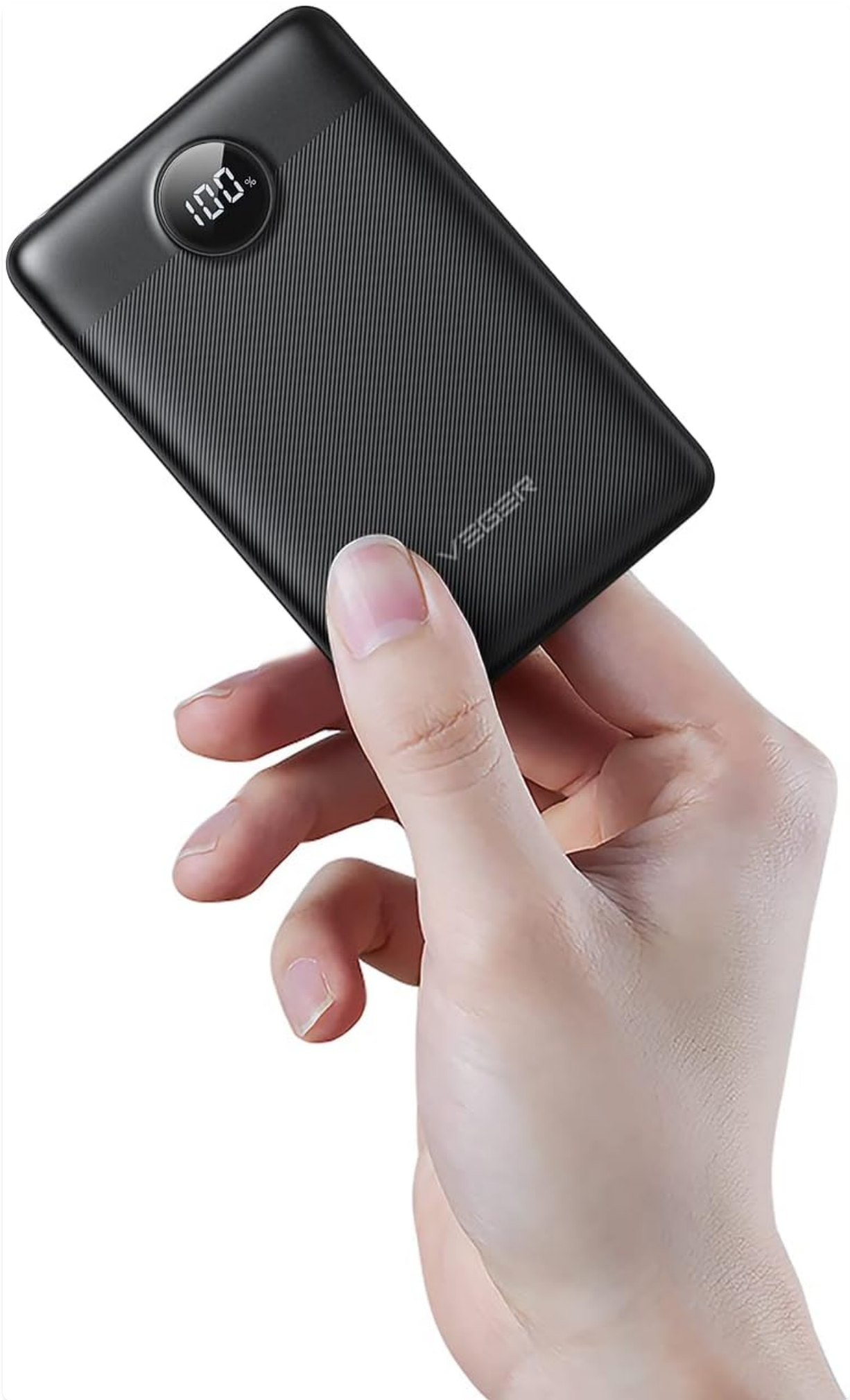
Image: The VEGER 10000mAh Power Bank, demonstrating its ultra-compact design when held in a hand.