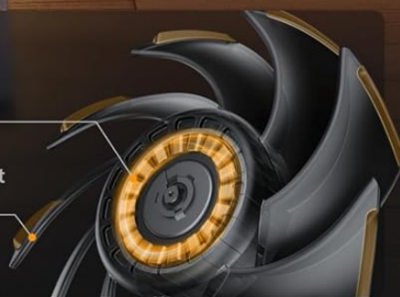
Image: The Dreo Space Heater in a bedroom setting, highlighting its quiet operation (34 dB) for restful nights, achieved through upgraded noise reduction and a new winglet design.