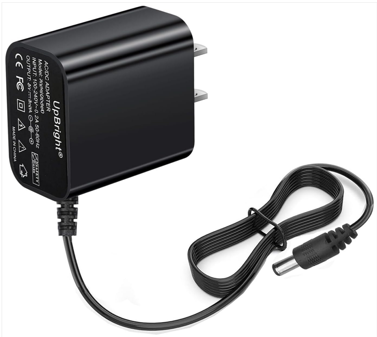
Figure 1: The UpBright 5V AC/DC Adapter showing the main unit, cable, and barrel connector. This image illustrates the complete adapter unit ready for connection.