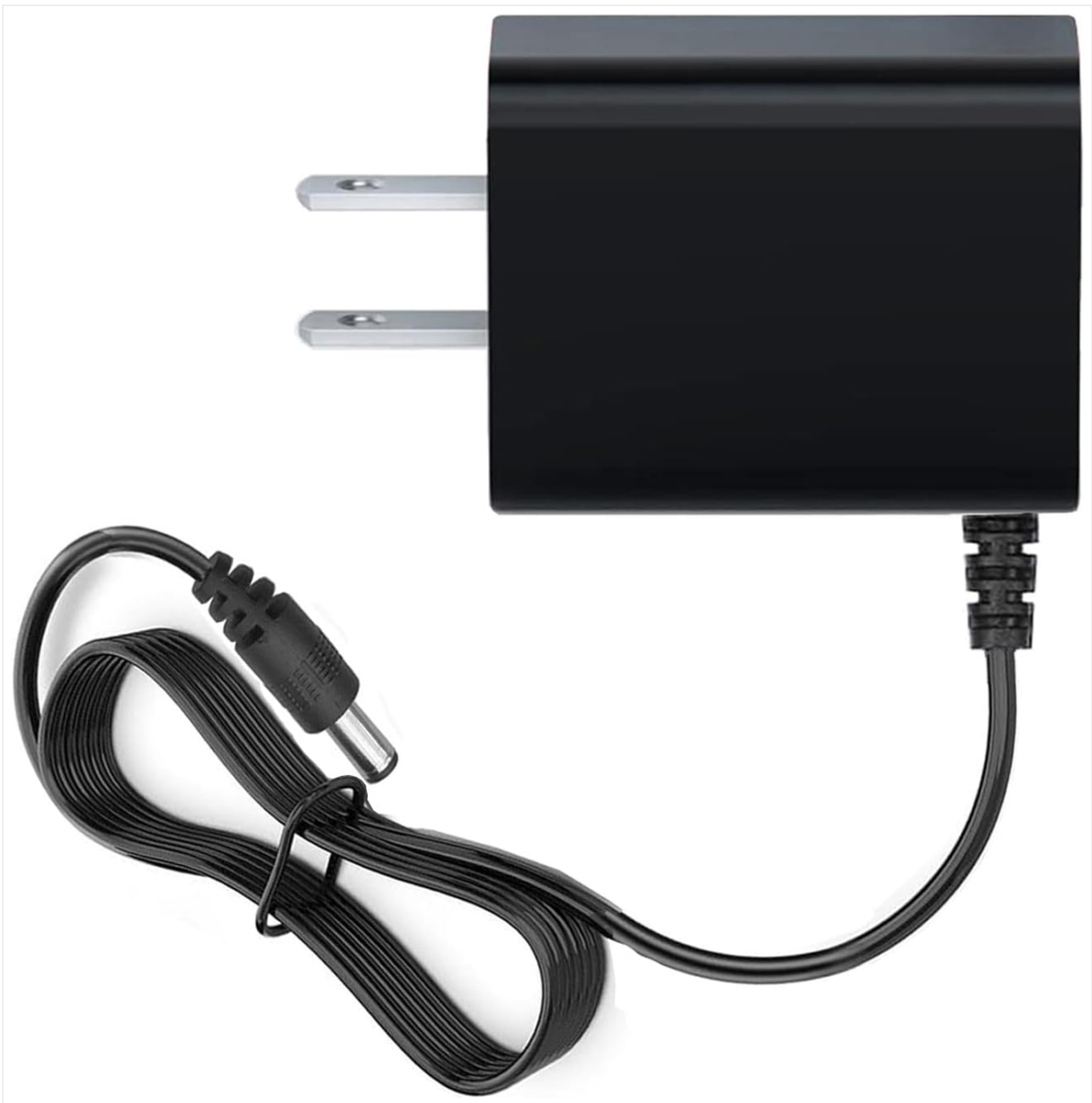
Figure 2: The UpBright 5V AC/DC Adapter highlighting the two-prong wall plug. This shows the part of the adapter that connects to a standard electrical outlet.