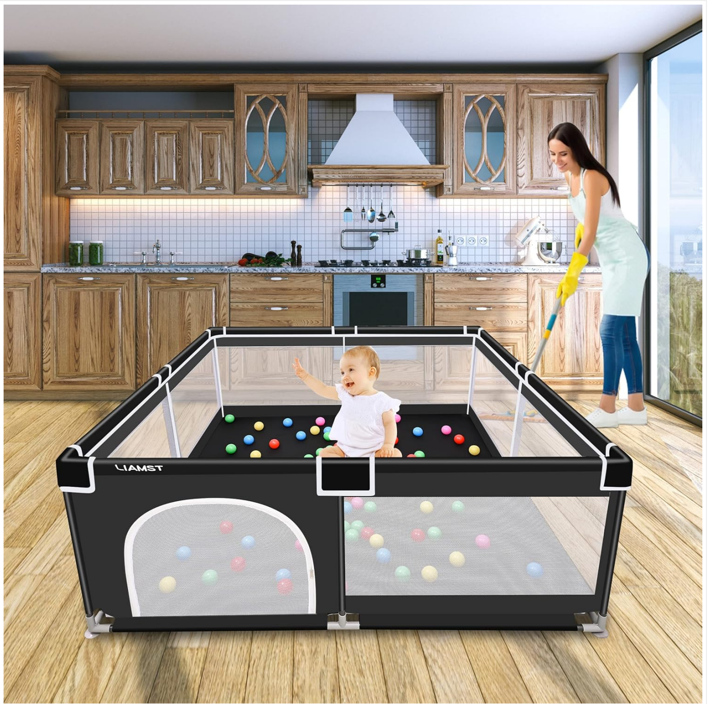
Figure 4.1: LIAMST Playpen in use, demonstrating a safe play environment.