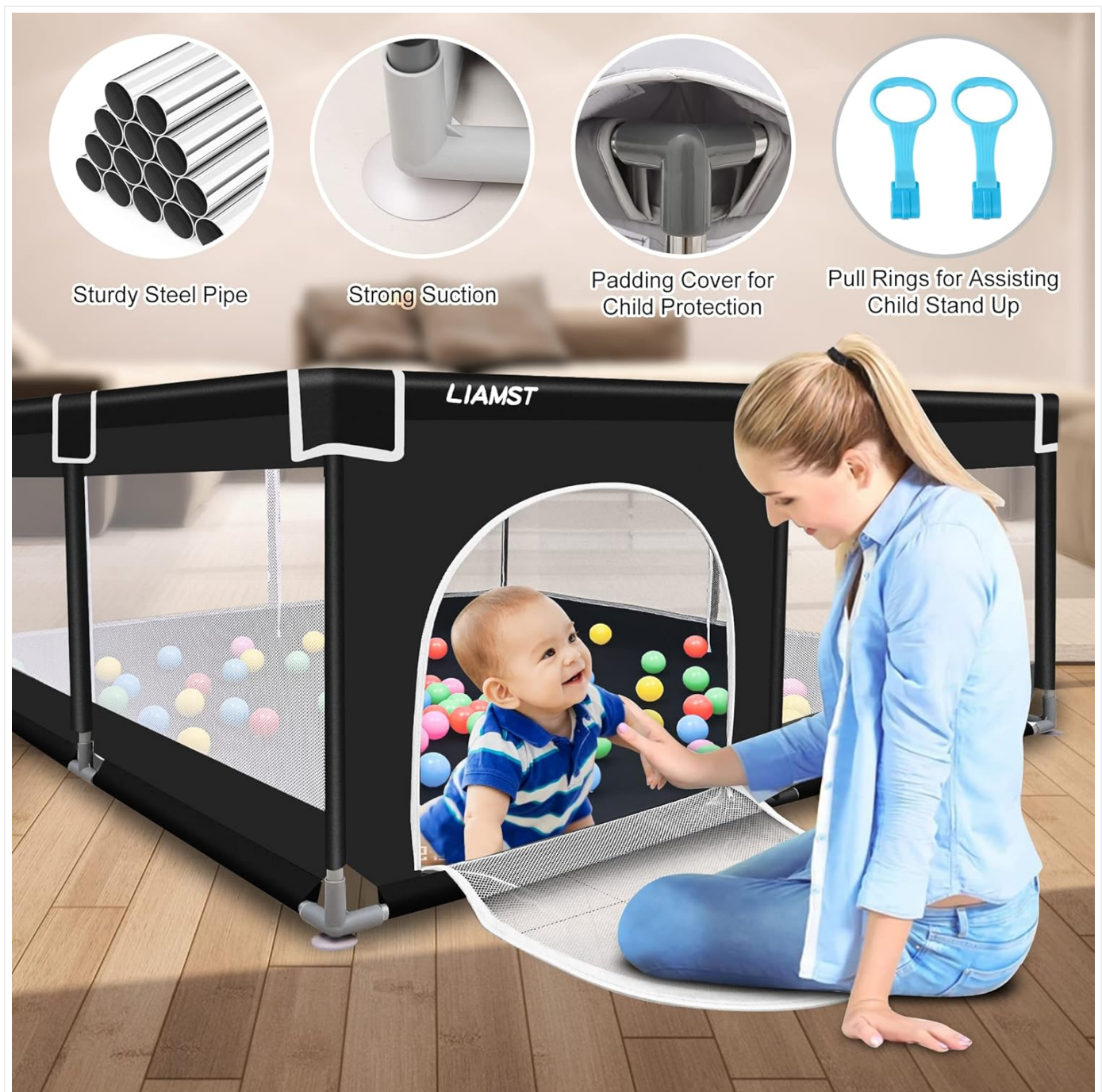
Figure 2.2: Key Features of the LIAMST Playpen.