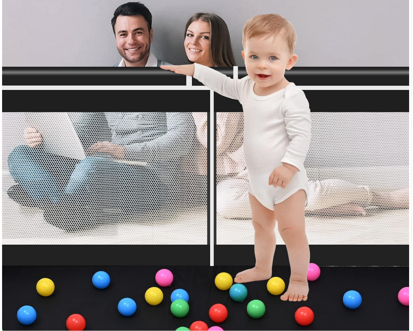
Figure 7.1: Playpen height designed for safety and visibility.