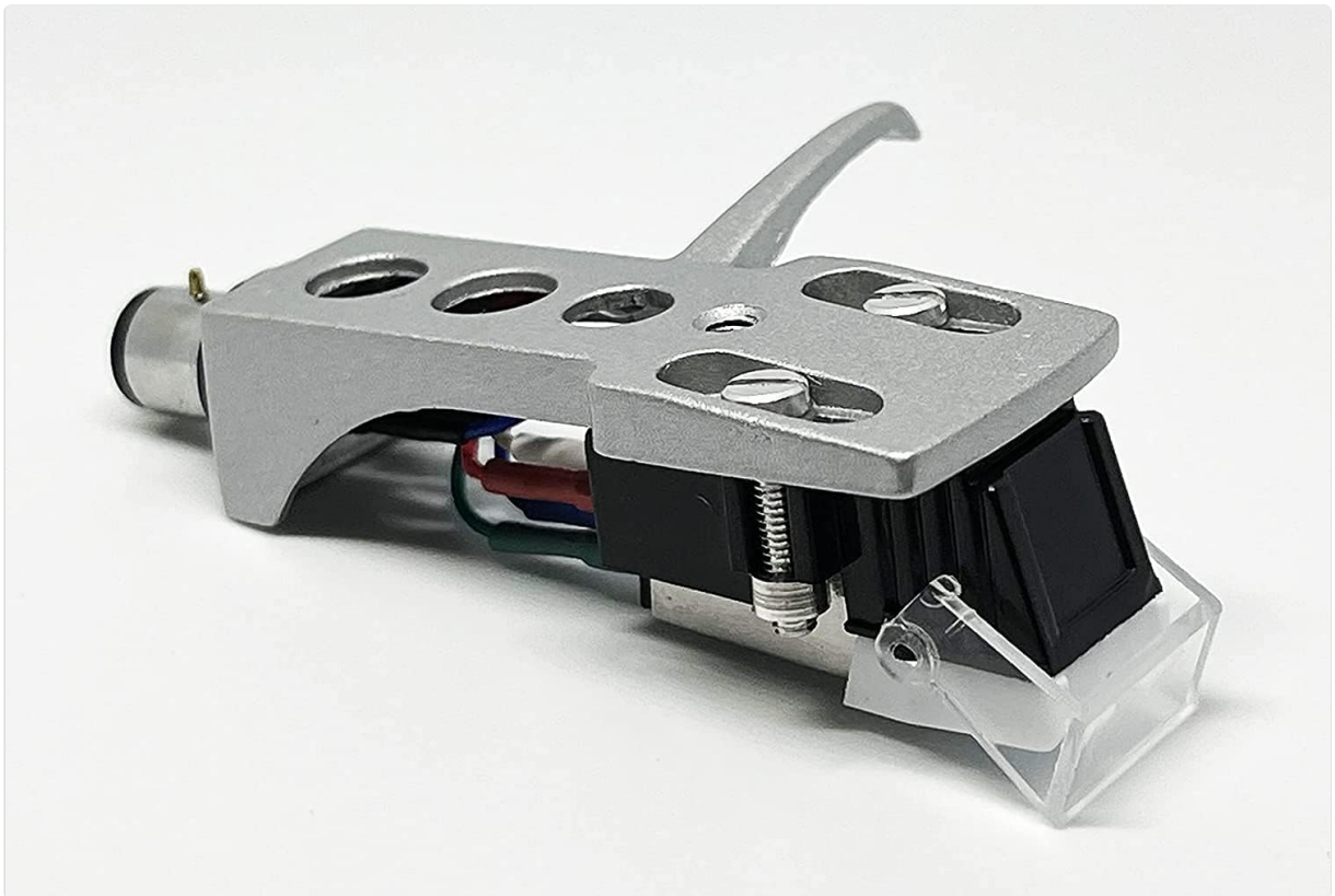
Figure 2.2: Top view of the MAG Turntable Headshell with the cartridge attached. This perspective highlights the mounting screws and the overall robust construction of the headshell.