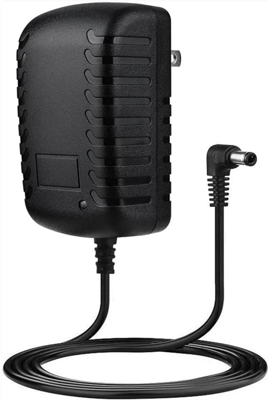
Image 1: PKPOWER AC Adapter Charger with its coiled cable, ready for connection. This image shows the compact design of the adapter and the right-angle DC connector.