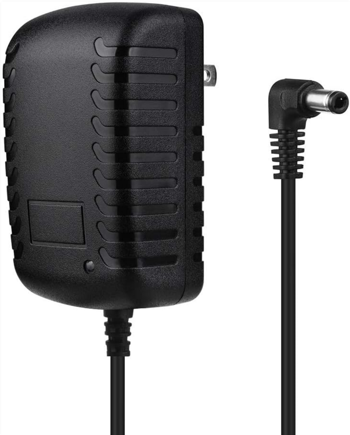
Image 2: Front view of the PKPOWER AC Adapter Charger, highlighting its compact design and the attached power cord.