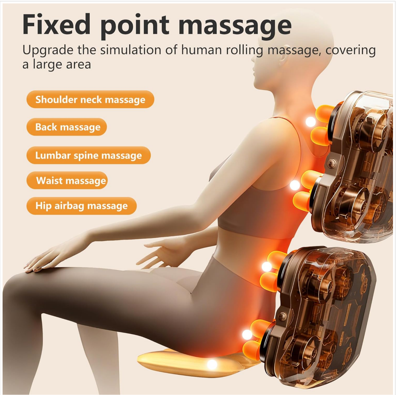
Figure 6: Fixed point massage, demonstrating how rollers target specific areas like the shoulders, back, lumbar spine, waist, and hips.