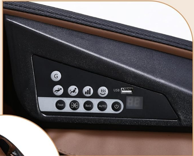
Control terminal and USB design