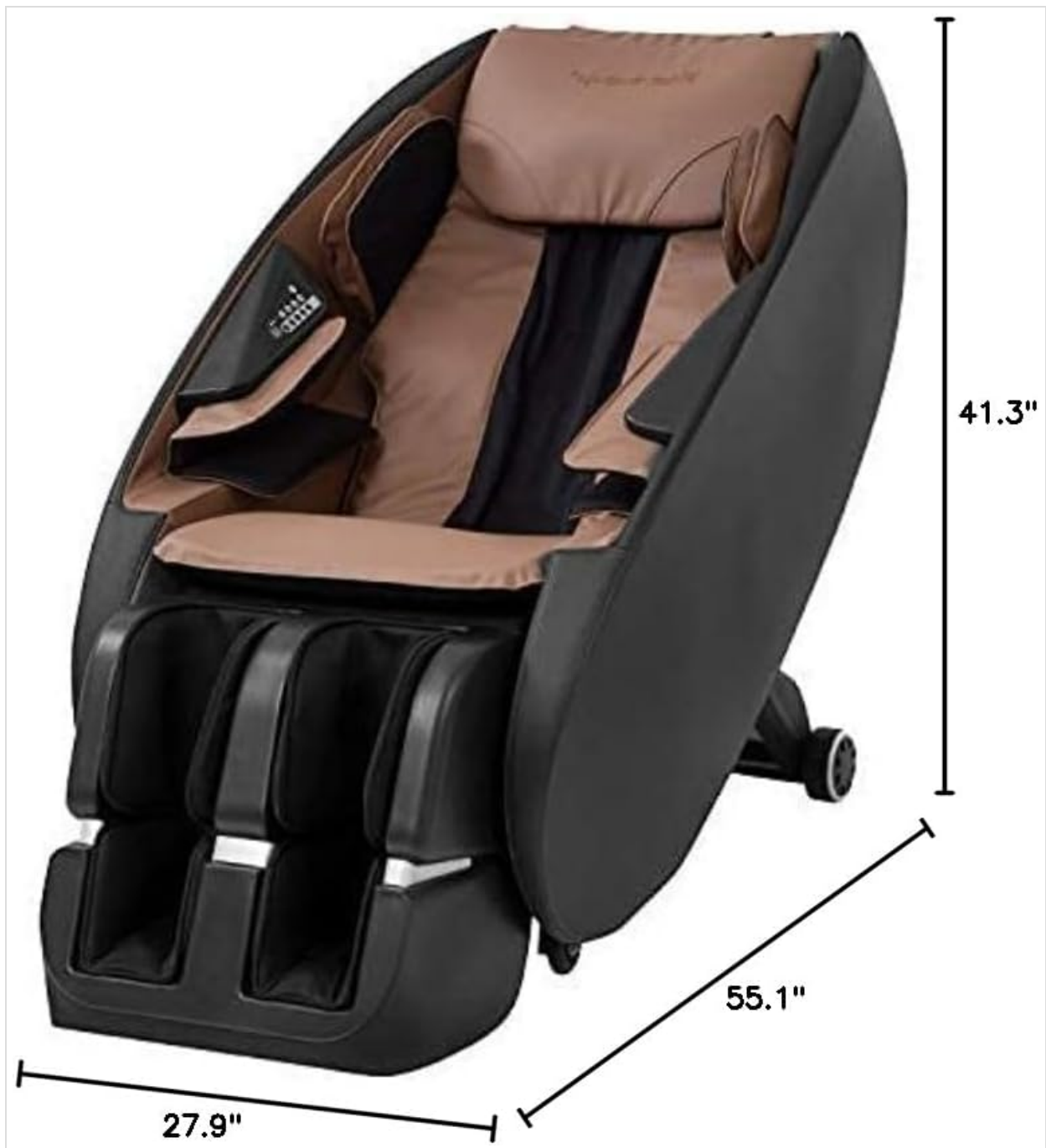
Figure 7: Product dimensions for planning placement.