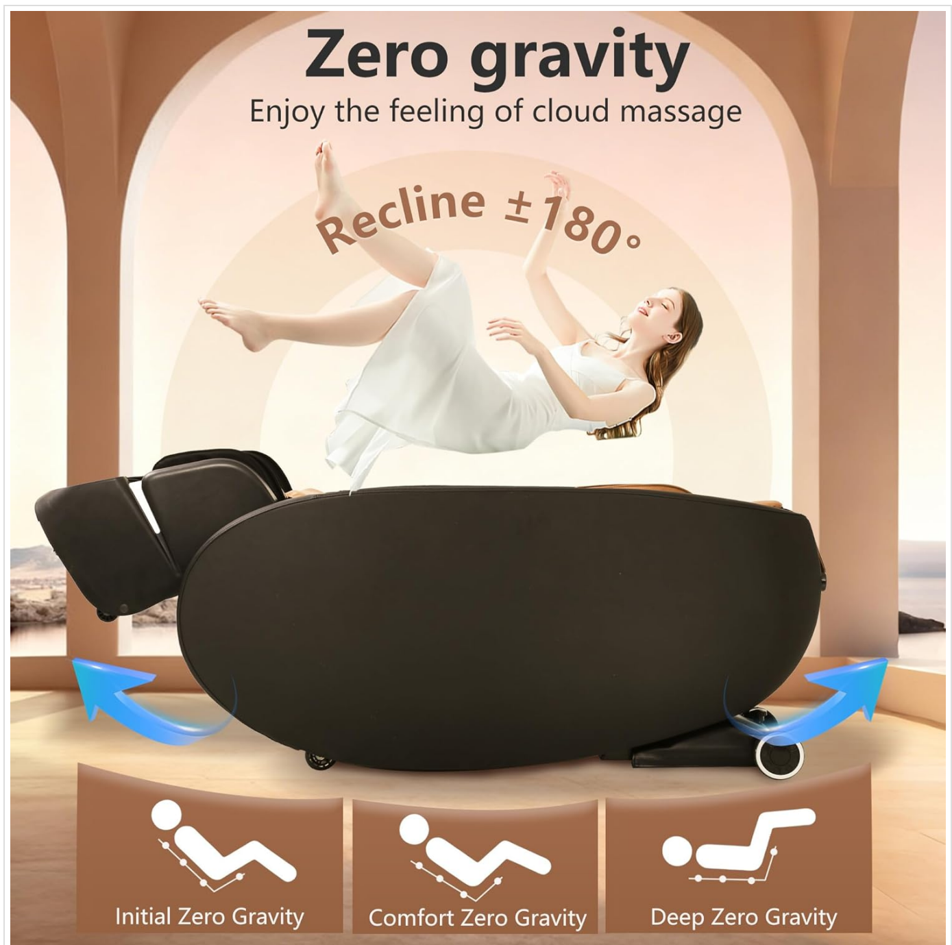
Figure 3: The Zero Gravity feature, illustrating the various recline angles for optimal relaxation.