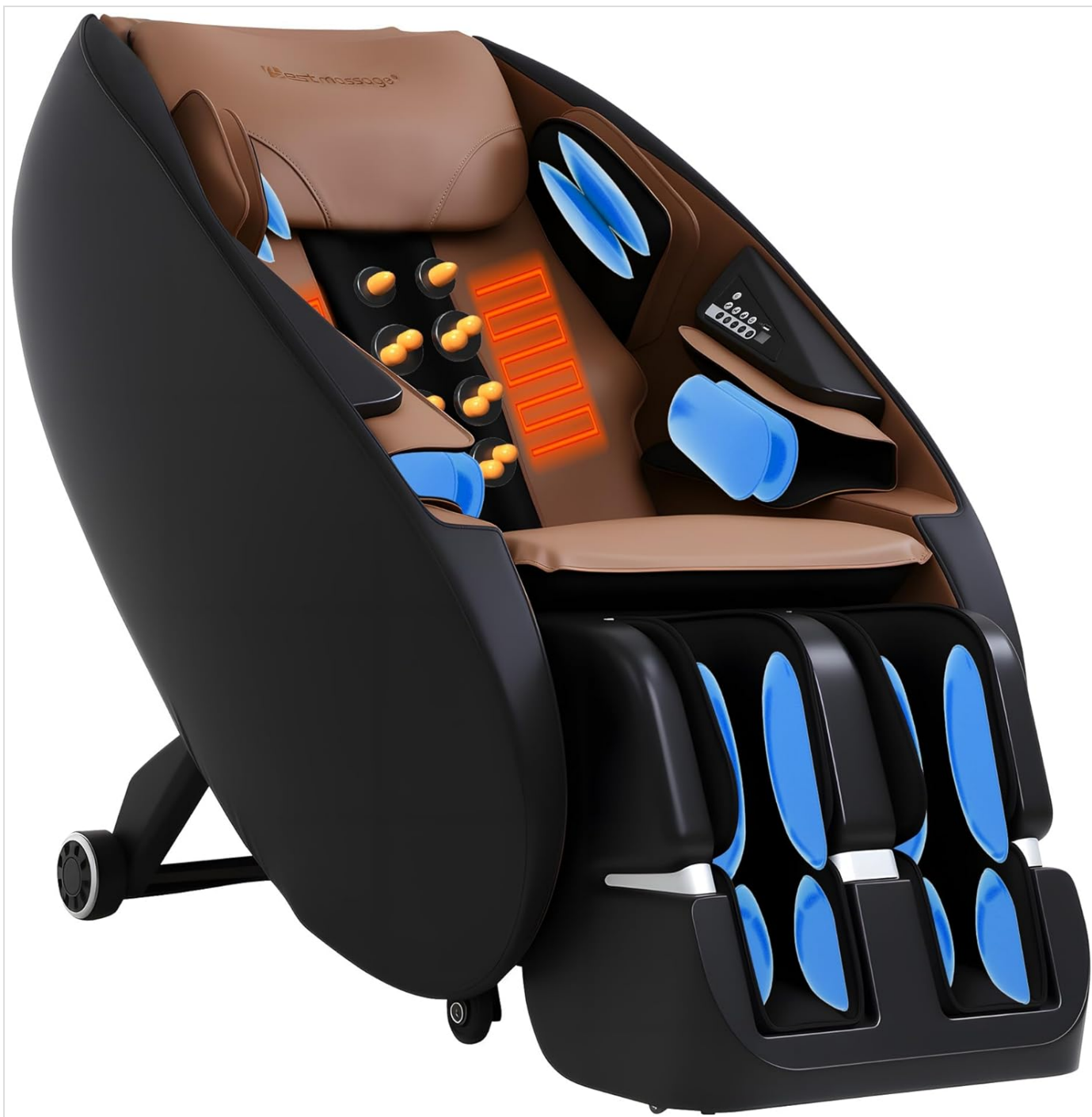
Figure 1: The FDW 2025 Shiatsu Massage Chair, showcasing its design and color.