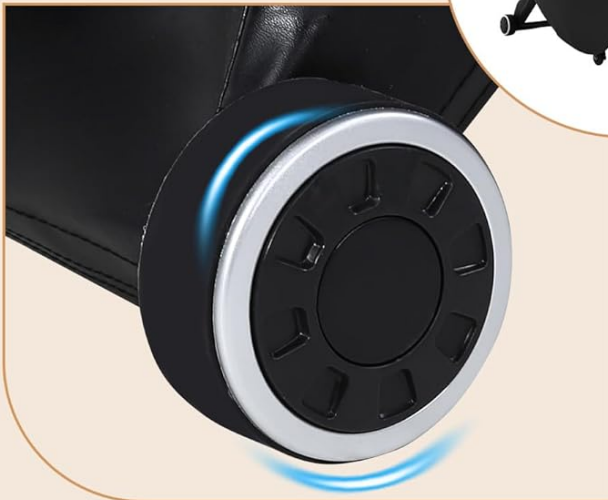
Smooth PU wheel