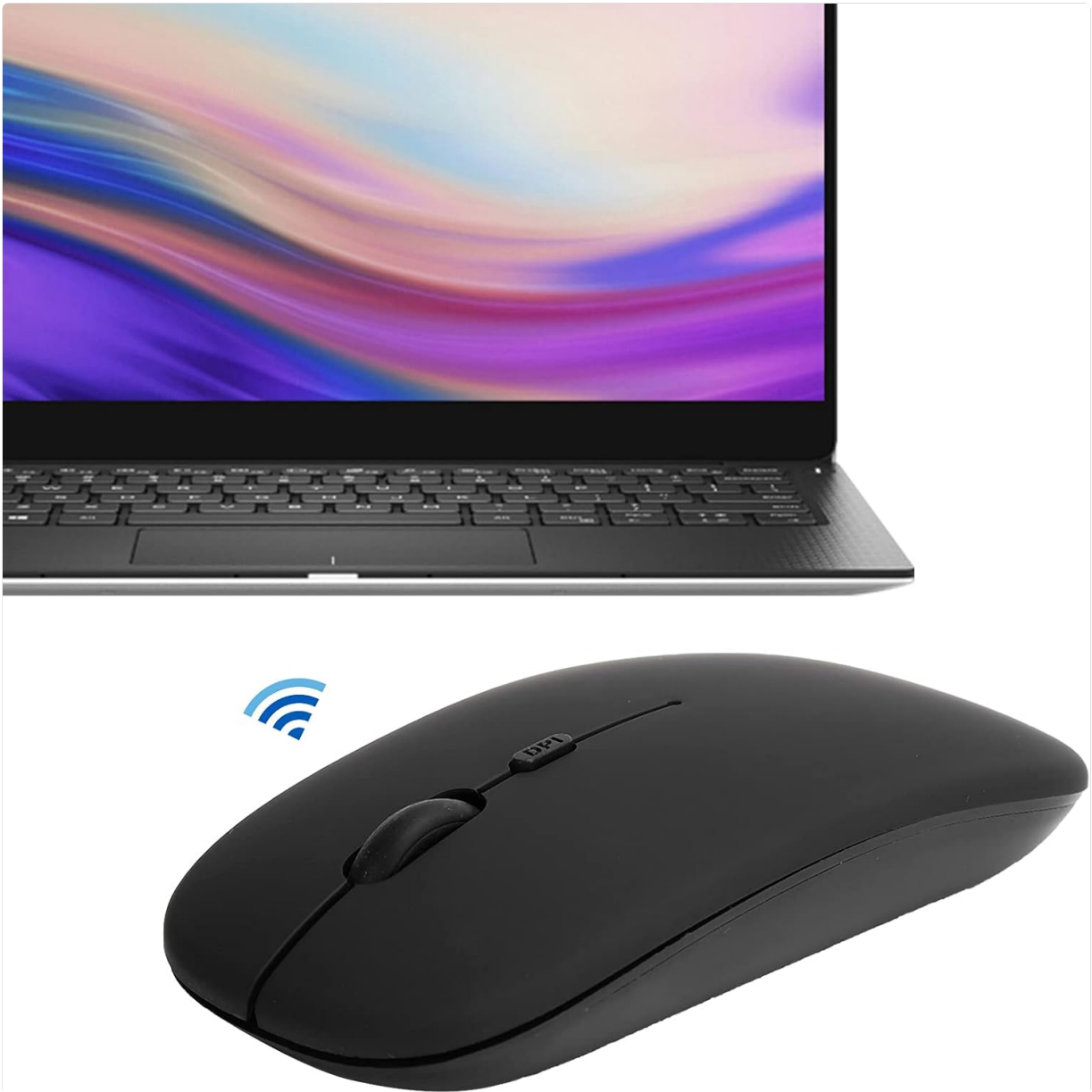
Image: The Vipxyc Wireless Bluetooth Mouse positioned next to a laptop, with a graphic overlay of a wireless signal icon, symbolizing its Bluetooth connectivity.