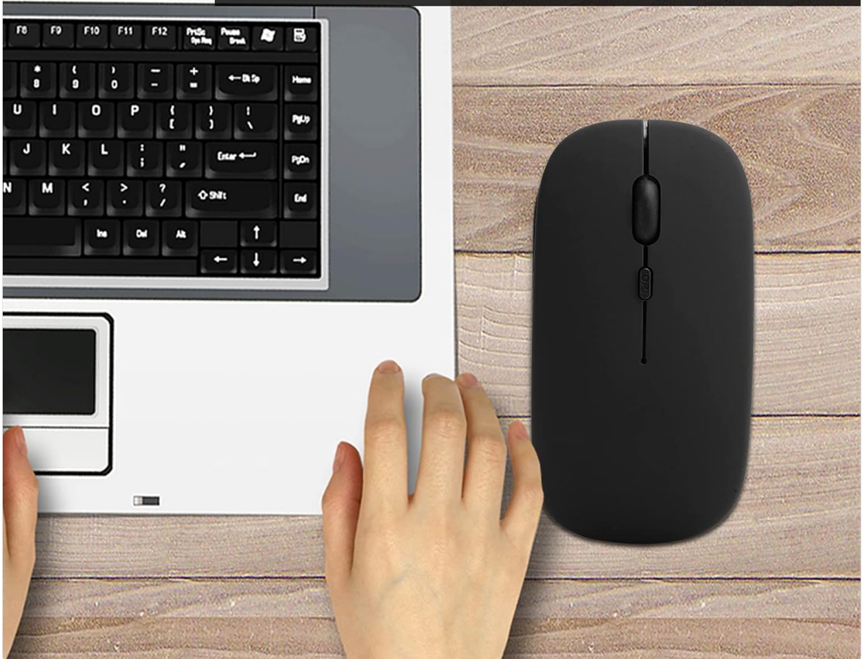
Image: The Vipxyc Wireless Bluetooth Mouse shown on a wooden desk alongside a laptop, illustrating its use with advanced optical tracking technology. This setup is suitable for laptops, OS X/Mi/Samsung devices, and other compatible devices.

Suitable for laptops, for OS X/Mi/Samsung and other devices.