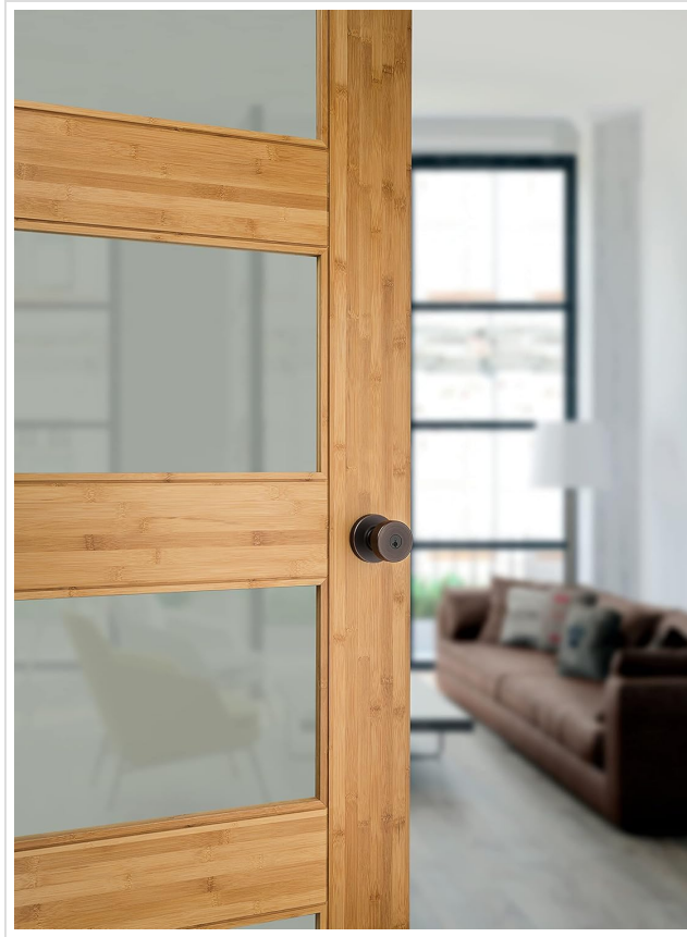
Figure 4: The Pismo Round Keyed Entry Knob shown installed on a modern wooden door, demonstrating its aesthetic integration.