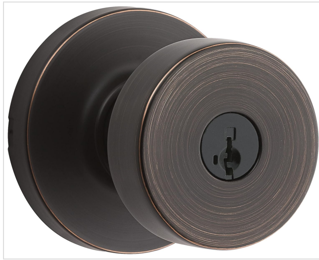
Figure 1: Front view of the Pismo Round Keyed Entry Knob, showing the keyhole and Venetian Bronze finish.