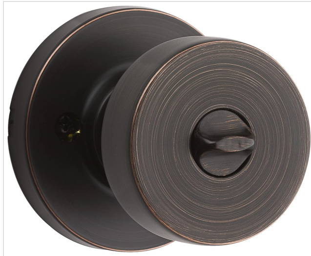
Figure 2: Back view of the Pismo Round Keyed Entry Knob, showing the thumb turn for interior locking.