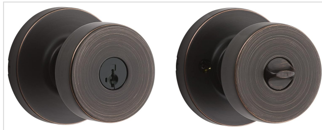
Figure 3: Side-by-side comparison of the Pismo Round Keyed Entry Knob, displaying both the exterior keyhole and interior thumb turn.