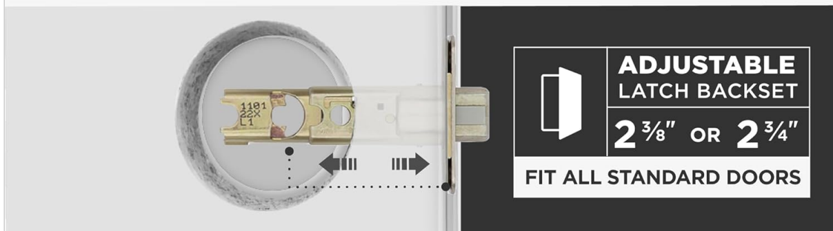
Image: A diagram detailing the dimensions of the Kwikset Casey Bed and Bath Lever, including the 4.1" L x 2.4" W product dimensions and an adjustable latch backset feature that fits standard doors with 2-3/8" or 2-3/4" backset.