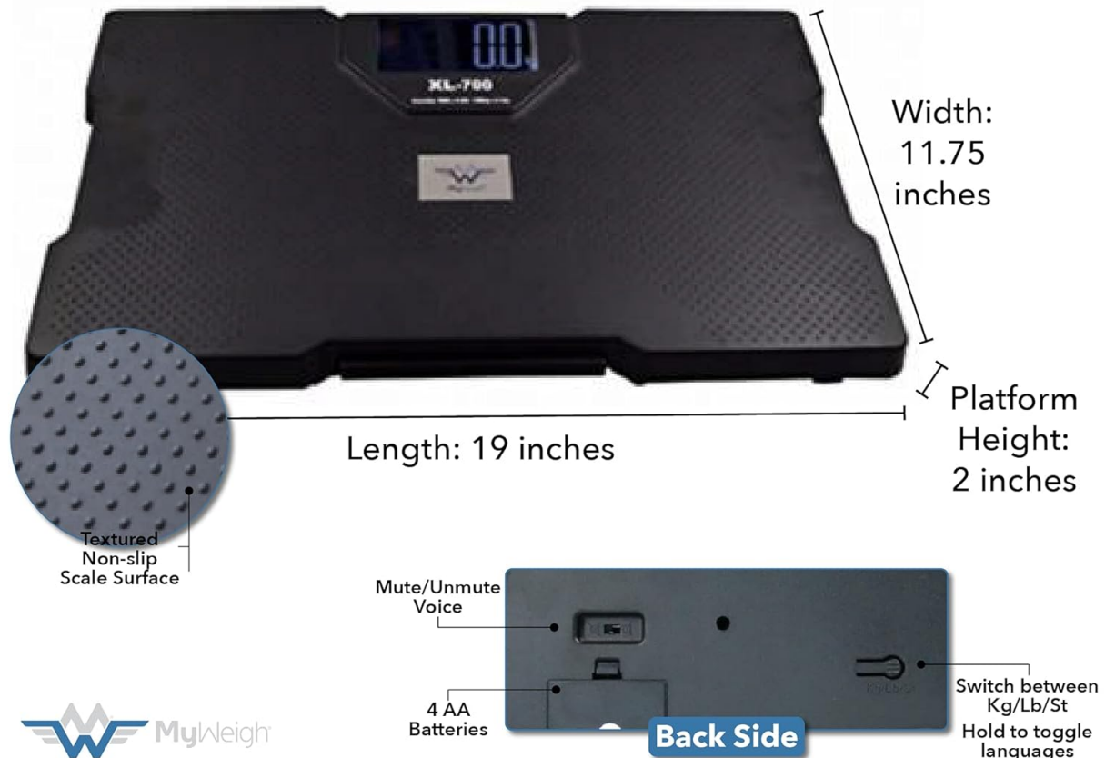
Image 3: Underside of the scale showing battery compartment and unit/voice controls.

The sleek black comfortable non-slip textured platform measures 19" long by 11.75" wide and the reinforced bracing minimizes mechanical deviation