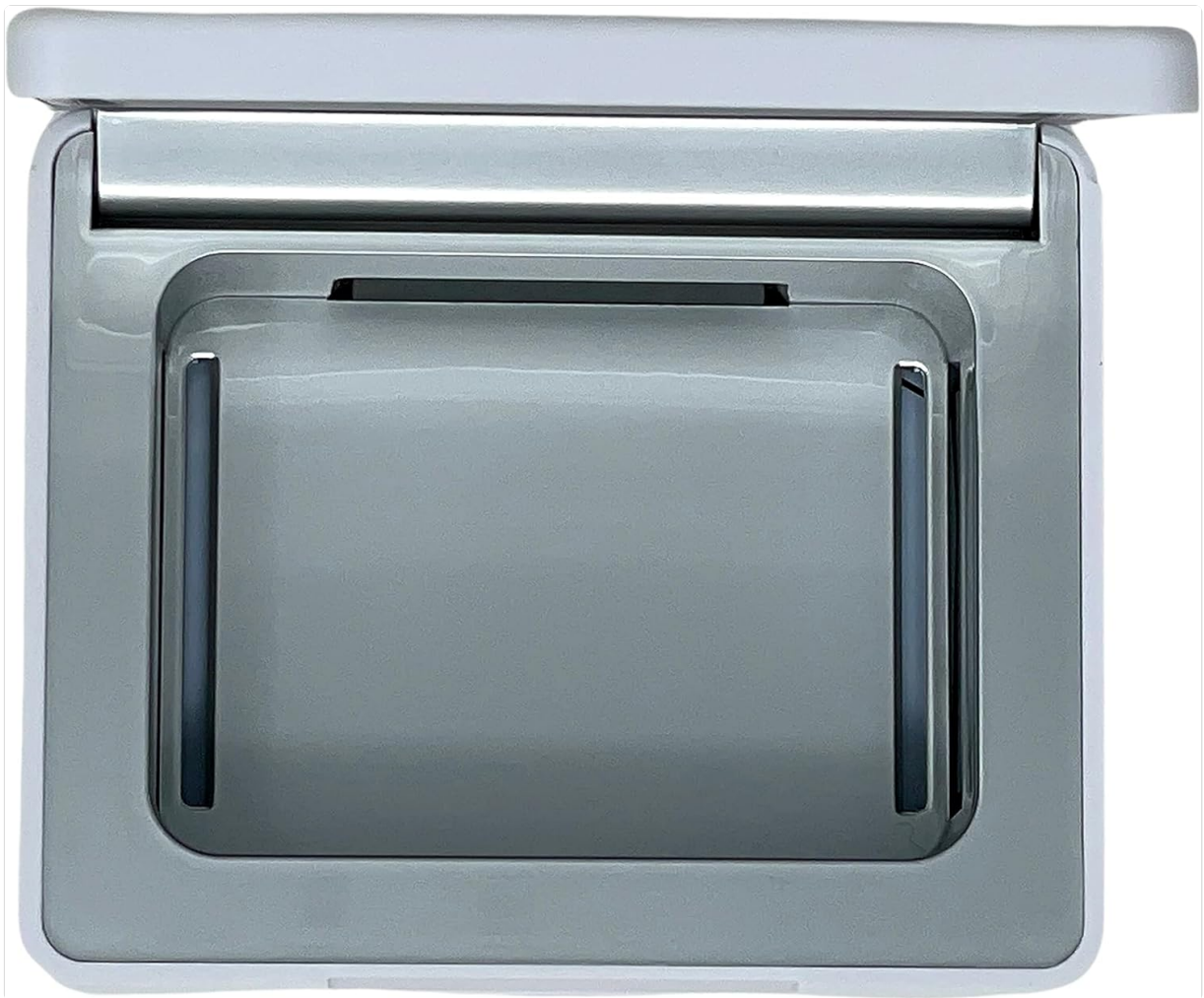
Figure 3: Open PerfectDry LUX drying chamber