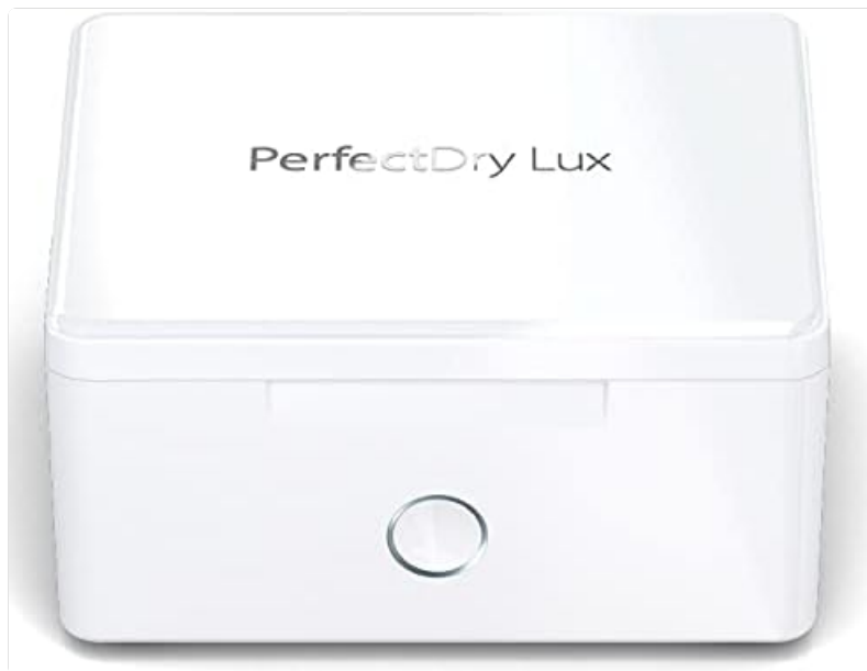
Figure 2: PerfectDry LUX with USB cable and power adapter