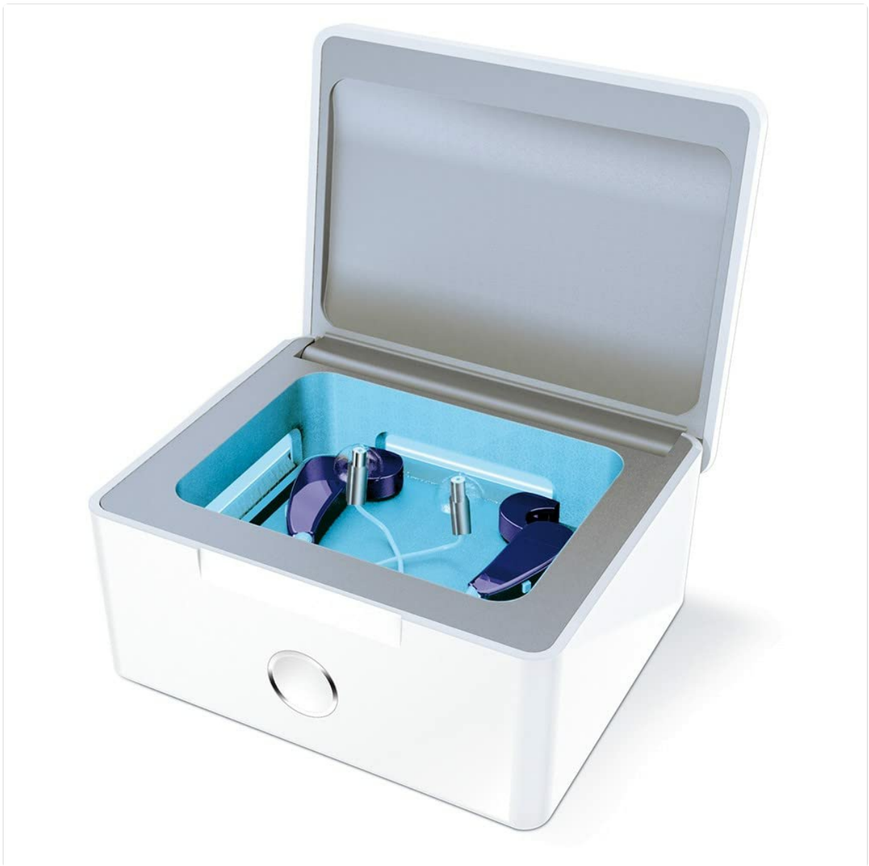
Figure 1: PerfectDry LUX Hearing Aid Dryer