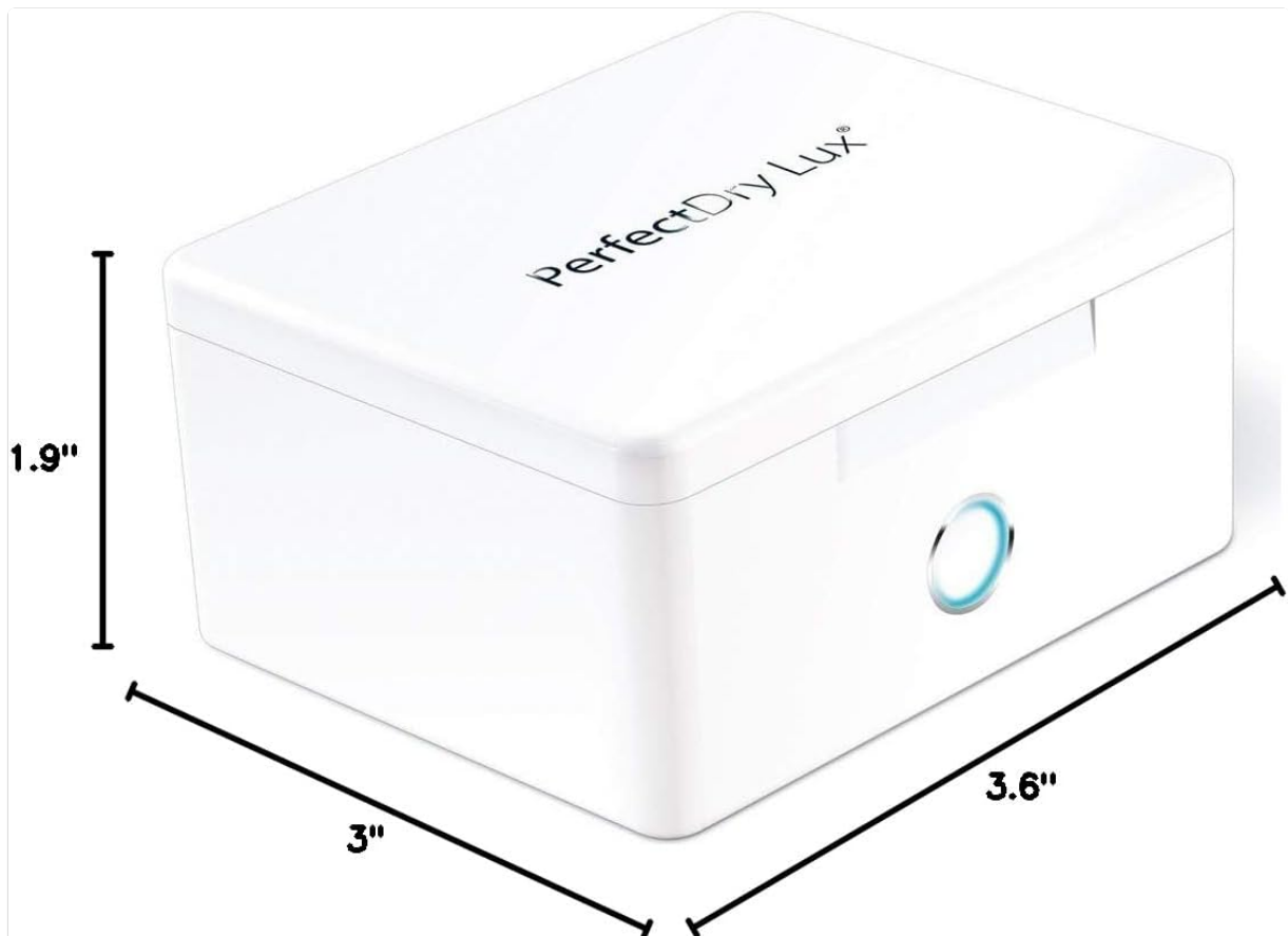
Figure 6: Dimensions of the PerfectDry LUX device