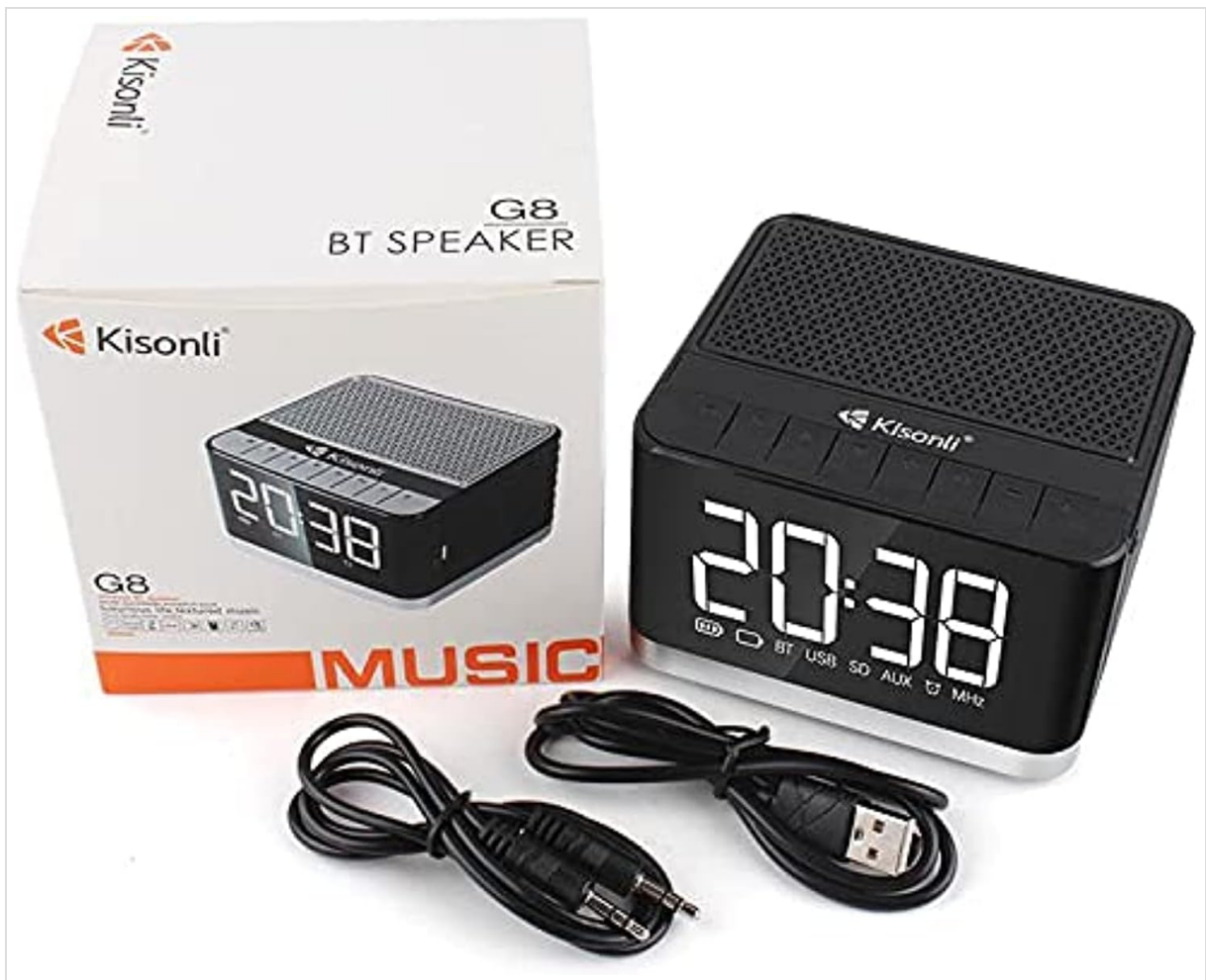
Image: The Kisonli G8 Wireless Alarm Speaker shown with its retail packaging and included cables.