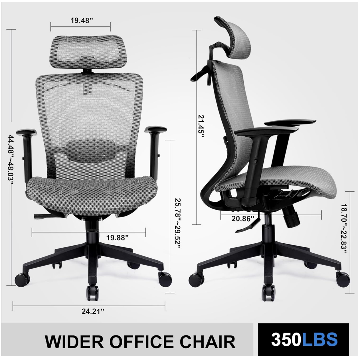
Image: Chair dimensions and overall structure, useful for assembly reference.