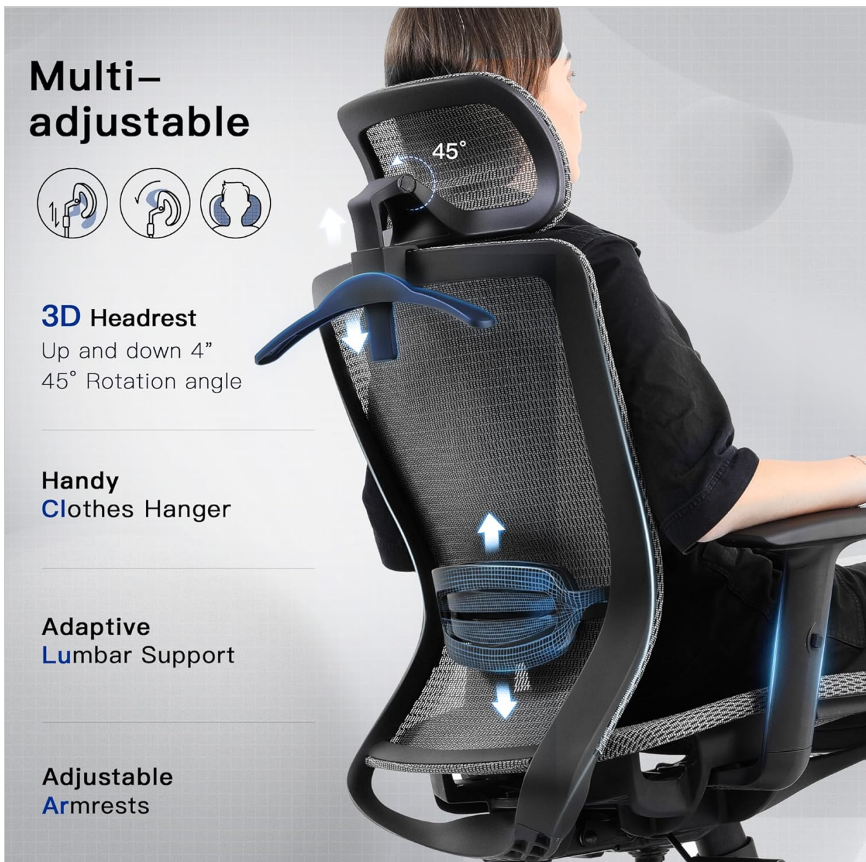
Image: Overview of multi-adjustable features.