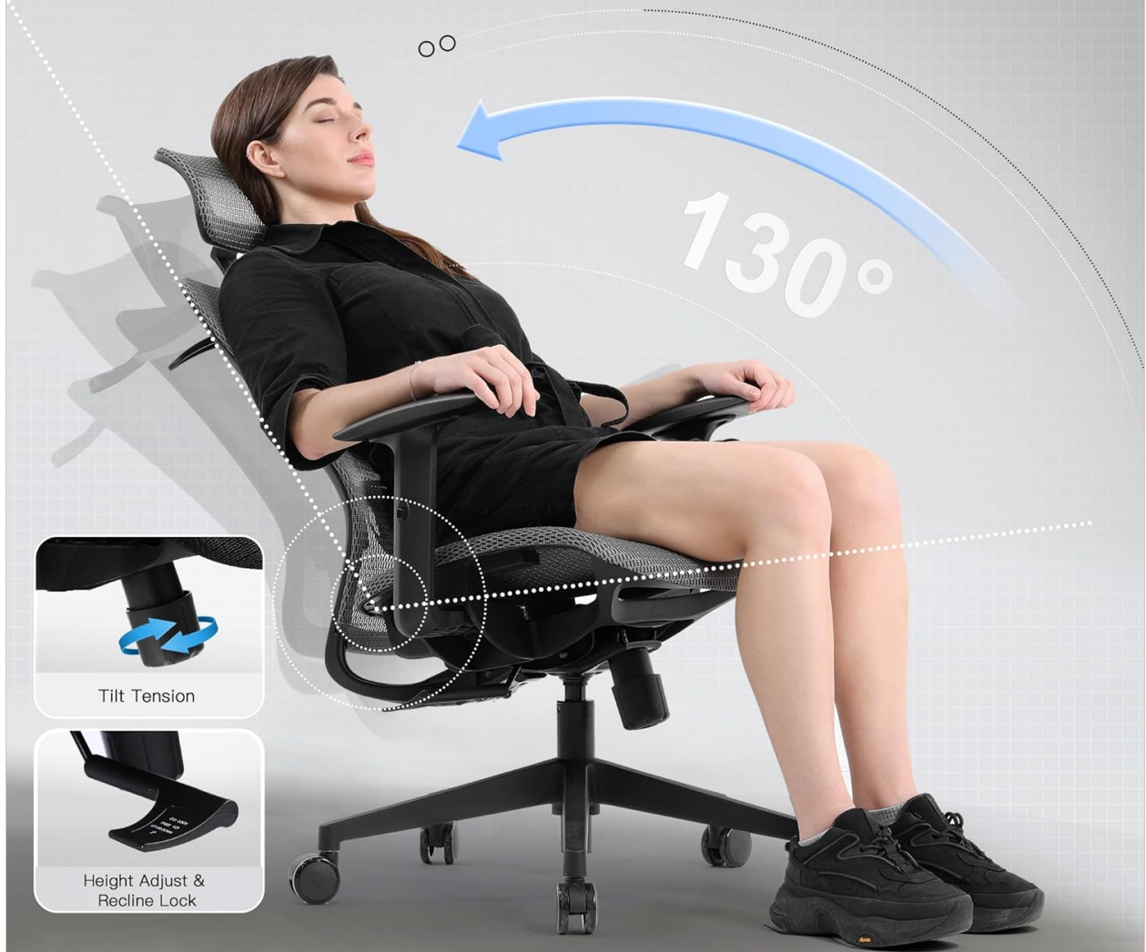
Image: Reclining angles and controls.

3-Level Gear Lock, take a step back and relax from work