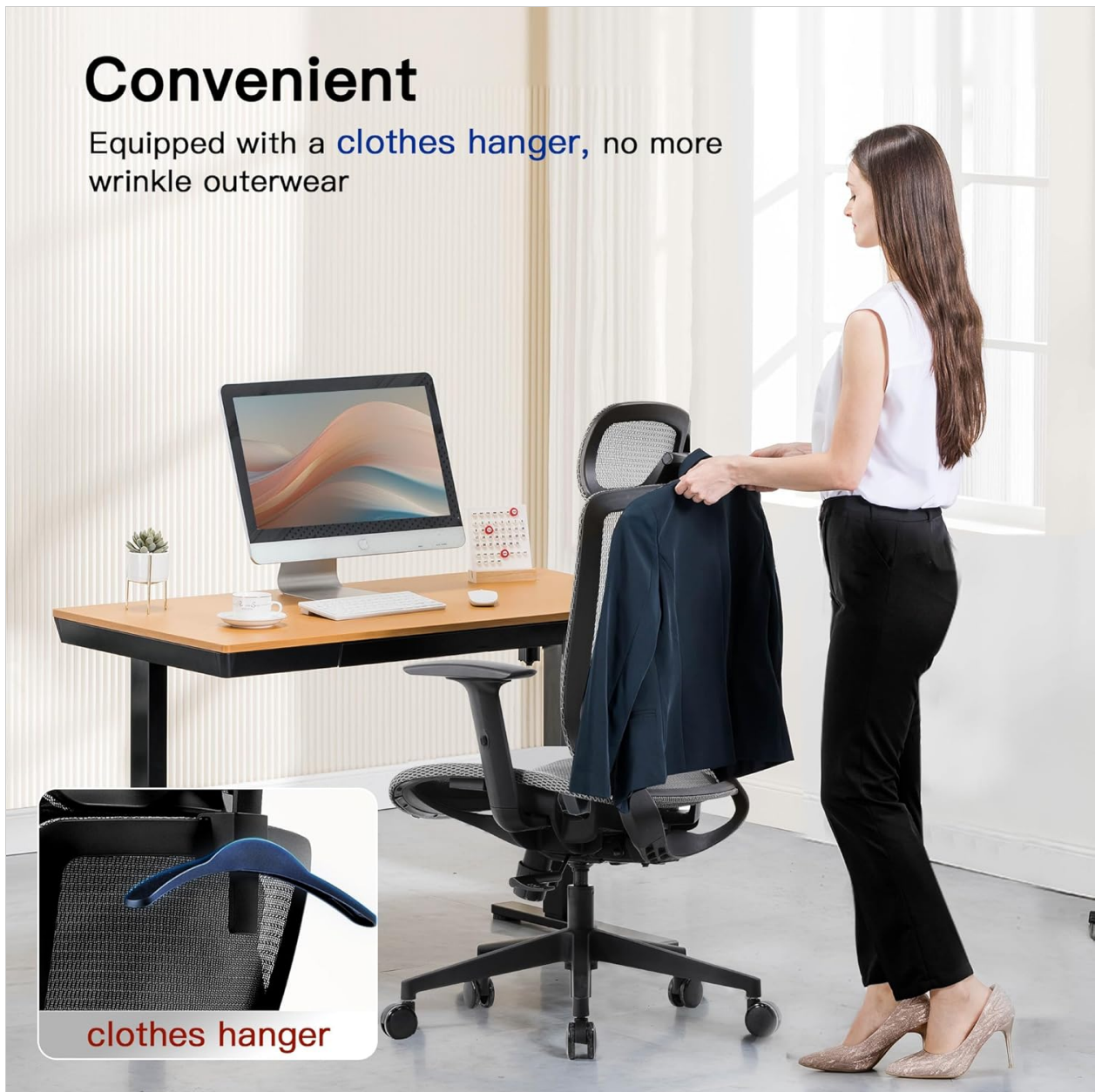
Image: Clothes hanger feature.

Equipped with a clothes hanger , no more wrinkle outerwear