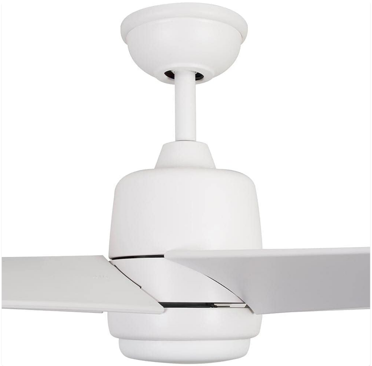
Image 1.1: Hampton Bay Mena 54-inch Ceiling Fan, showcasing its modern design and matte white finish.