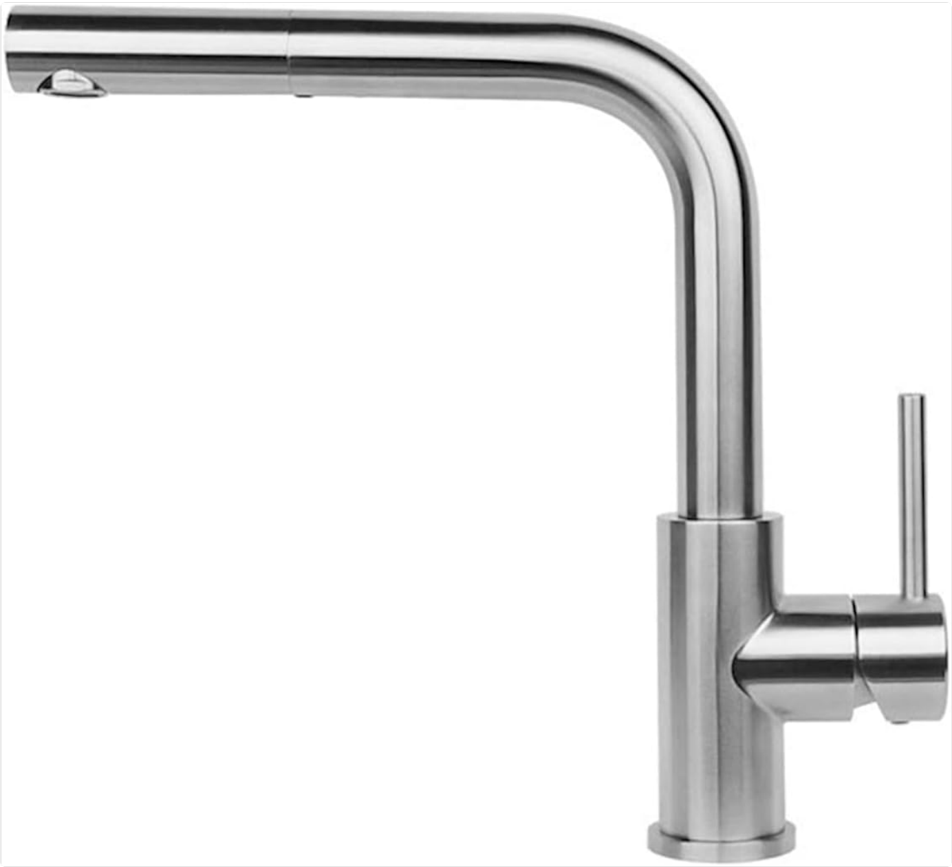
Figure 1: Reginox R34583 PALM Mixer Tap, showcasing its brushed stainless steel finish and integrated pull-out spout.