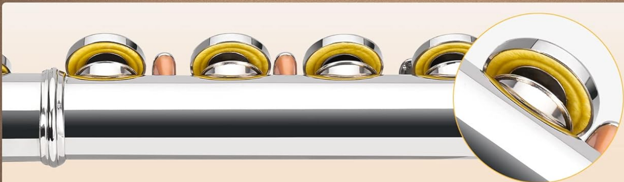
Sheep Casing Pads