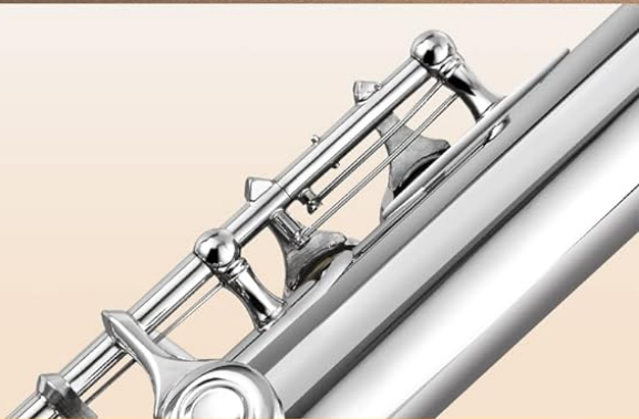
NAS High Carbon Steel Needles