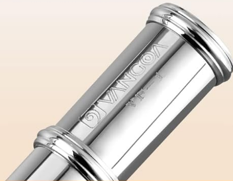
Laser Engraving Logo