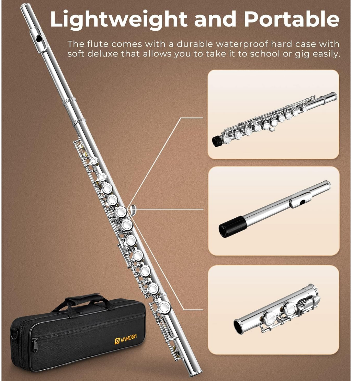
Figure 2: The Vango VF-1 C Flute assembled and ready for use, shown with its protective hard case.

The flute comes with a durable waterproof hard case with soft deluxe that allows you to take it to school or gig easily.