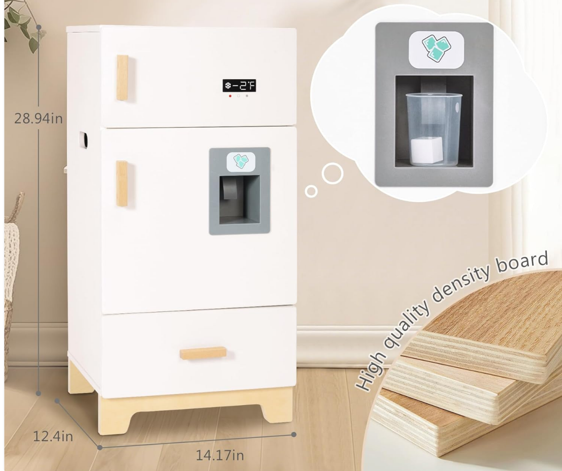
Figure 5: Product dimensions for the labebe Wooden Play Fridge Freezer.