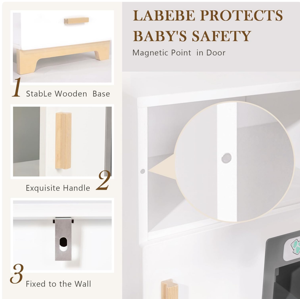
Figure 2: Key safety features including the stable wooden base, wooden handles, and the wall-fixing device to prevent tipping.

Video 1: Detailed installation demonstration for the labebe Wooden Play Fridge Freezer.