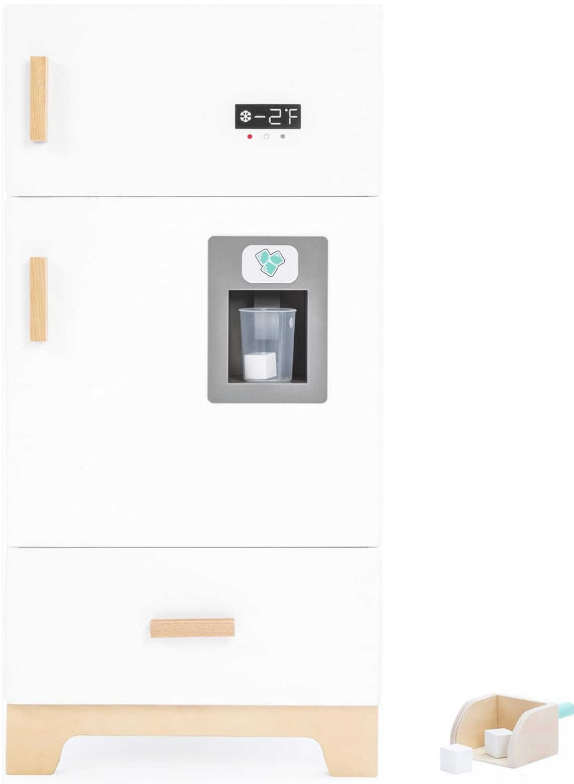
Figure 1: Front view of the labebe Wooden Play Fridge Freezer, showcasing its design and included ice scoop.