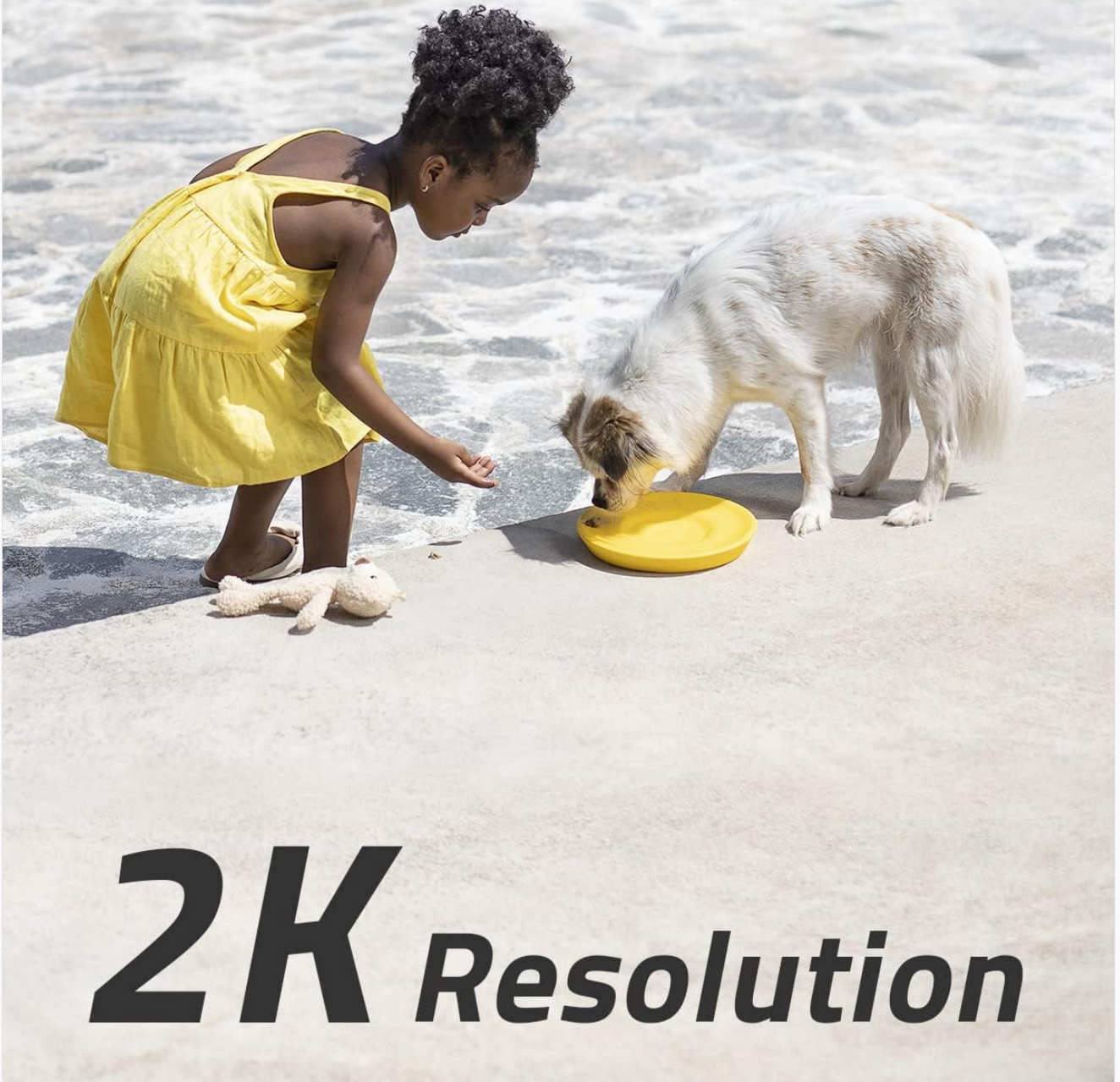
Image: A scene demonstrating the clarity of 2K resolution, capturing fine details of a child and a dog.