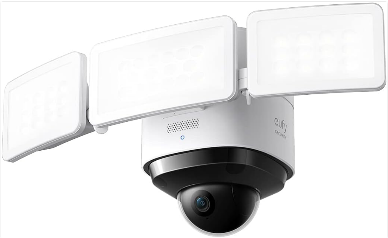
Image: The eufy Security Floodlight Cam S330, featuring a central camera unit with two adjustable floodlight panels.