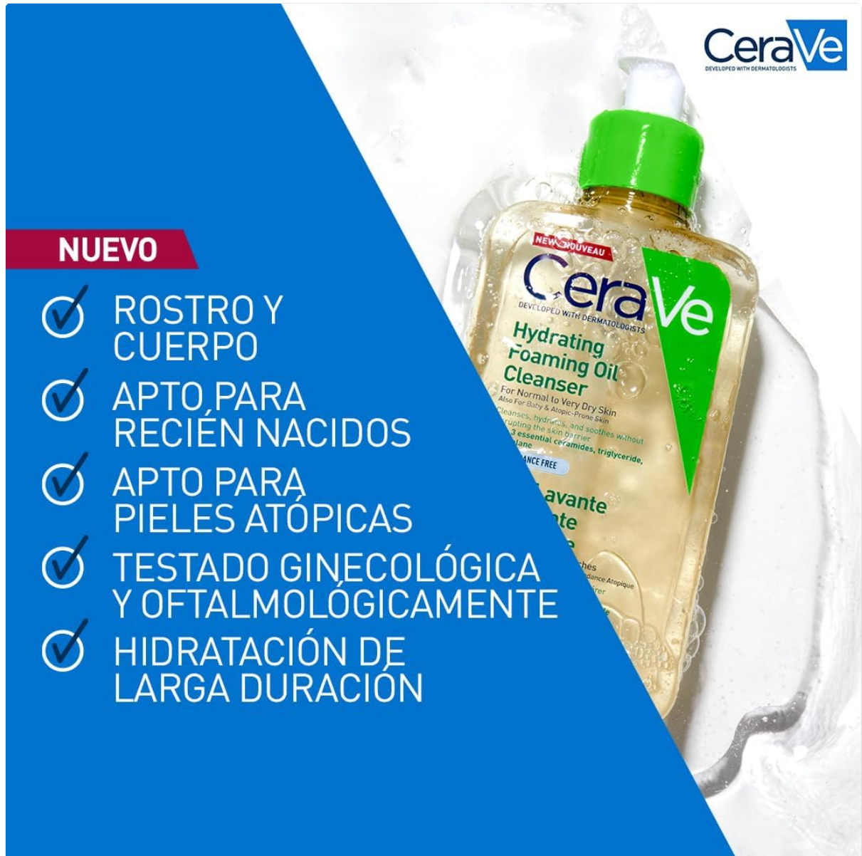
Image: Visual representation of product features, highlighting suitability for face and body, newborns, atopic skin, gynecological and ophthalmological testing, and long-lasting hydration.