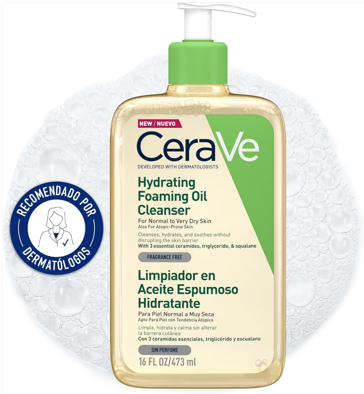
Image: Front view of the CeraVe Hydrating Foaming Oil Cleanser bottle, showing the product name and key benefits.