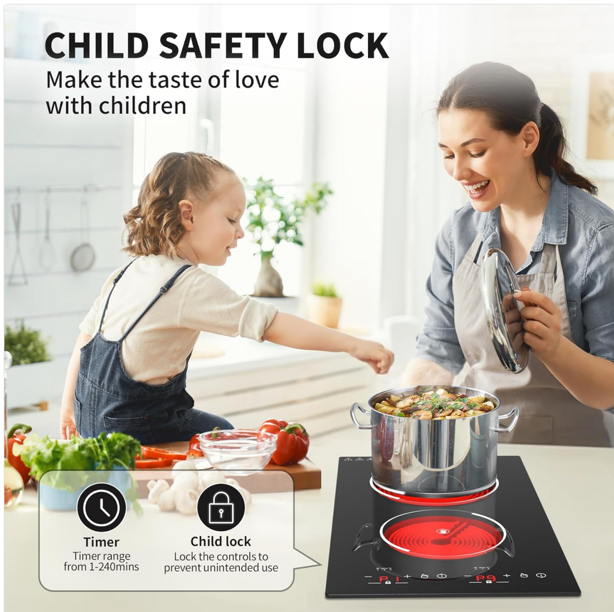
Image: Demonstrates the child safety lock and timer features for safe and convenient cooking.