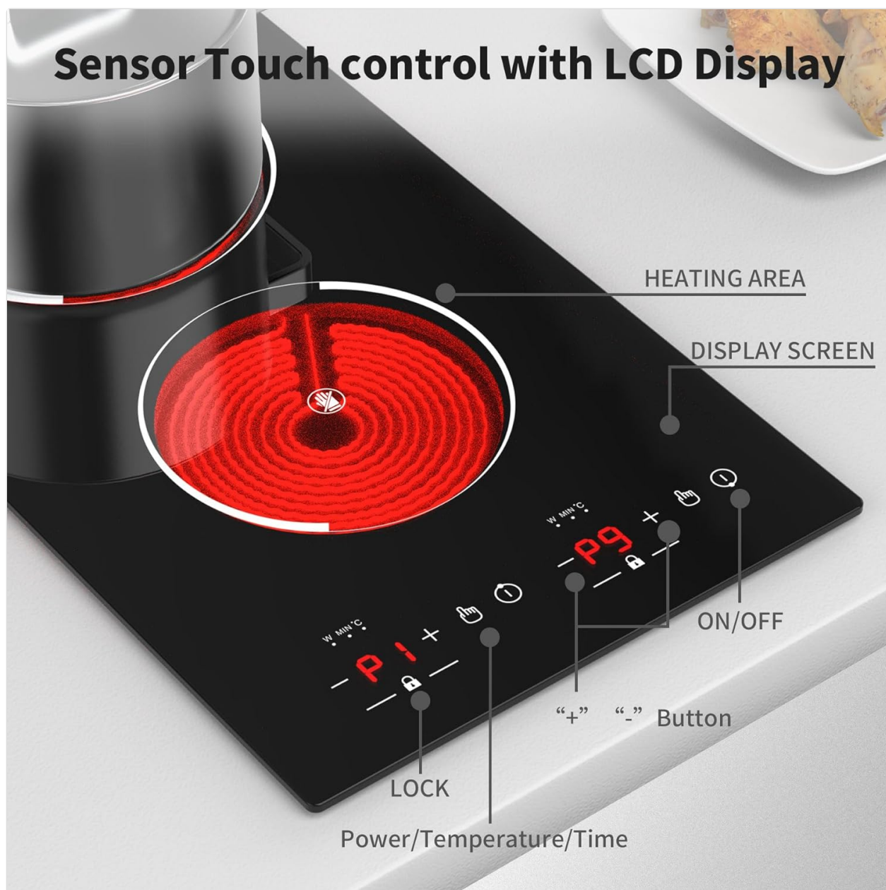
Image: Detailed view of the sensor touch control panel and its functions.

Familiarize yourself with the control panel for optimal use of your cooktop.