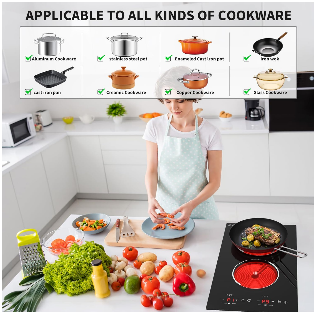
Image: Examples of compatible cookware types for the radiant electric cooktop.