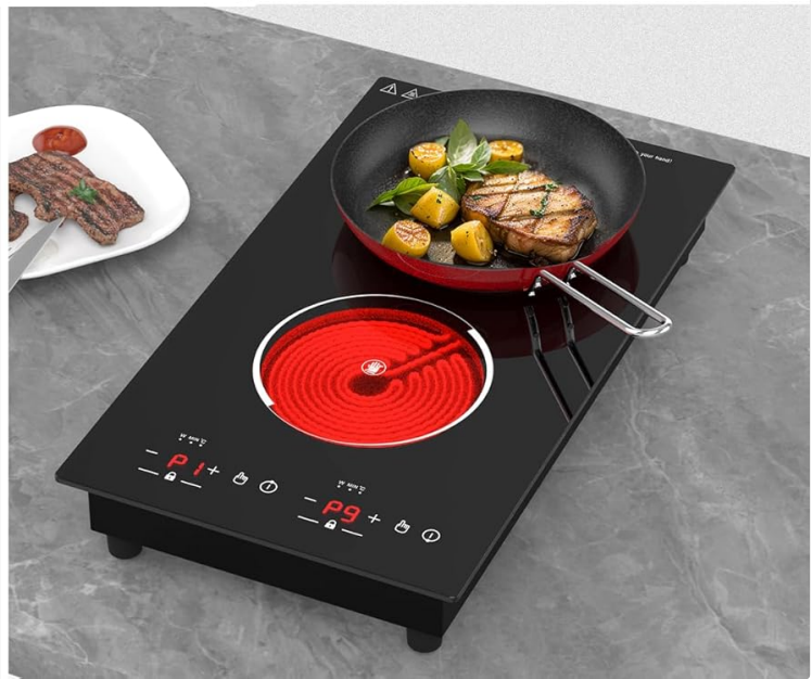
Image: Demonstrates the cooktop's suitability for both built-in and portable countertop use.