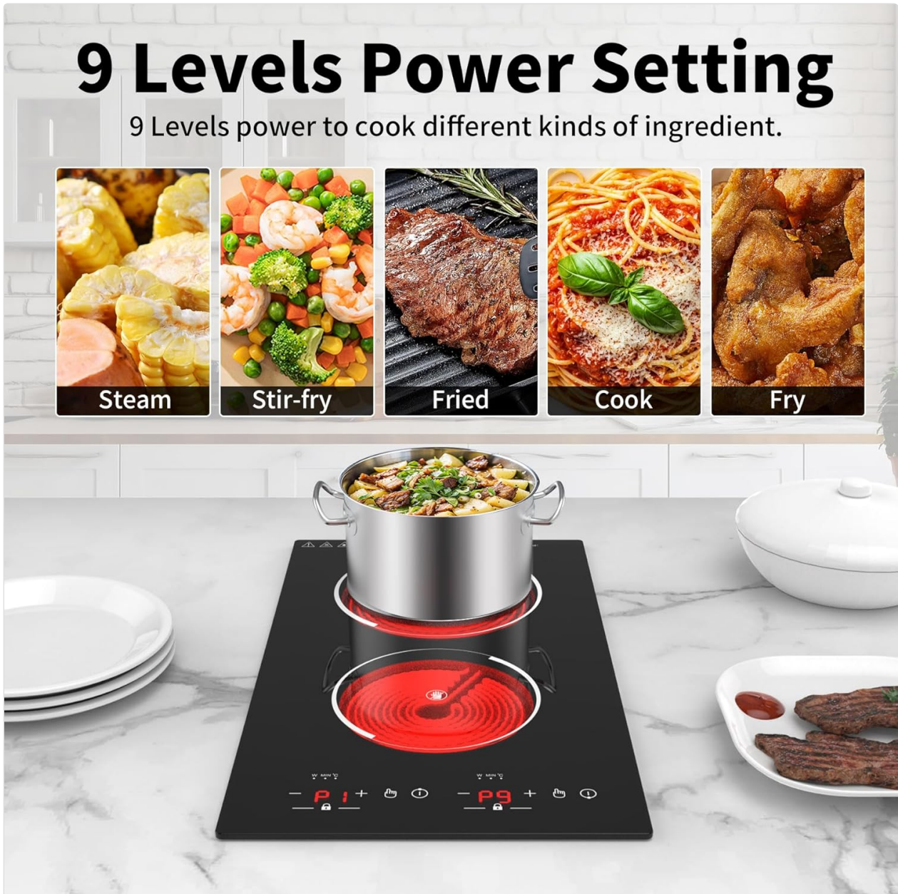
Image: Illustration of 9 power levels for different cooking applications.

Please check your product label for specific voltage.