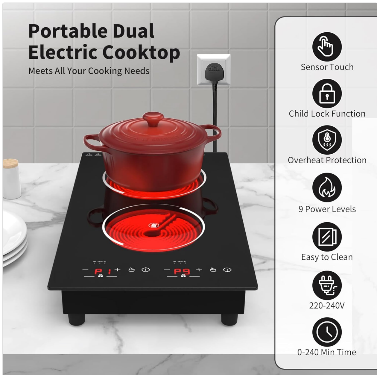
Image: Overview of cooktop features. Note: While this image indicates 220-240V, this manual is for the 110-120V model.