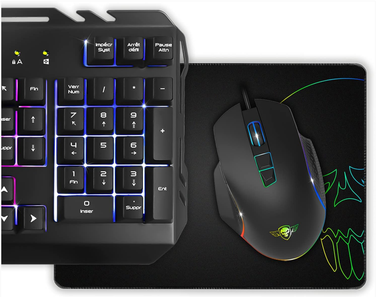
Image: Detailed view of the PRO-MK5 keyboard highlighting its RGB backlighting, slim semi-mechanical keys, and metal chassis.