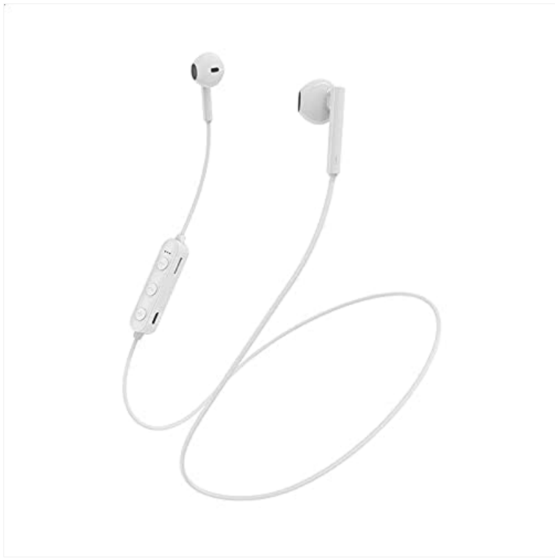
Image 1: Overview of the BOROFONE BE27 earphones, displaying the white earbuds, the inline control unit with buttons, and the connecting cable.

Key components include the earbuds, the inline control unit, and the charging port.