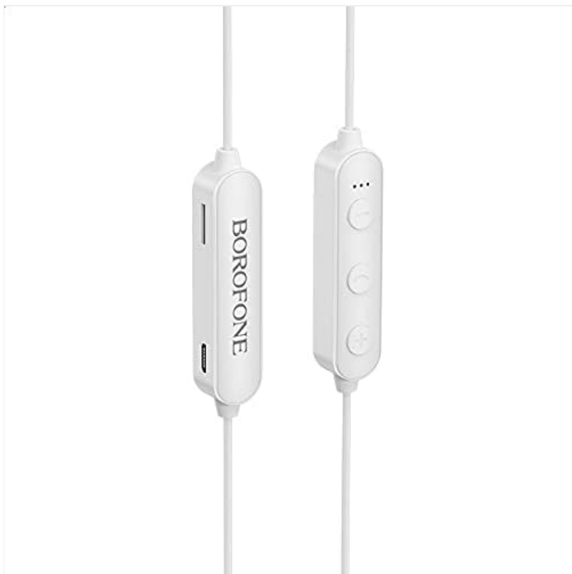
Image 2: Detailed view of the inline control unit, highlighting the volume up/next track button, multi-function button (power/play/pause/answer call), volume down/previous track button, and the Micro USB charging port.

Key components include the earbuds, the inline control unit, and the charging port.