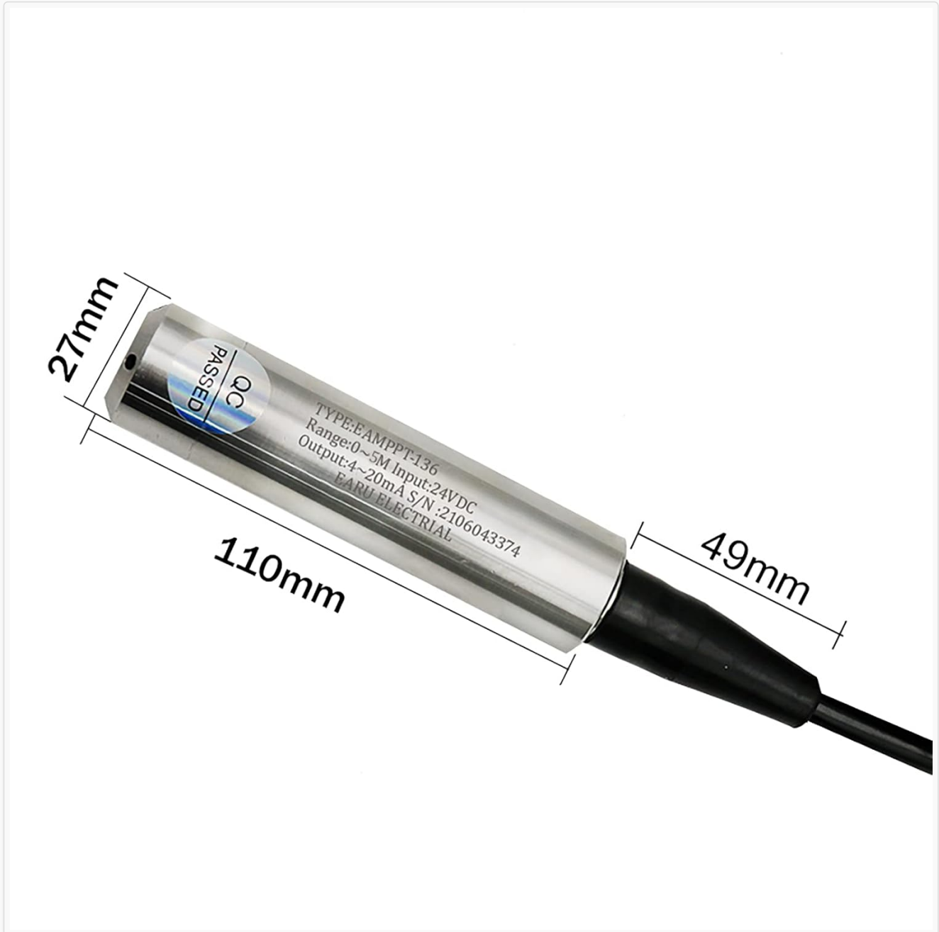
Figure 2: Key dimensions of the level transmitter probe.

This image illustrates the physical dimensions of the sensor probe, showing a length of 110mm, a diameter of 27mm, and a cable connection length of 49mm.