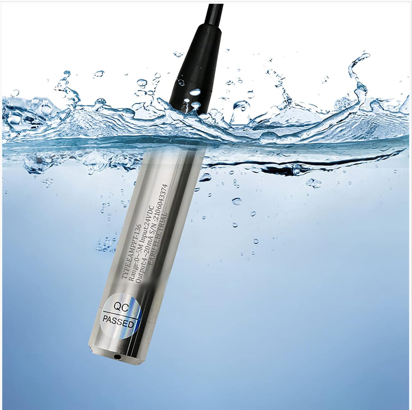
Figure 3: Level transmitter probe submerged in liquid.

This image demonstrates the sensor probe partially submerged in water, indicating its typical operational environment for liquid level detection.