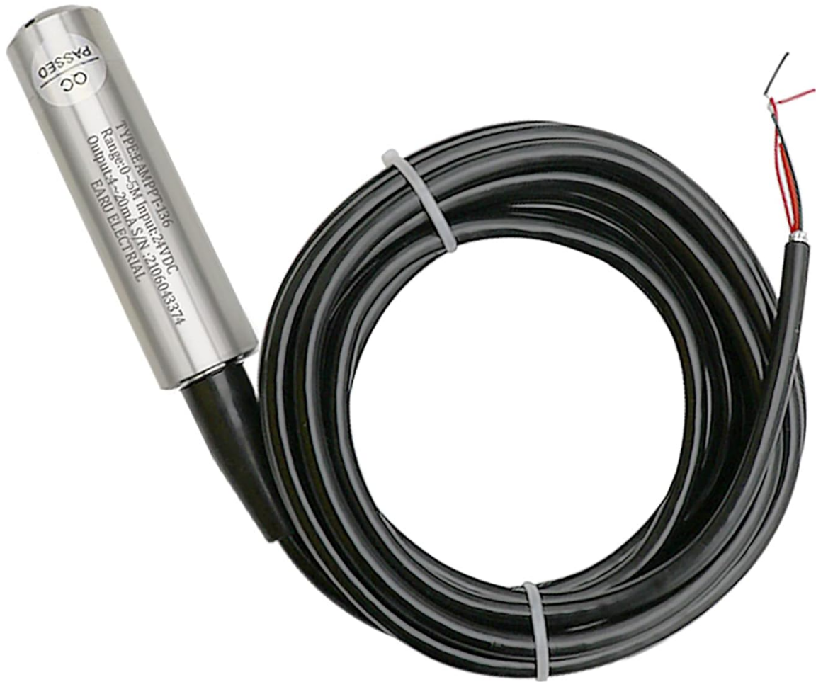
Figure 1: EARUMZDQ 4-20MA Output Integral Level Transmitter with cable.

This image displays the complete level transmitter unit, featuring the stainless steel probe and the coiled 6-meter cable with exposed wires for electrical connection.