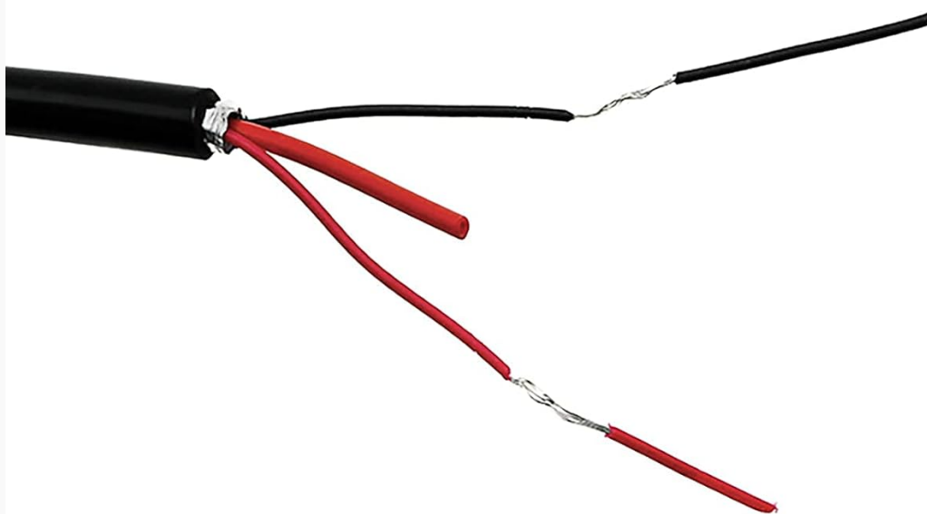
Figure 5: Exposed cable ends for wiring.

This image shows the stripped ends of the sensor's cable, revealing the red (V+) and black (V-) wires ready for electrical connection.