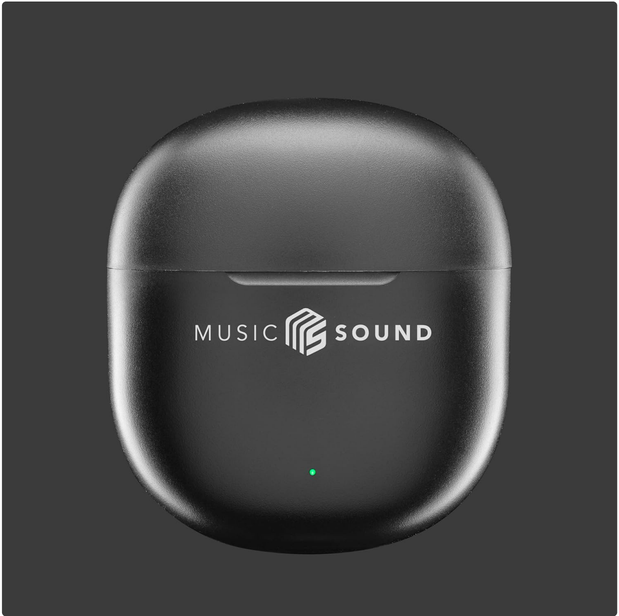
Figure 4.1: Music Sound Breeze Charging Case with LED Indicator.