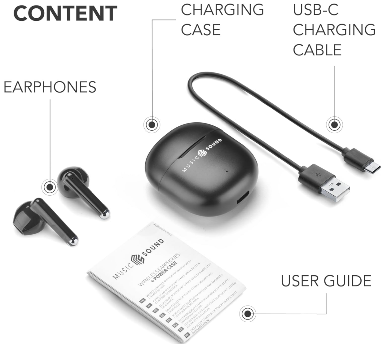
Figure 3.1: Package Contents - Earphones, Charging Case, USB-C Cable, and User Guide.